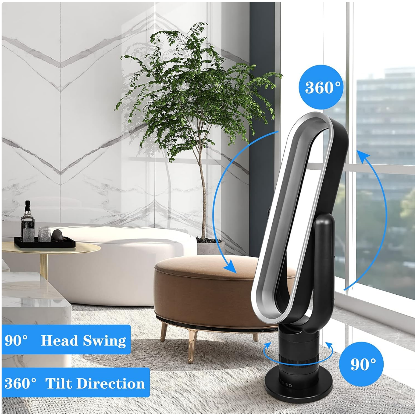
Figure 7: Illustrates the 90-degree oscillation and 360-degree tilt capabilities.