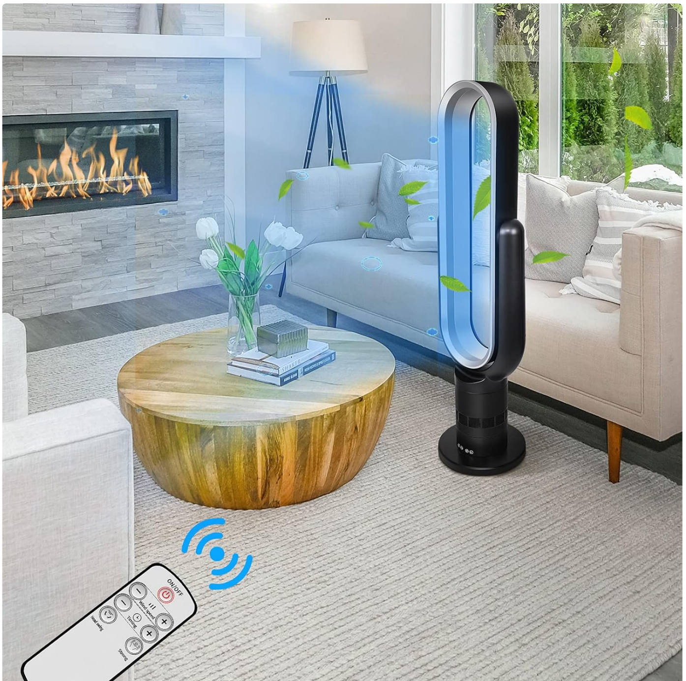
Figure 5: Remote Control.

The control panel on the base includes touch-sensitive buttons for Power, Speed adjustment, Timer, and Oscillation (Sway). A digital display shows the current speed setting. The fan also comes with a remote control for convenient operation from a distance.