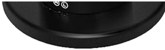
Figure 2: Front view of the HealSmart Bladeless Tower Fan.