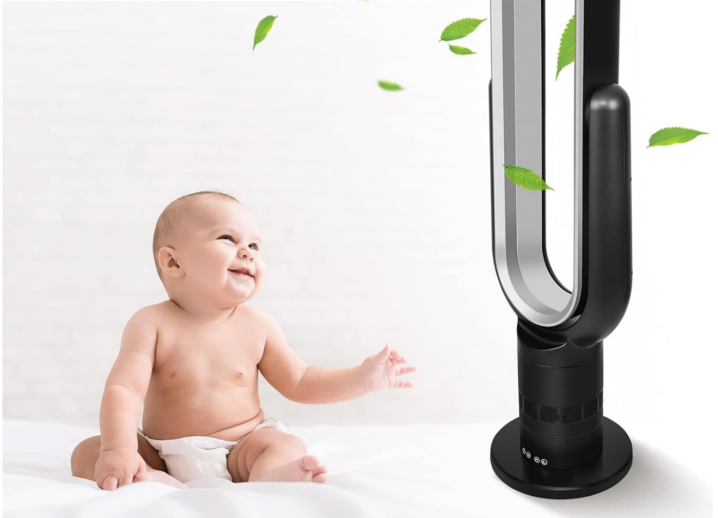
Figure 1: The bladeless design ensures safety for children and pets.

Bladeless fans are design to keep users safe, children are also able to use it with confidence.