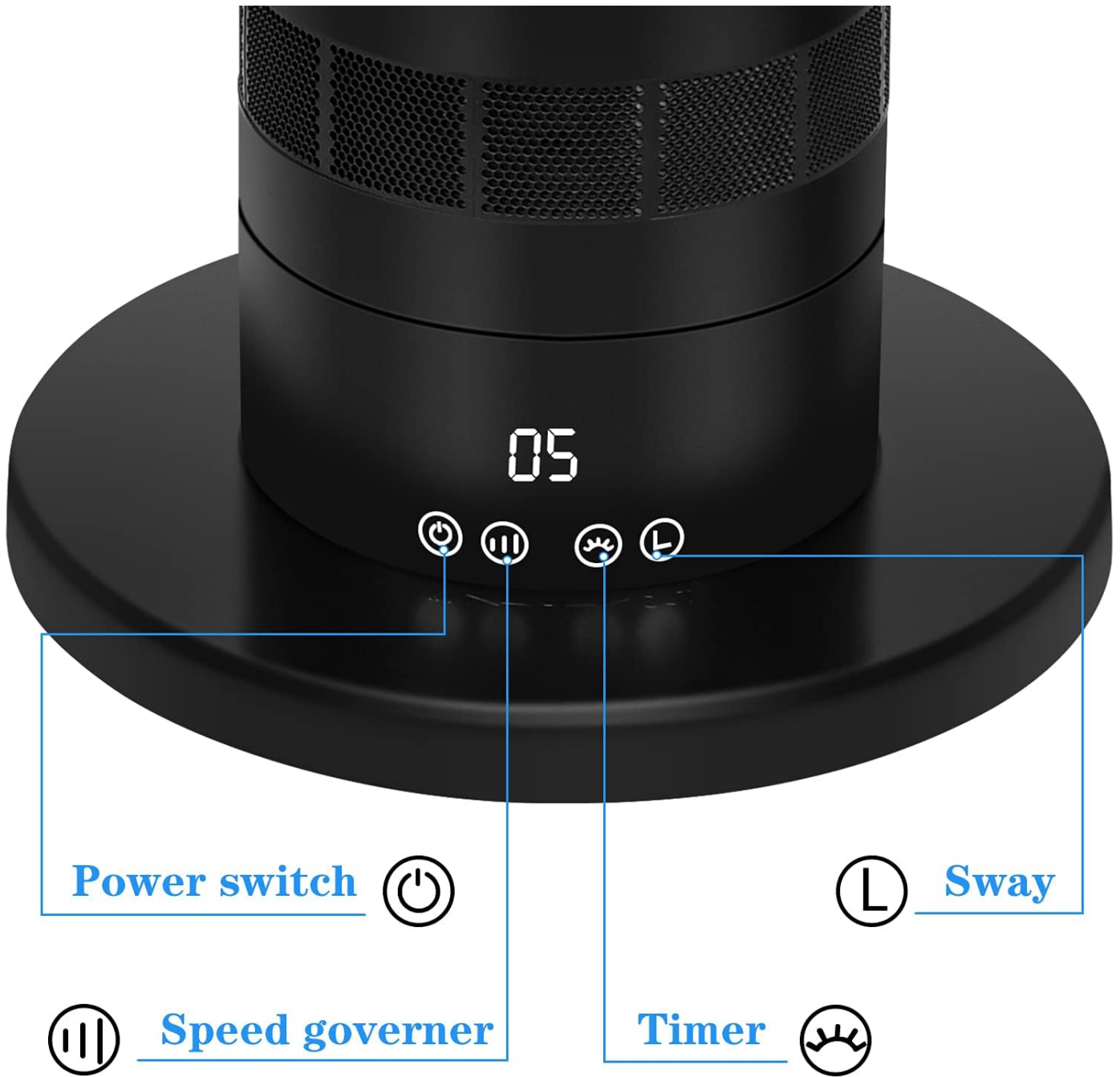
Figure 4: Control Panel Buttons.