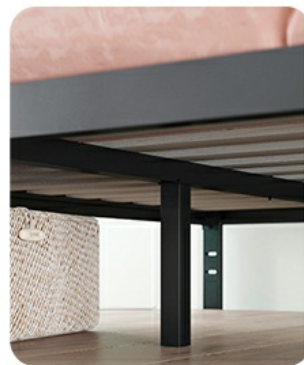
Image: The bed frame does not require a box spring.