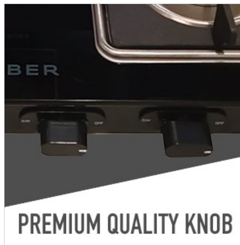
Image 4.3: View of the premium quality control knobs for flame adjustment.