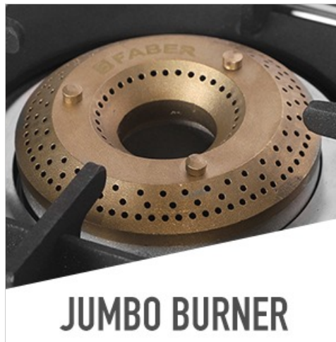
Image 4.1: Detailed view of the jumbo burner, designed for high heat output.