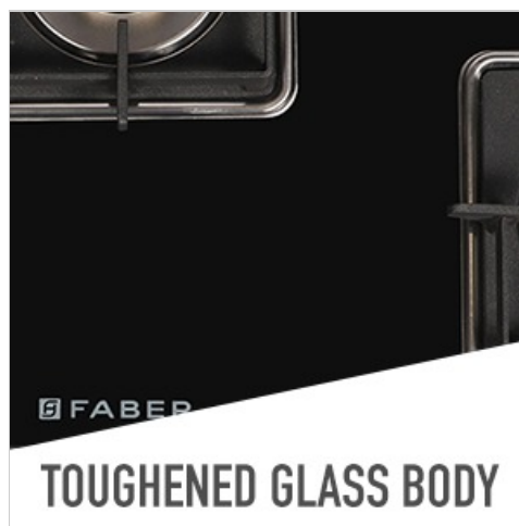
Image 5.1: Detail of the toughened glass body, highlighting its smooth, easy-to-clean surface.