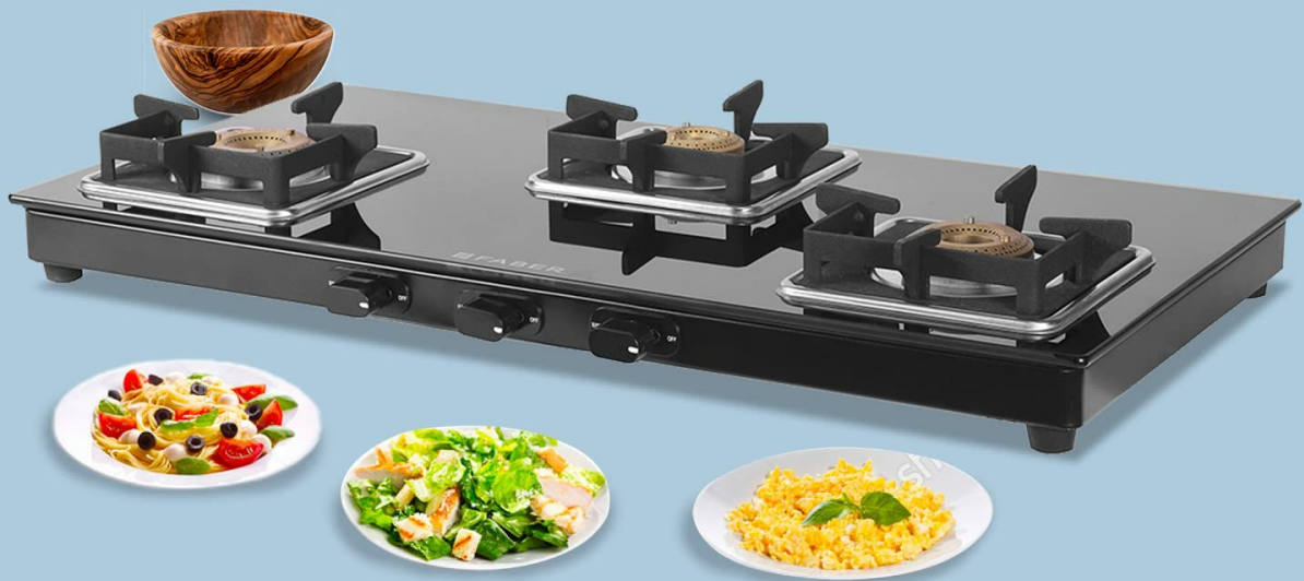
Image 1.1: Faber Remo 3BB BK 3-Burner Gas Stove, showcasing its sleek design and three burners.