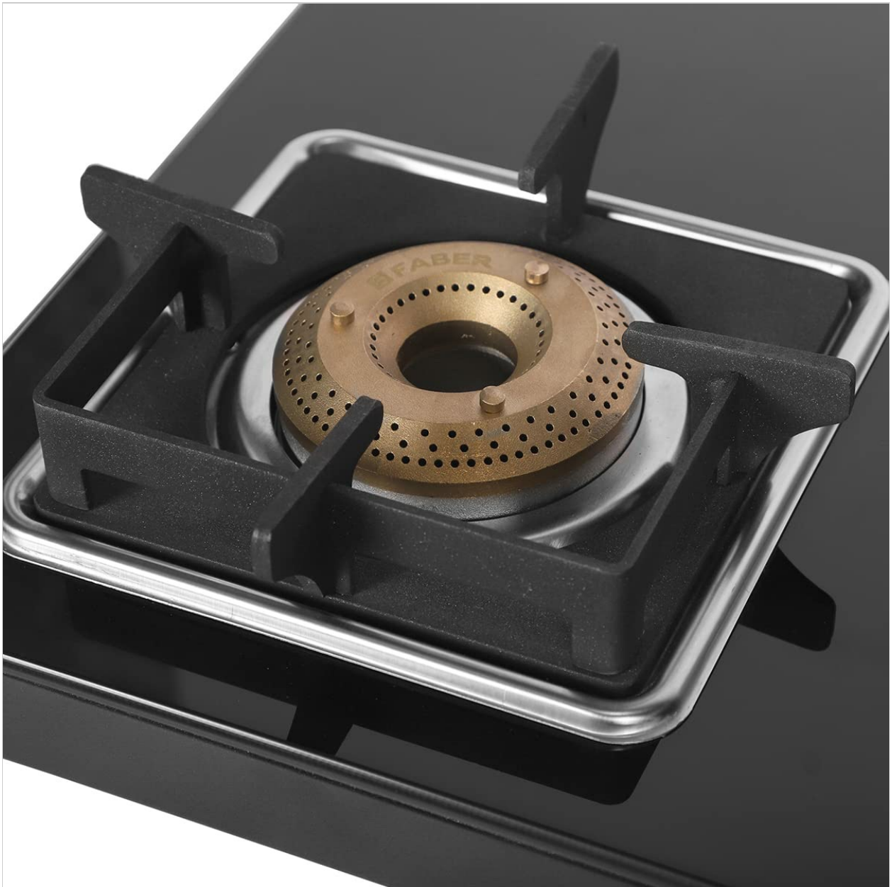
Image 3.2: Close-up view of a burner, showing the brass burner cap and powder-coated pan support.

2. Position the pan supports securely over each burner.