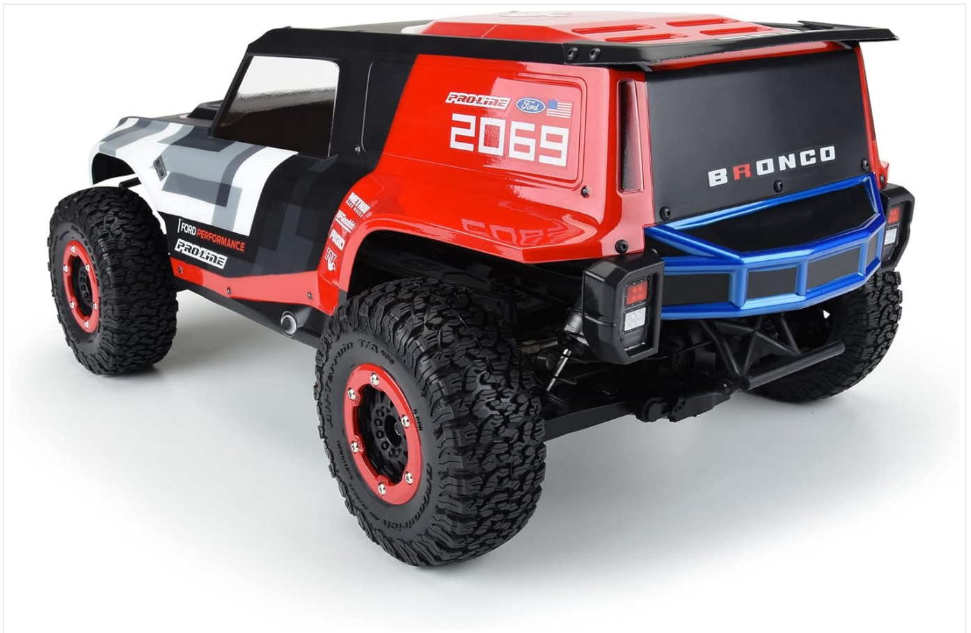
Image: The rear view of the painted Pro-Line Ford Bronco R body, showing the integrated spoiler and taillight details.