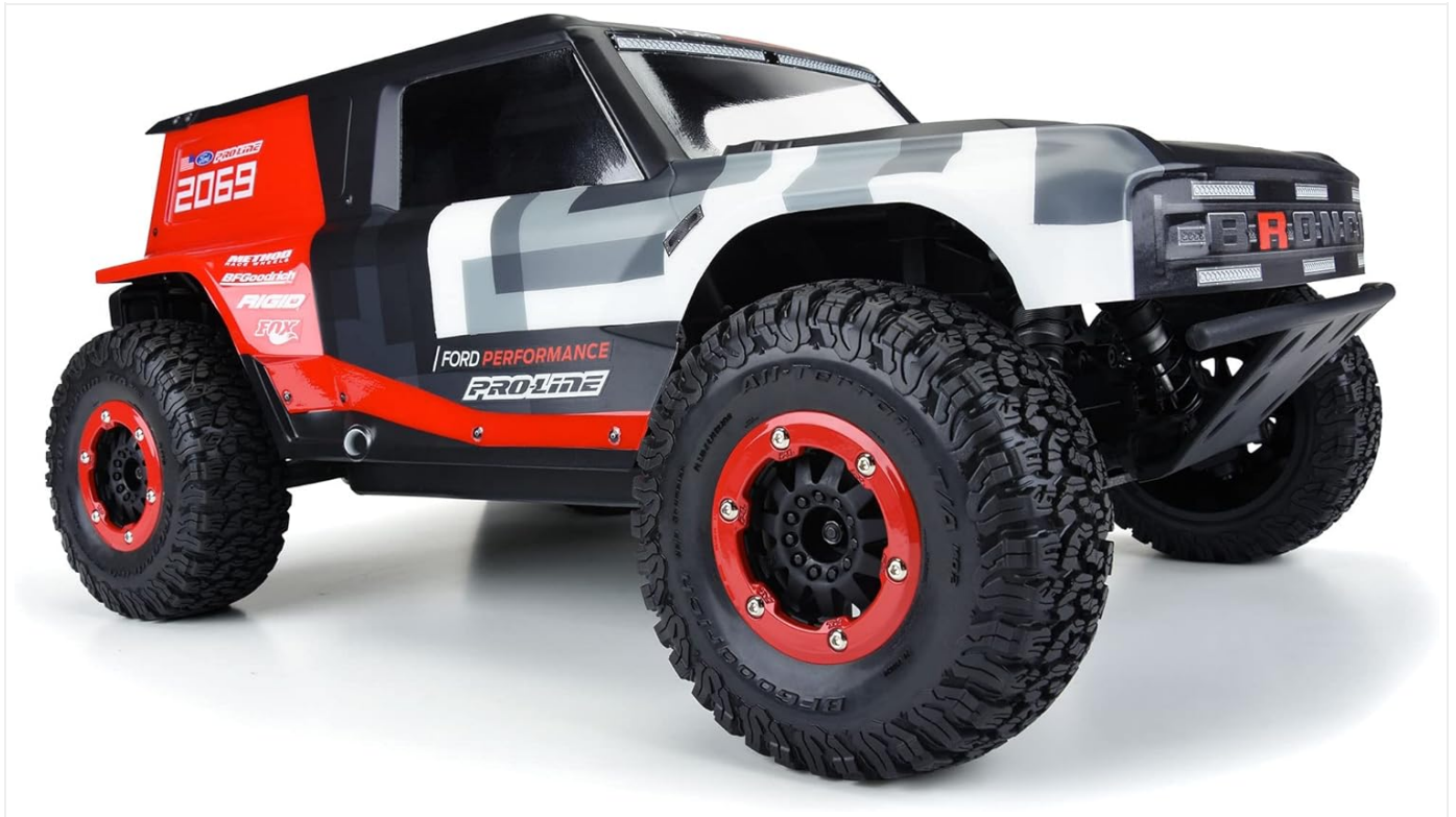
Image: The Pro-Line Ford Bronco R body mounted on a remote control short course truck, viewed from a front angle.

Align the body with your short course truck's body posts. Mark and drill holes for the body posts. It is recommended to use extended body mounts for optimal fitment, especially with larger tires. Secure the body using body clips.