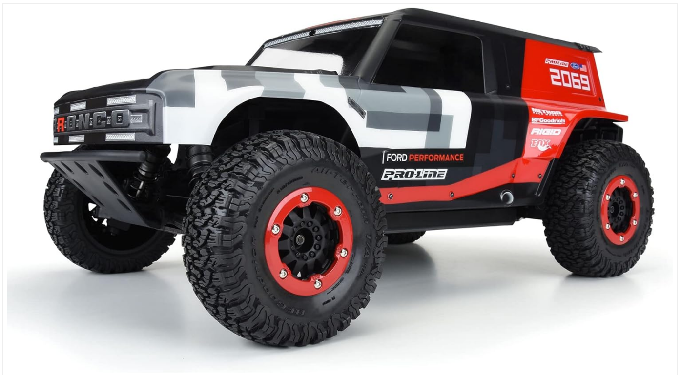
Image: The Pro-Line Ford Bronco R body mounted on a remote control short course truck, viewed from a side angle.