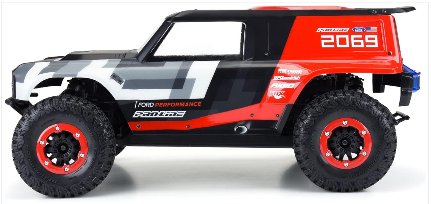
Image: A side view of the painted Pro-Line Ford Bronco R body, highlighting the profile and wheel arches.