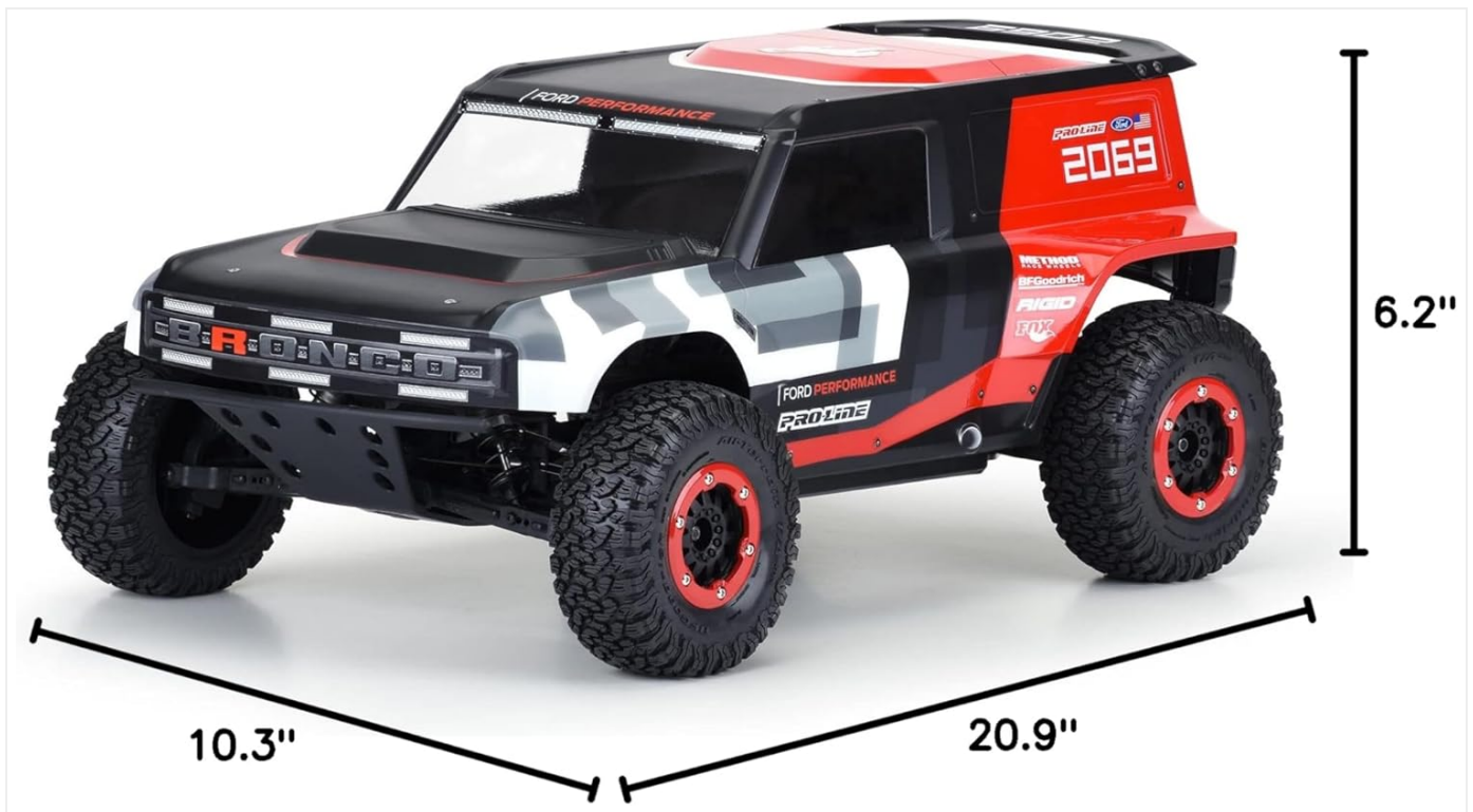
Image: Diagram illustrating the dimensions (length, width, height) of the Pro-Line Ford Bronco R body.