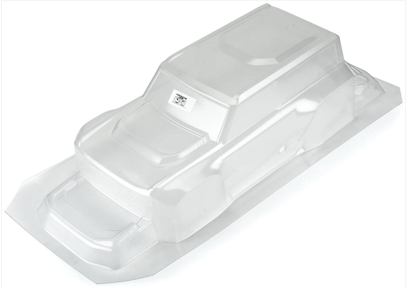
Image: The clear, unpainted Pro-Line Racing 1/10 Ford Bronco R body as it appears out of the packaging.

Upon receiving your Pro-Line Ford Bronco R clear body, carefully inspect it for any manufacturing defects or shipping damage.