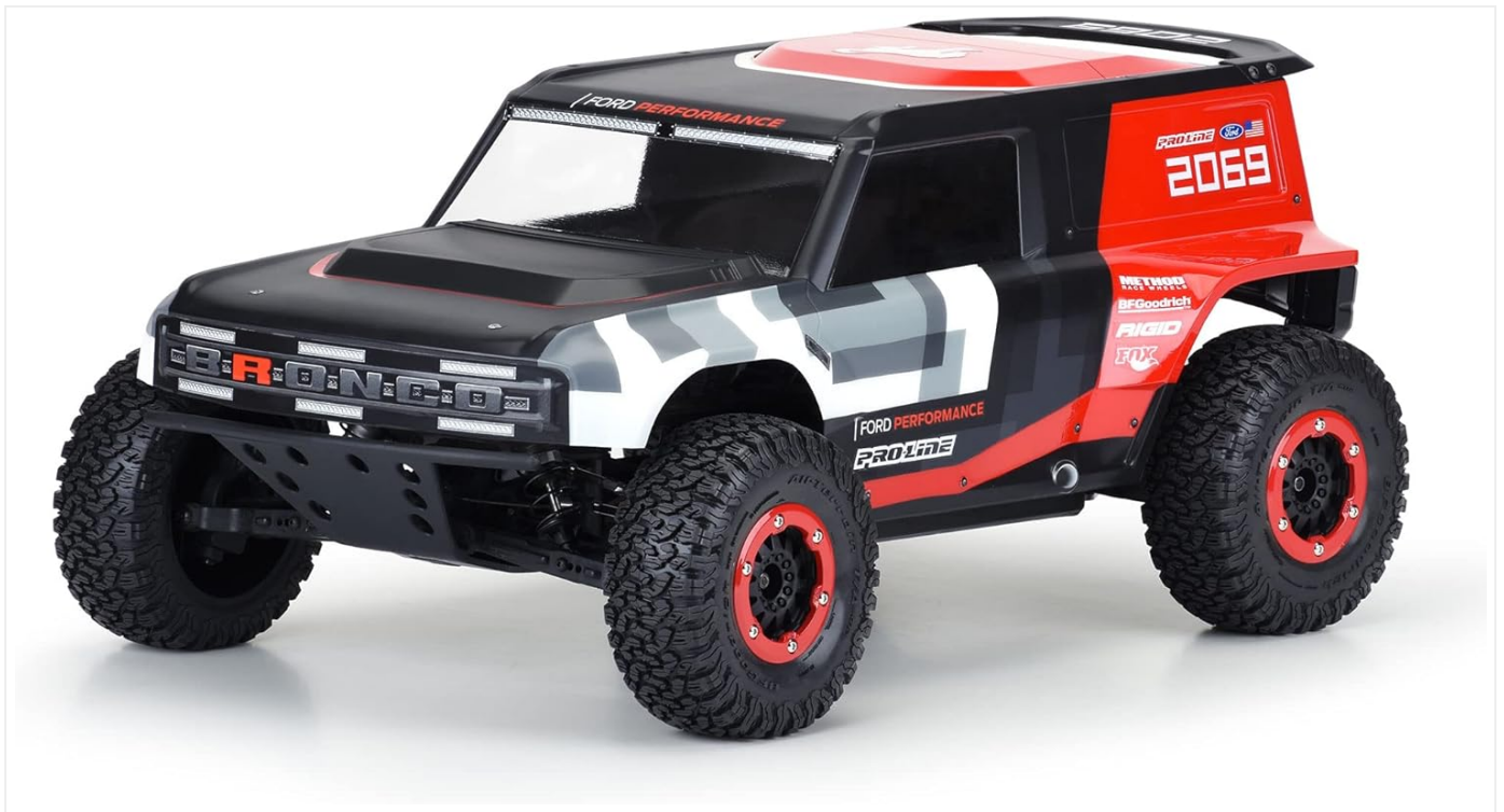
Image: A fully painted Pro-Line Ford Bronco R body, showcasing the front design and details.