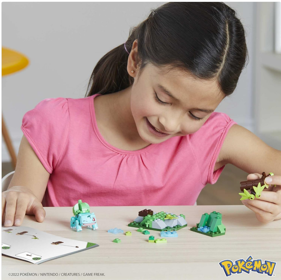
Image: A child engaged in assembling the building set, with various pieces laid out on a table and the instruction manual visible.