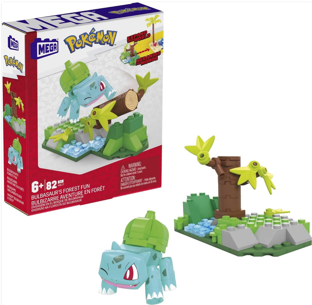
Image: The product box and the fully assembled Bulbasaur's Forest Fun set, showcasing the Bulbasaur figure and the forest environment.