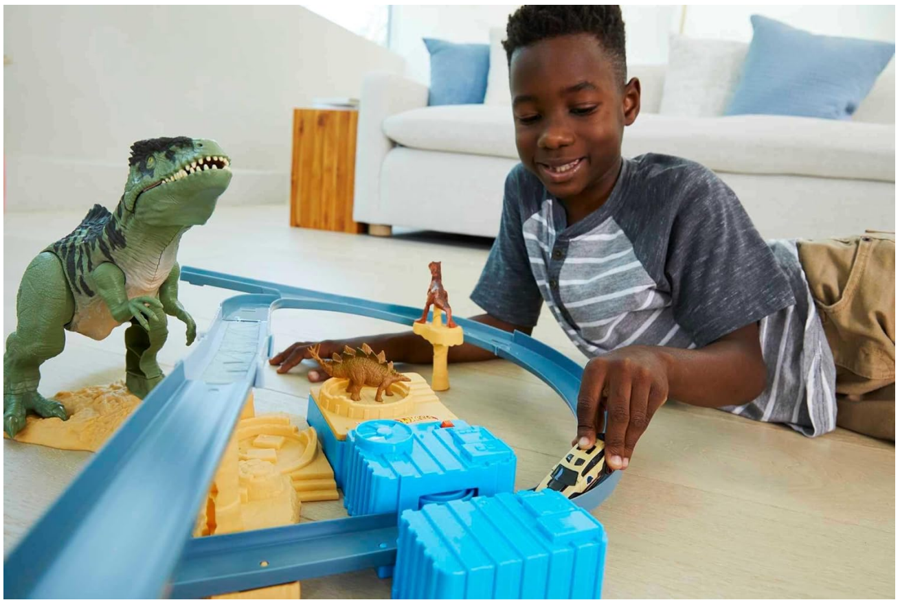
Image 3.1: A child engaging with the playset, demonstrating the launch of a Hot Wheels car onto the track.