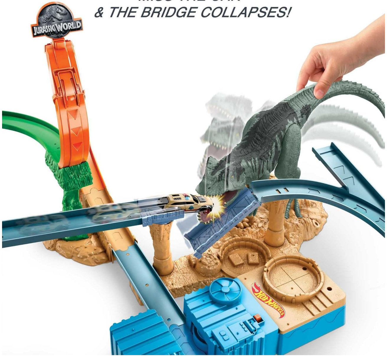
Image 3.3: Shows the consequence of missing the car, with the track bridge collapsing, adding an element of challenge to the game.