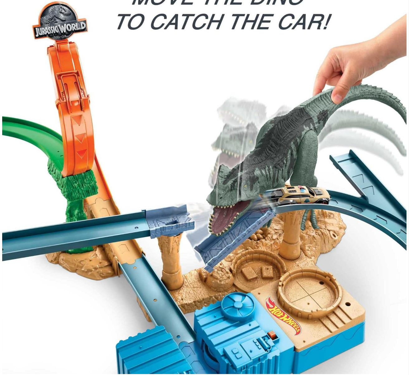
Image 3.2: Illustrates the interactive feature where a hand maneuvers the Giganotosaurus to catch a car as it passes on the track.