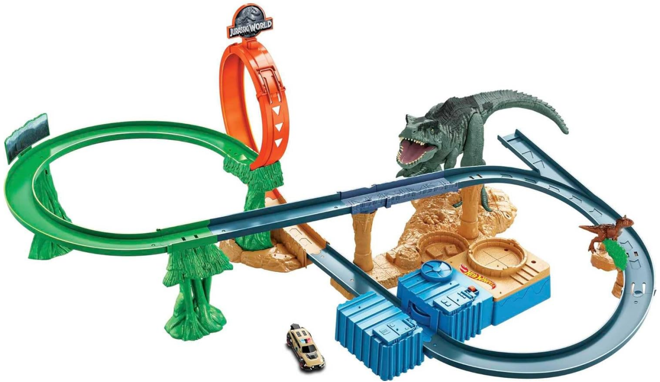
Image 1.1: The Hot Wheels Jurassic World Dominion Clash 'n Crash Playset, showing both the product packaging and the fully assembled track with a car and dinosaur figures.