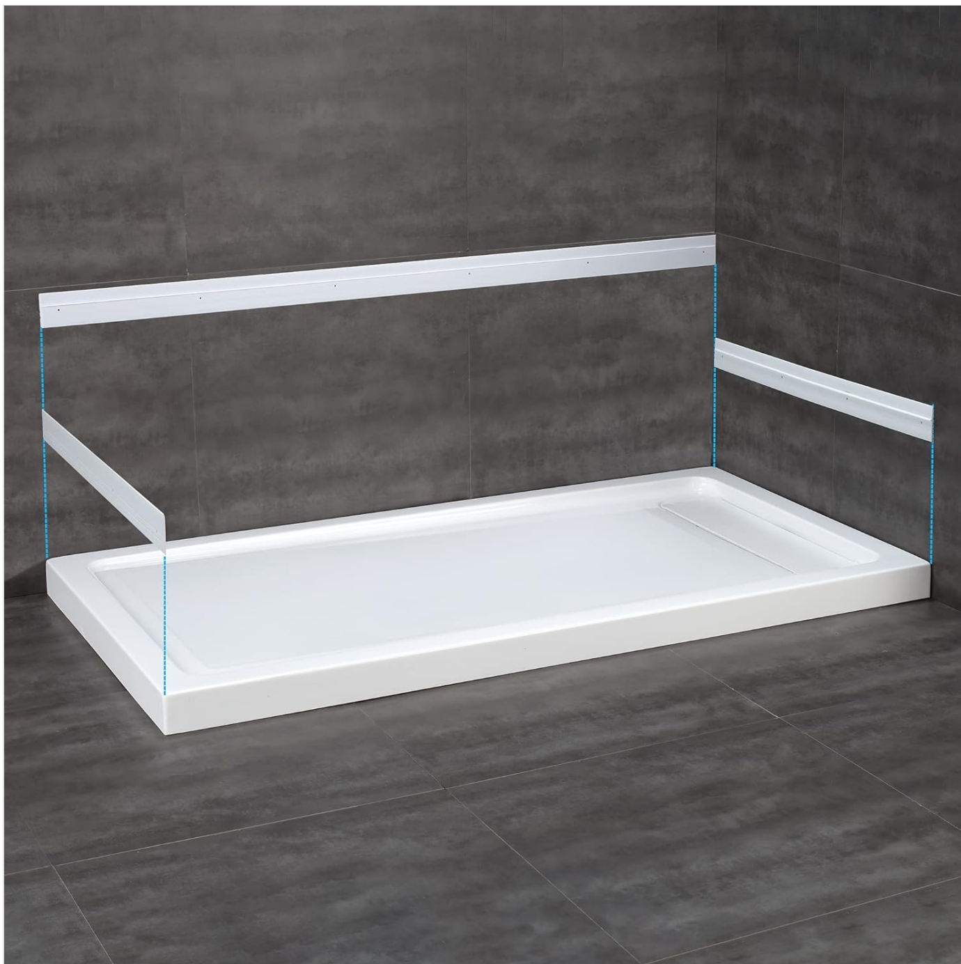
Image: Shower base positioned within a framed shower enclosure, illustrating the side flanges ready for attachment to wall studs.