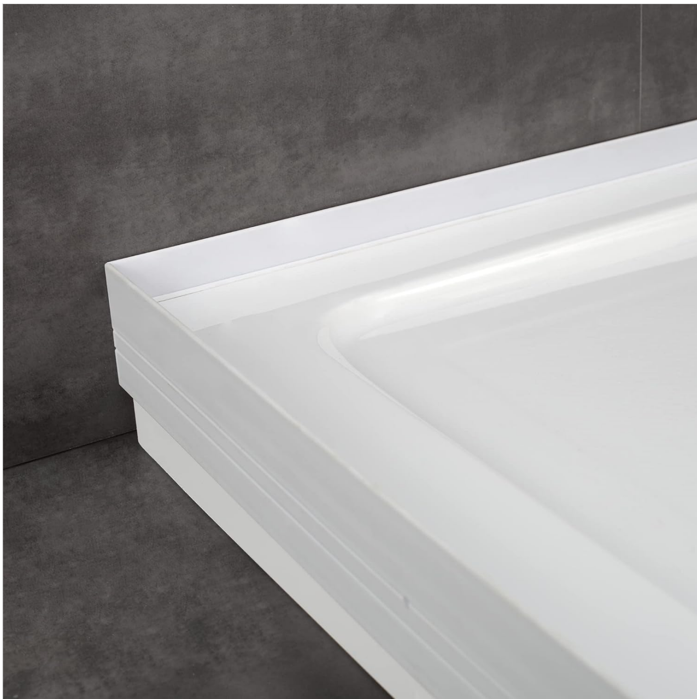
Image: Detailed view of the shower base's perimeter, showing the integrated side flange designed for sealing and securing to the shower walls.