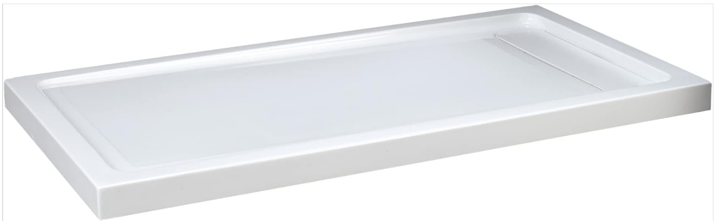
Image: Top-down view of the OVE Decors 60x32 inch white acrylic shower base pan, showcasing its rectangular shape and low profile.