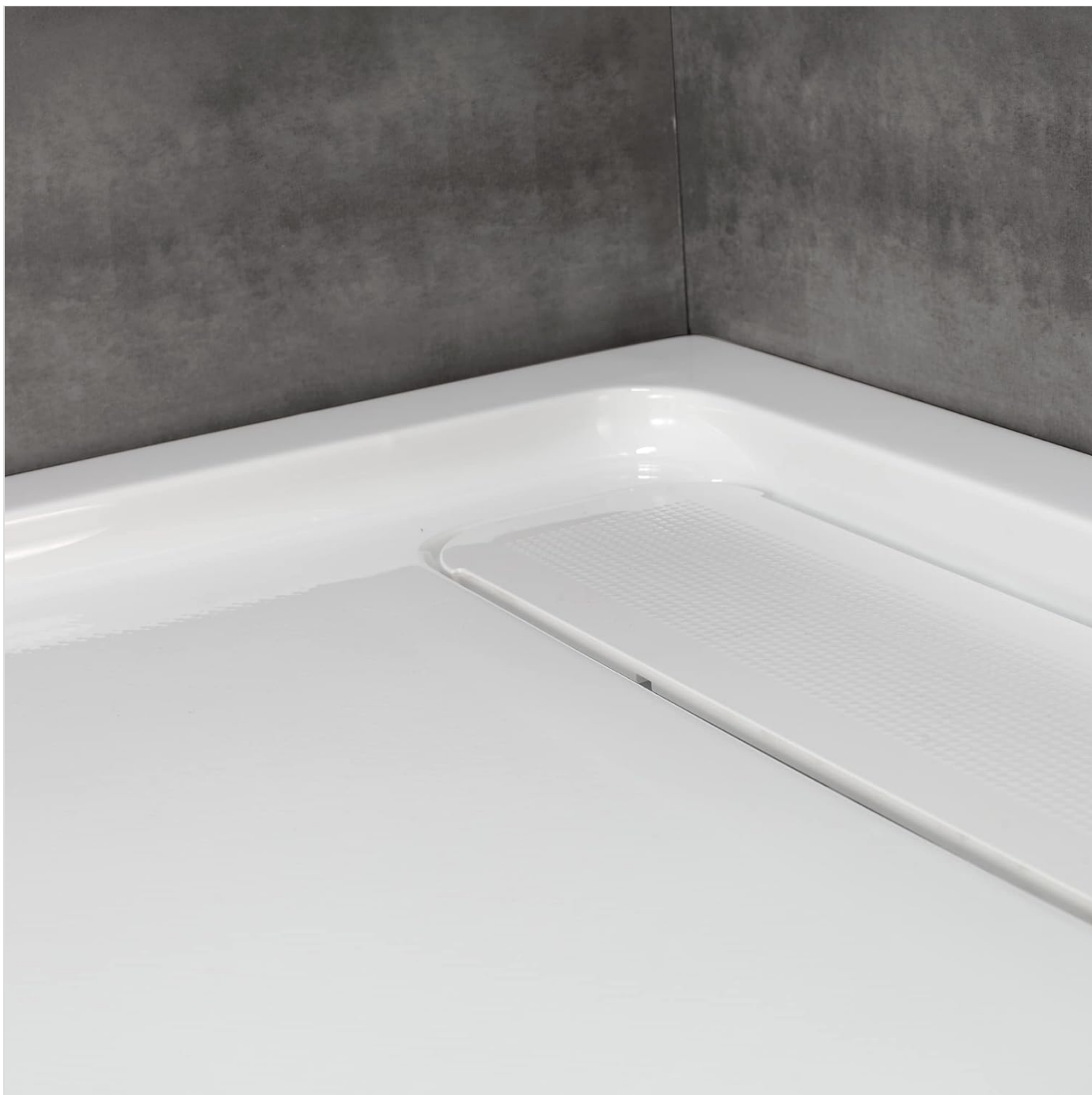
Image: A close-up view of the shower base's hidden side drain, showing the removable cover that conceals the drain opening.