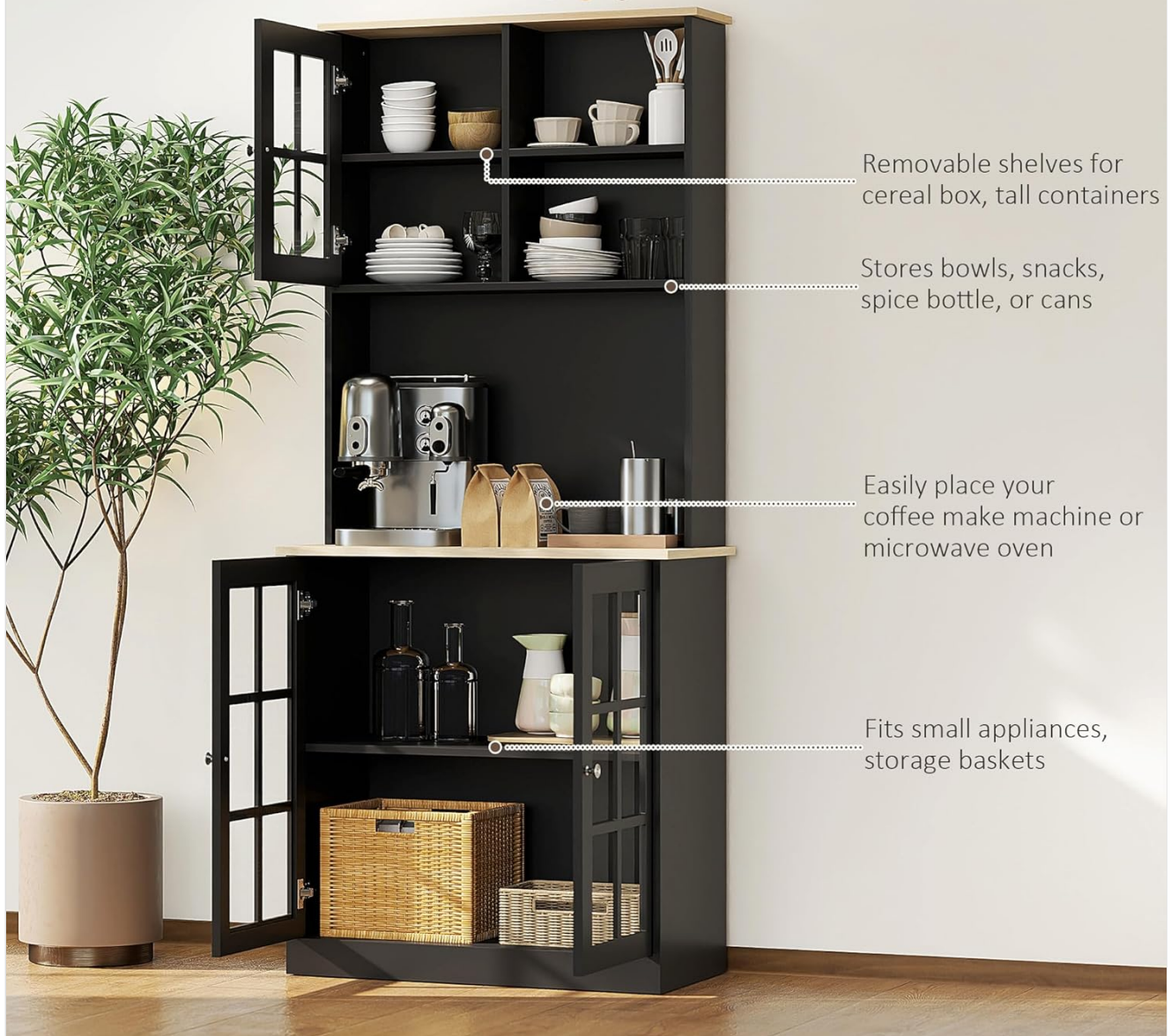
Figure 4: Overview of the large storage capacity. This image highlights the various compartments, including the upper and lower cabinets with glass doors, open shelves, and the central countertop, demonstrating how different items can be stored.