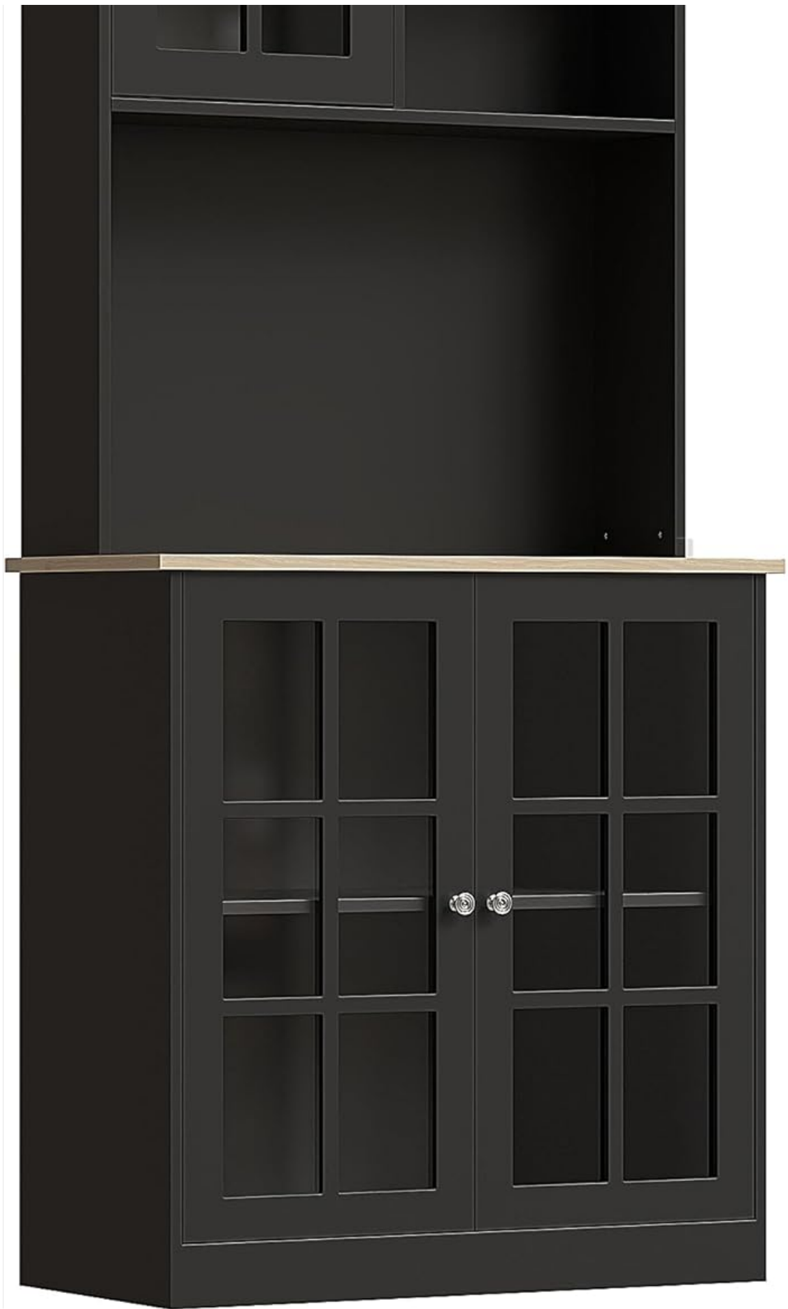
Figure 1: Front view of the HOMCOM 72-inch Kitchen Pantry with Microwave Stand. This image displays the overall structure of the black cabinet with its upper and lower sections, glass-paneled doors, and open shelving.