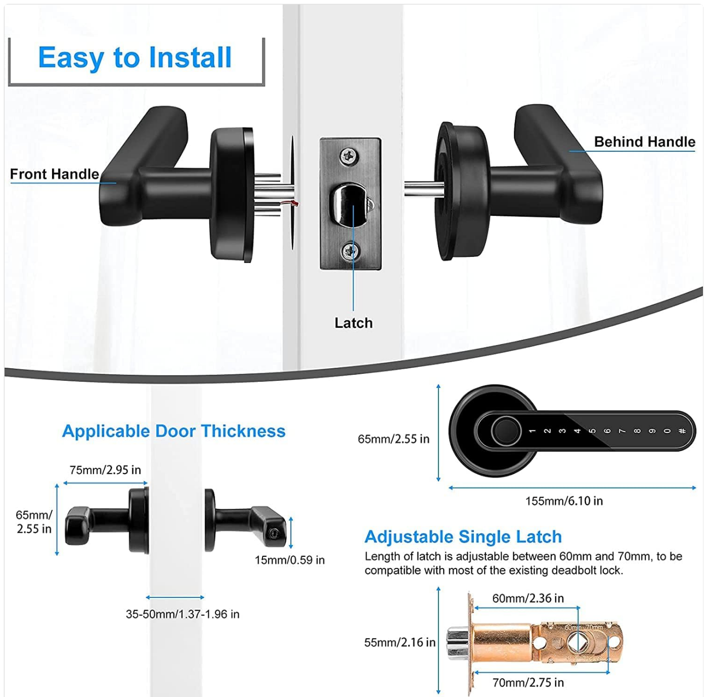
Image: A visual guide illustrating the components and simple installation process of the MILLIONHOME Smart Door Lock.