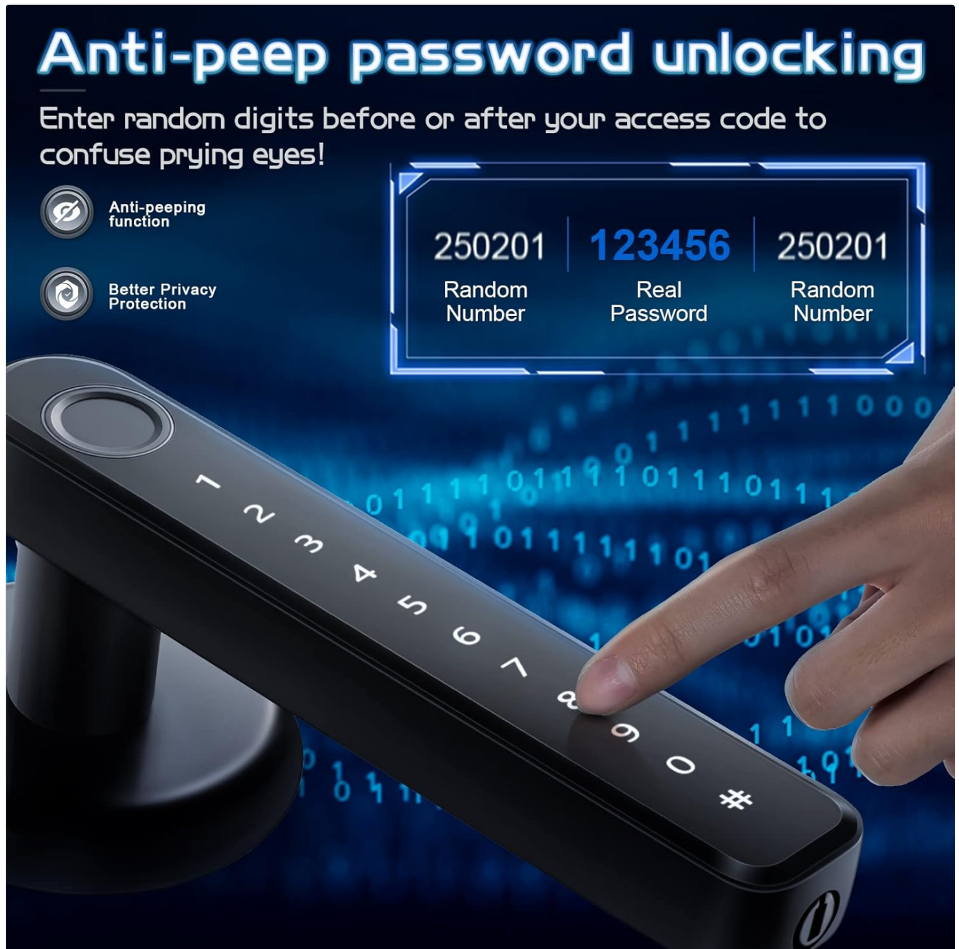
Image: The anti-peep password feature allows users to enter random digits before or after their actual code for enhanced privacy.