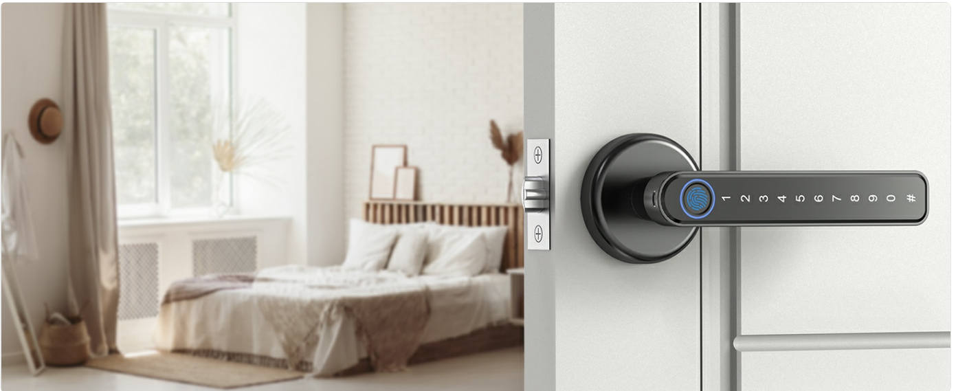
Image: The lock automatically adjusts for left or right-handed door configurations, simplifying installation.