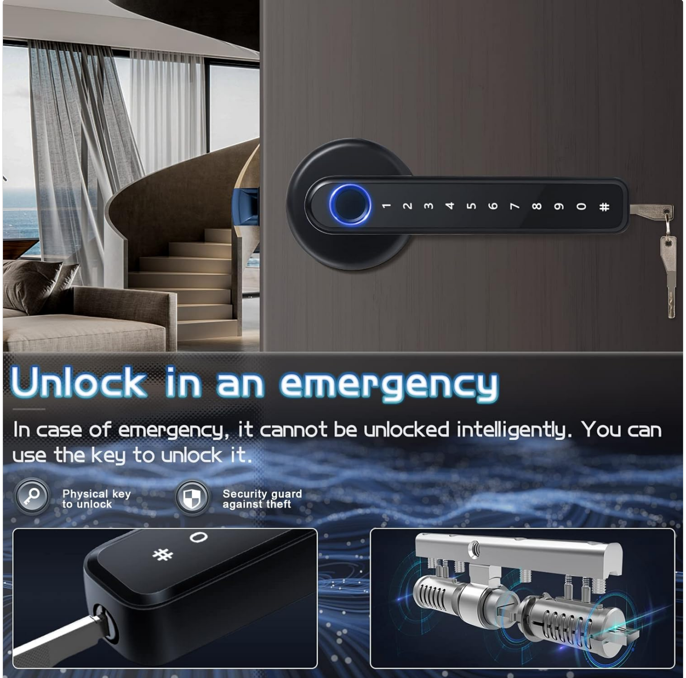
Image: A physical key being inserted into the emergency keyhole to unlock the smart door lock.