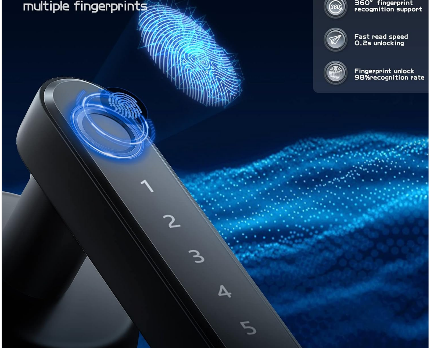
Image: A close-up view of the fingerprint sensor, highlighting its quick and accurate recognition capabilities.