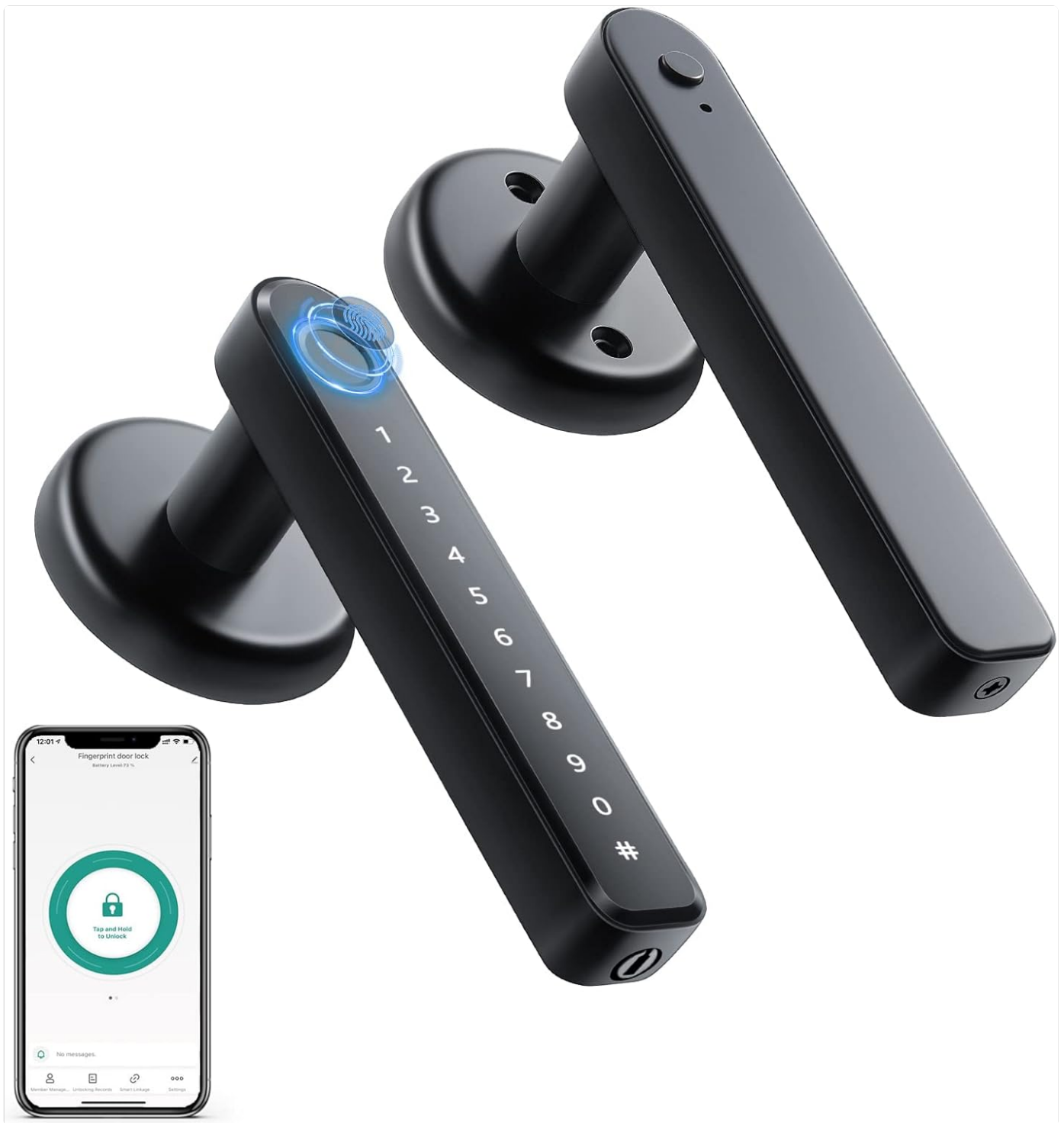
Image: The MILLIONHOME Fingerprint Smart Door Lock, showcasing its sleek design and the accompanying mobile application interface.