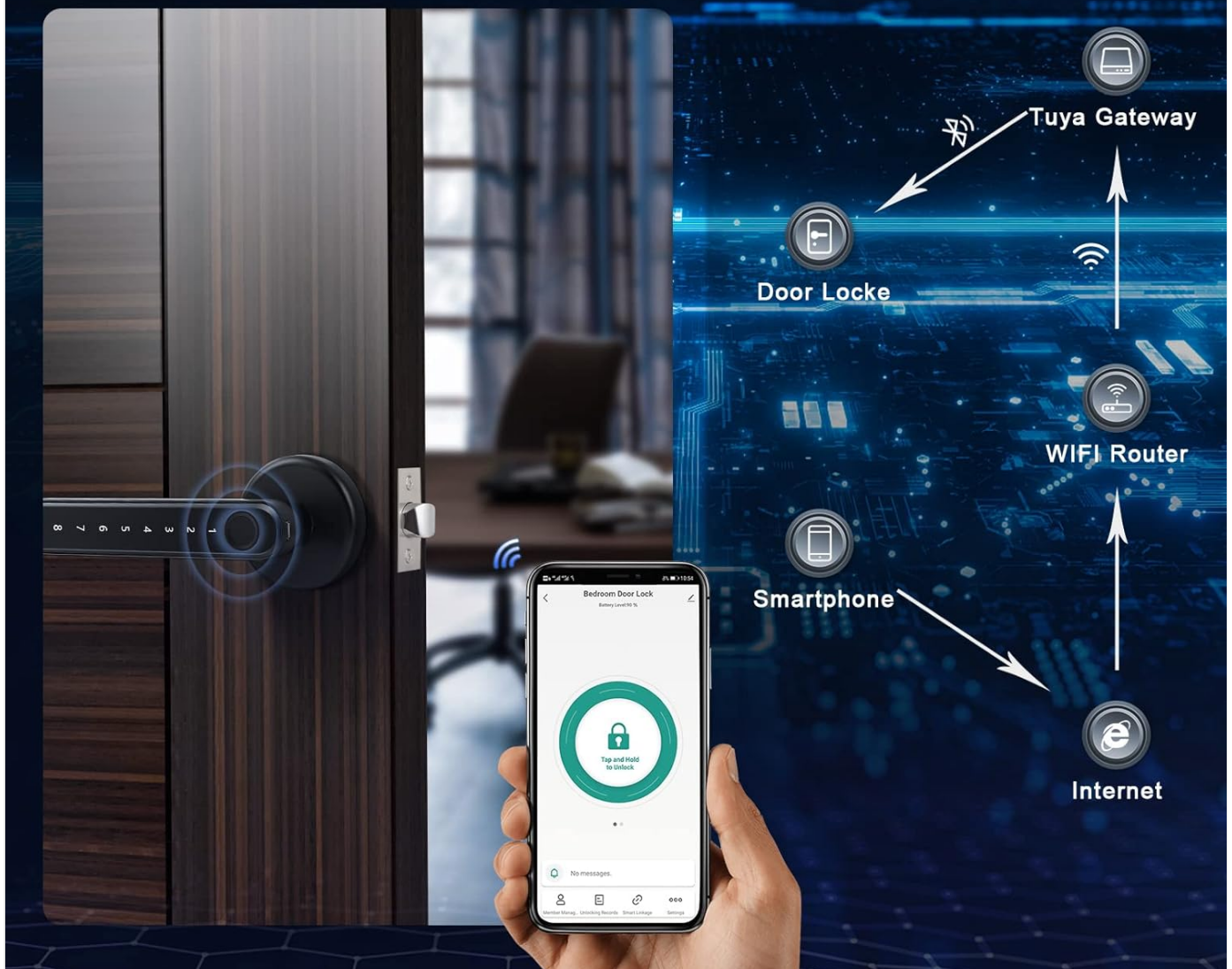
Image: The mobile application interface demonstrating how to unlock the smart door lock using a smartphone.

With MILLIONHOME Tuya Bluetooth gateway, you can control the door lock via the Internet.