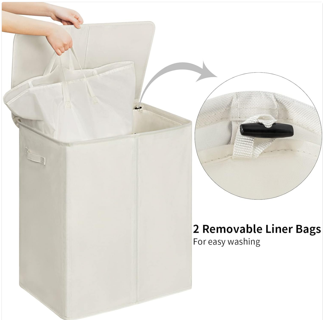
Figure 4: Demonstrates the ease of removing a liner bag from the hamper for transport.

Your browser does not support the video tag.