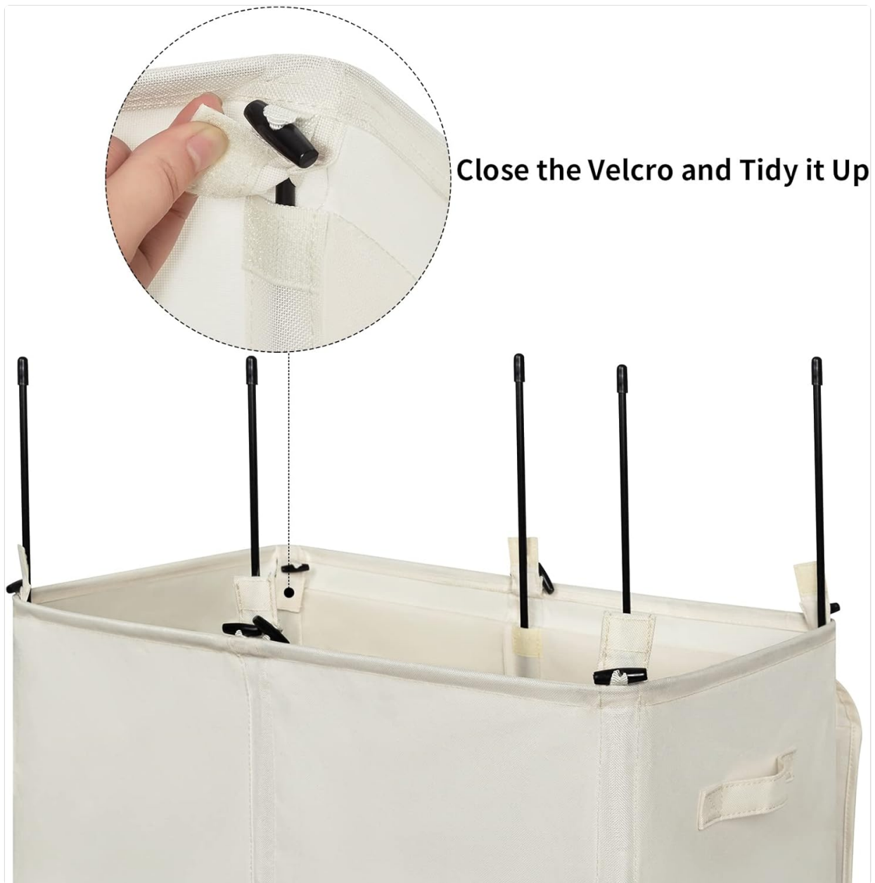
Figure 3: Detail of the toggles and Velcro used to secure the removable liner bags within the hamper.