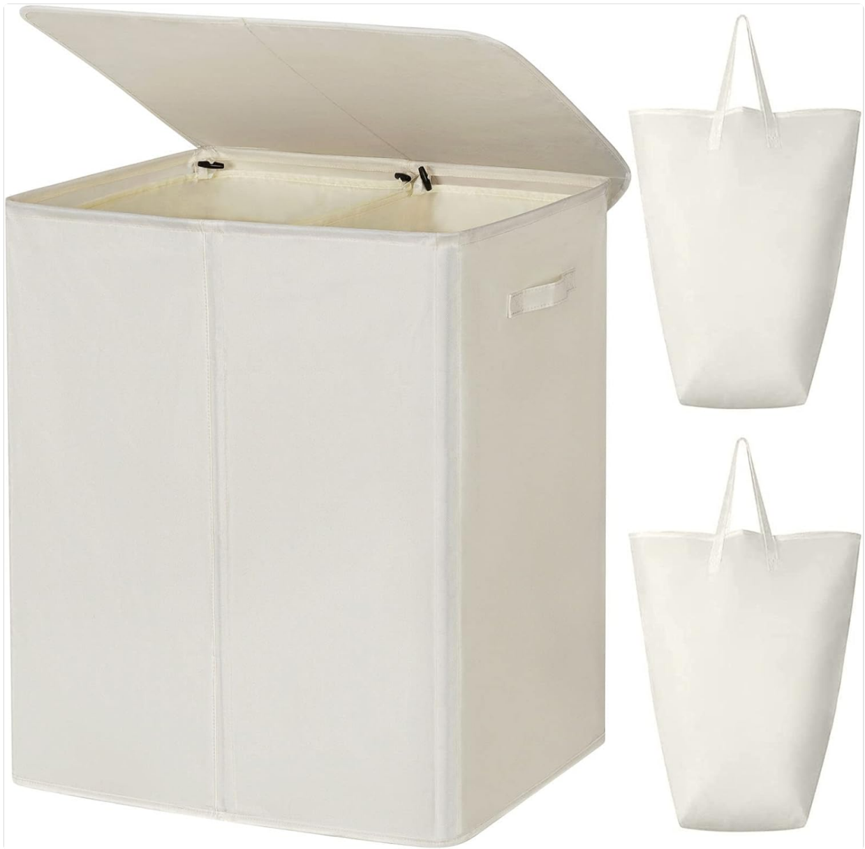
Figure 1: The WOWLIVE 154L Double Laundry Hamper in Beige, shown with two removable liner bags.