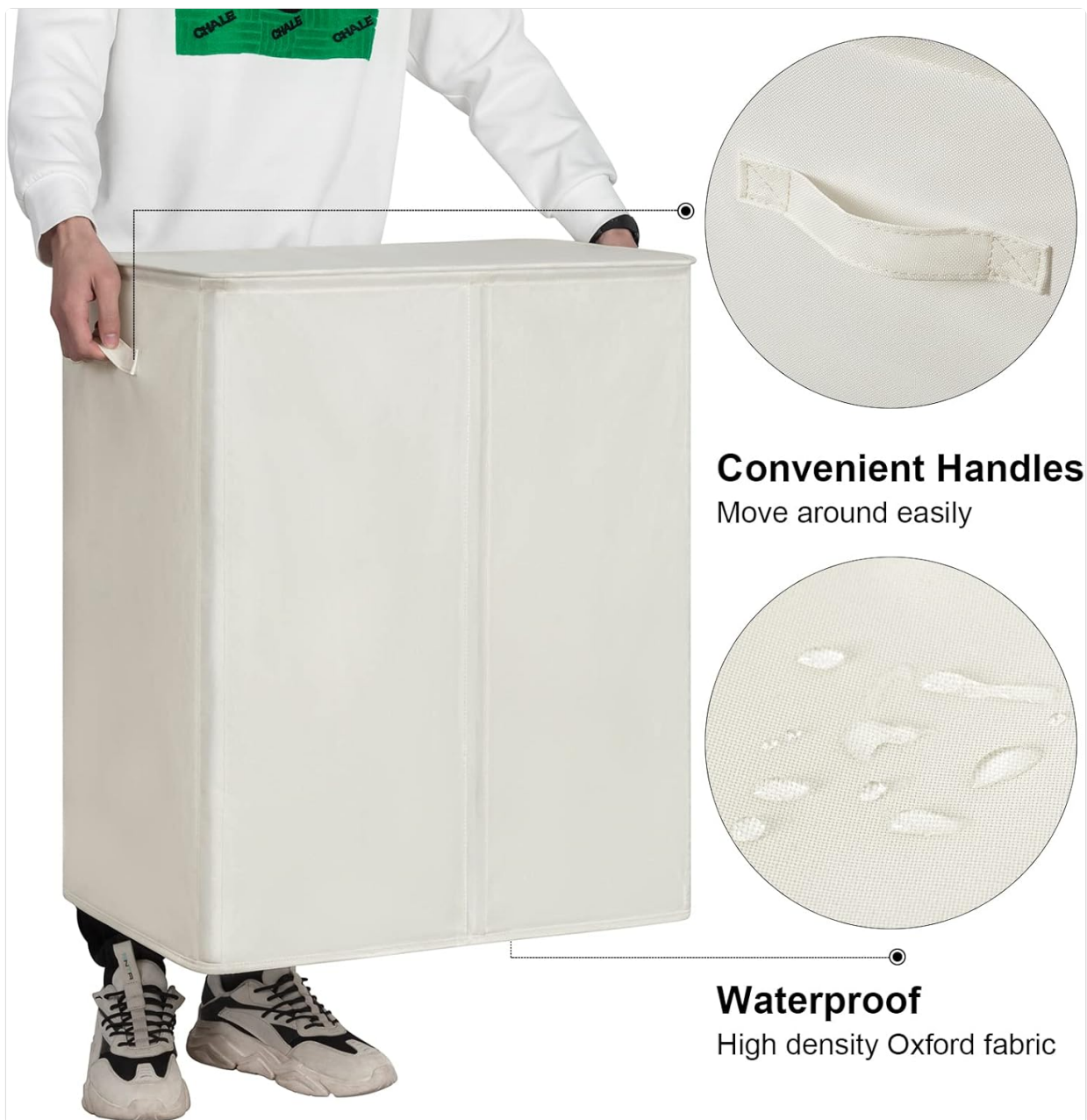
Figure 5: Illustrates the waterproof nature of the Oxford fabric, making cleaning easier.