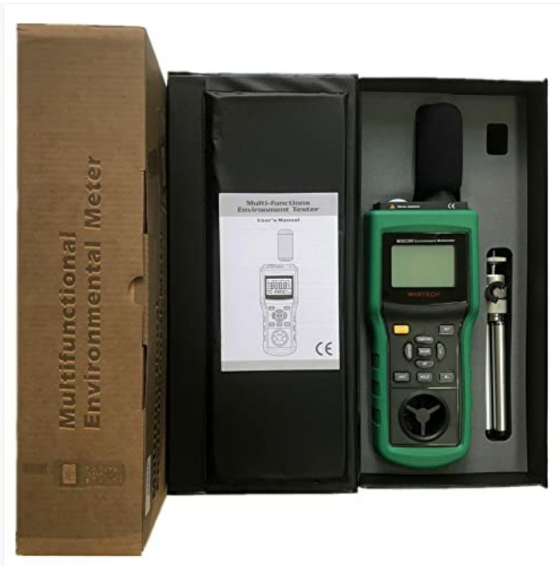
Figure 3.1: Contents of the MS6300 package, showing the main unit, tripod, and user manual within the product box.