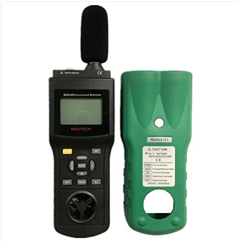
Figure 4.1: Back view of the MS6300 meter with the protective casing removed, illustrating the battery compartment and product label.