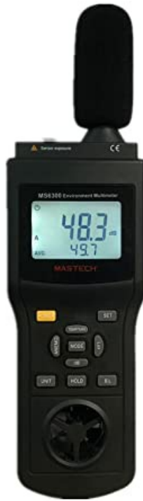
Figure 5.1: The MS6300 display showing temperature readings and an average value, demonstrating the dual display capability.