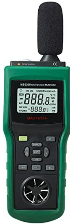
Figure 2.1: Front view of the MS6300 Multifunction Environment Meter, showing the LCD display, control buttons, sound level microphone, and anemometer fan.