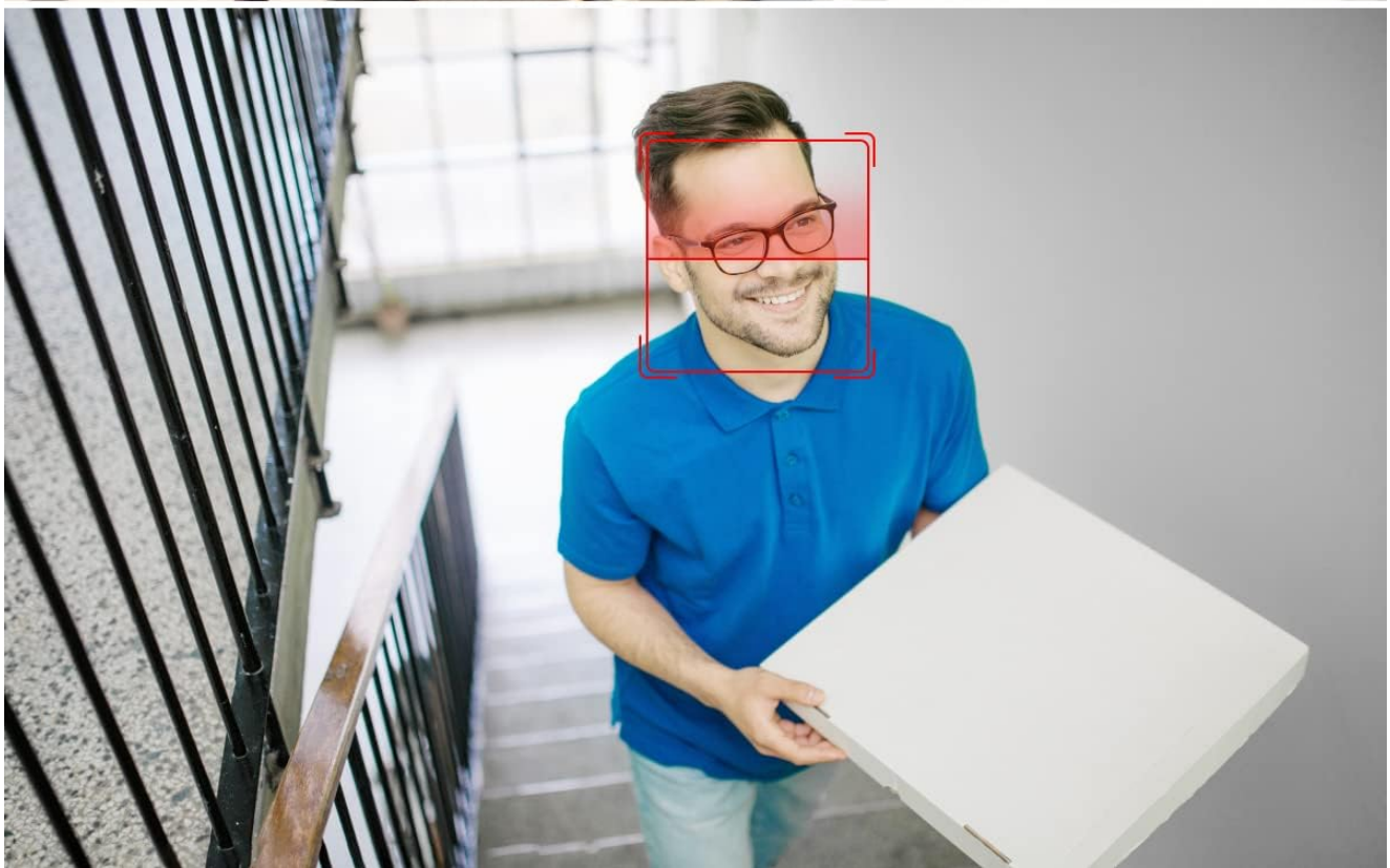
Image: Motion and face detection in action, triggering alerts on a mobile device.