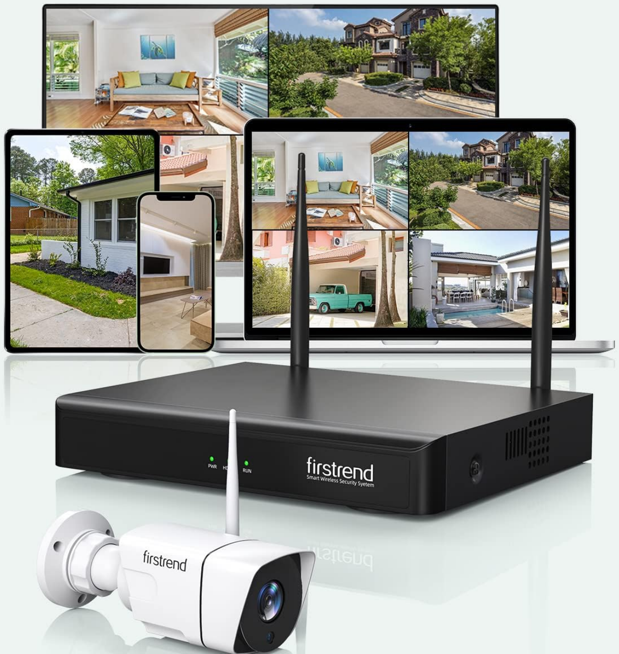
Image: Remote monitoring and playback across various devices, including mobile phones, tablets, and computers.