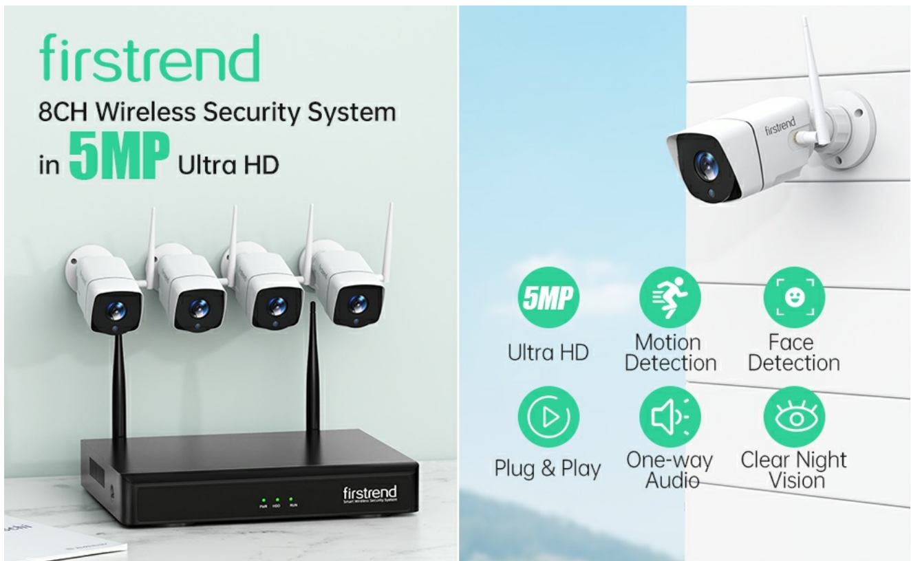
Image: The Firstrend 5MP Wireless Security Camera System, featuring the NVR unit and four wireless cameras.

This manual provides detailed instructions for the installation, operation, and maintenance of your Firstrend 5MP Wireless Security Camera System. This system includes an 8-channel Network Video Recorder (NVR) with a 2TB hard drive and four 5MP wireless CCTV cameras, designed for both indoor and outdoor surveillance. Please read this manual thoroughly before using the product to ensure proper setup and functionality.