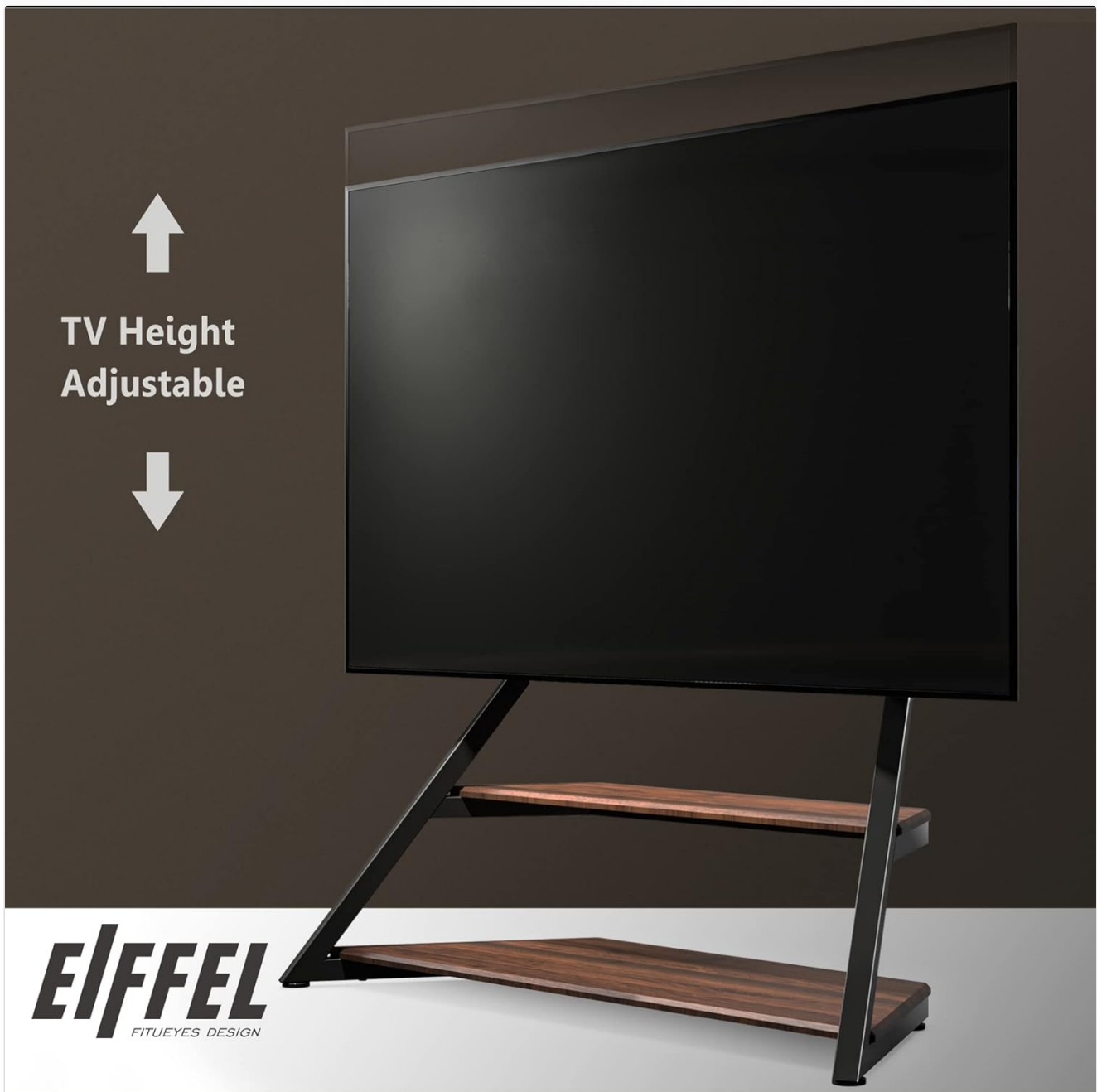
Figure 3.1: Overview of TV stand components, highlighting the sturdy metal frame and wooden shelves.