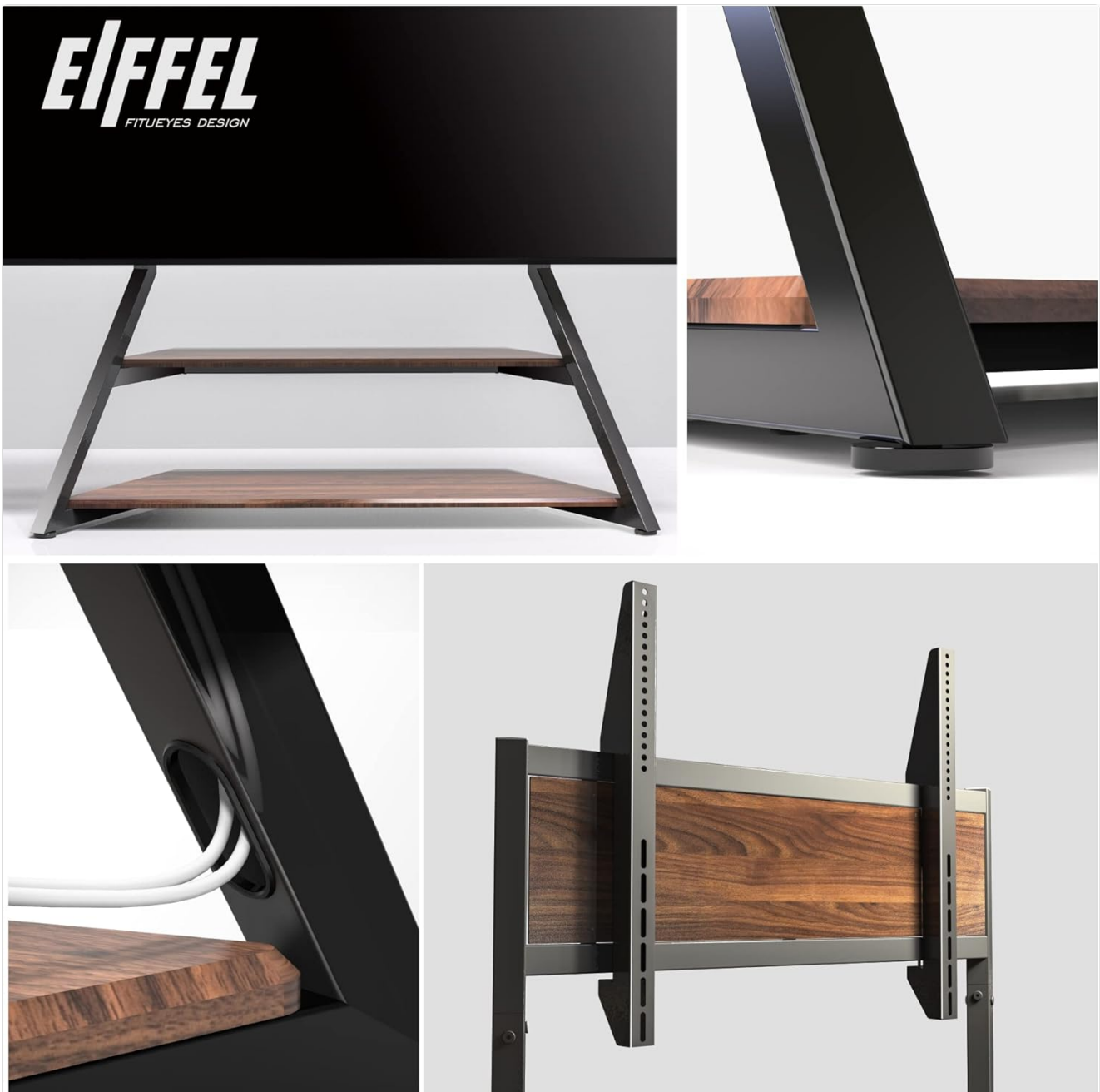
Figure 4.2: Technical specifications and VESA compatibility for TV mounting.