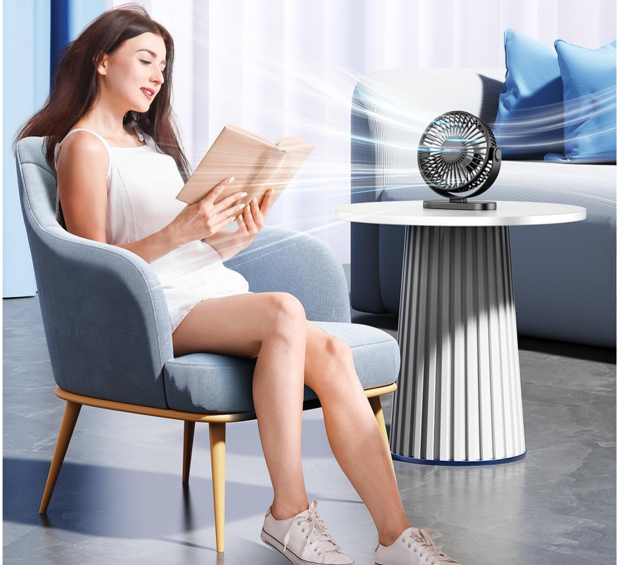
Figure 5: Three-level speed settings for customized airflow.