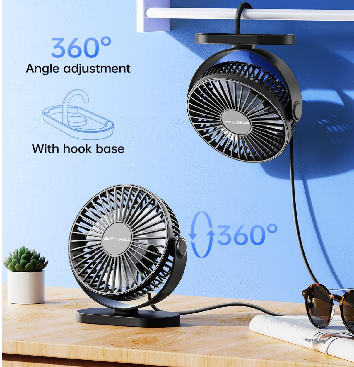
Figure 3: Fan with 360-degree angle adjustment and hook base.