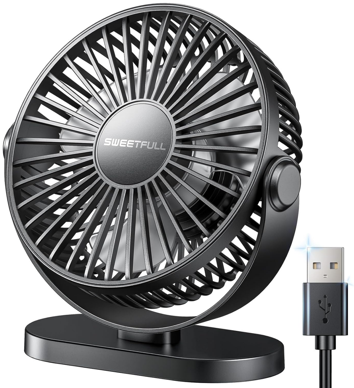
Figure 1: SWEETFULL USB Desk Fan (Black)