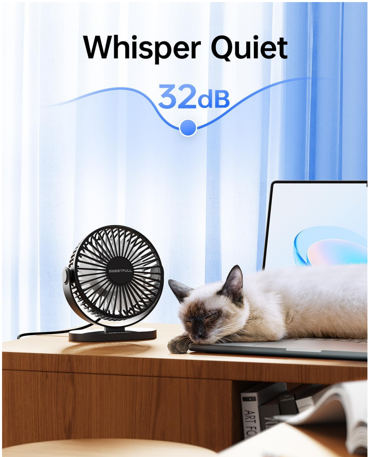
Figure 6: The fan's quiet operation, suitable for undisturbed environments.