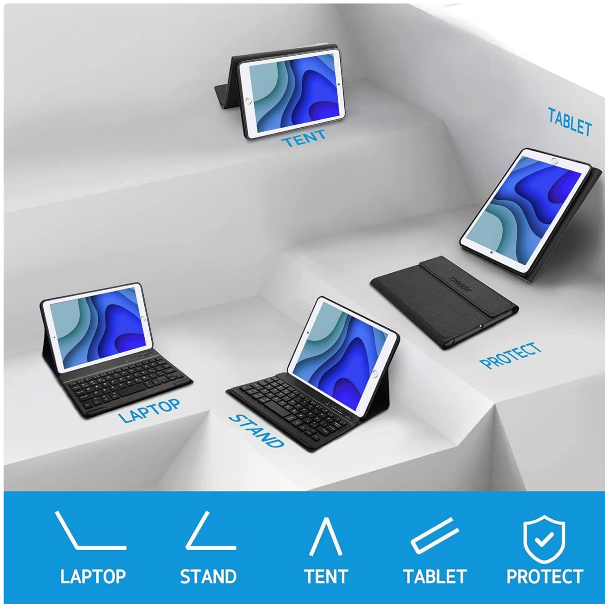
Image: The keyboard case configured in 'Laptop', 'Stand', and 'Tent' modes, showcasing different viewing angles for the iPad Mini.