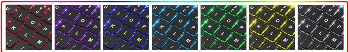
Image: A close-up of the keyboard highlighting the 'Fn' key and the 'Light Bulb' key for backlight control, showing various backlight colors.