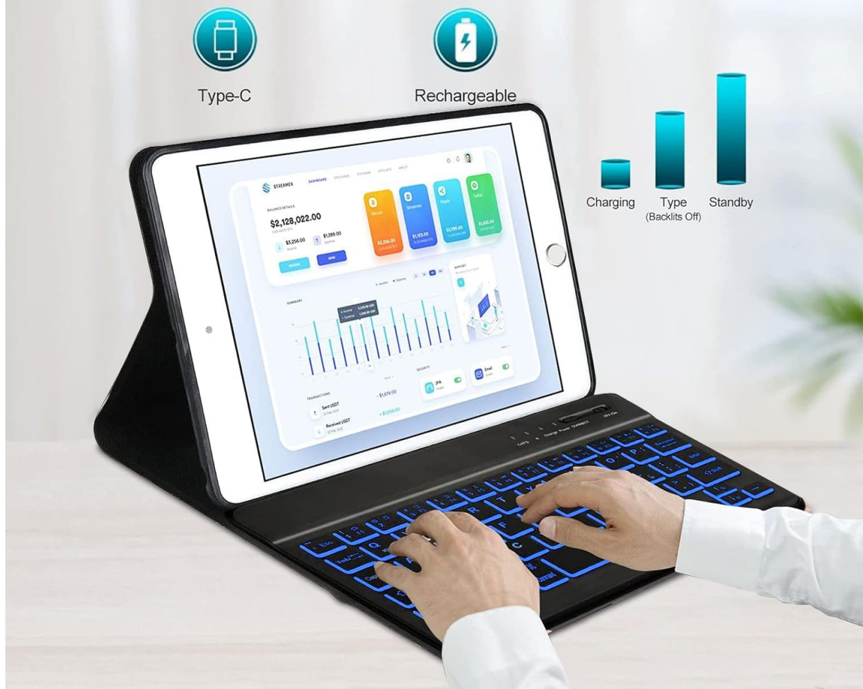
Image: An illustration demonstrating the keyboard charging process via a Type-C USB cable and indicating battery life for charging, typing, and standby modes.