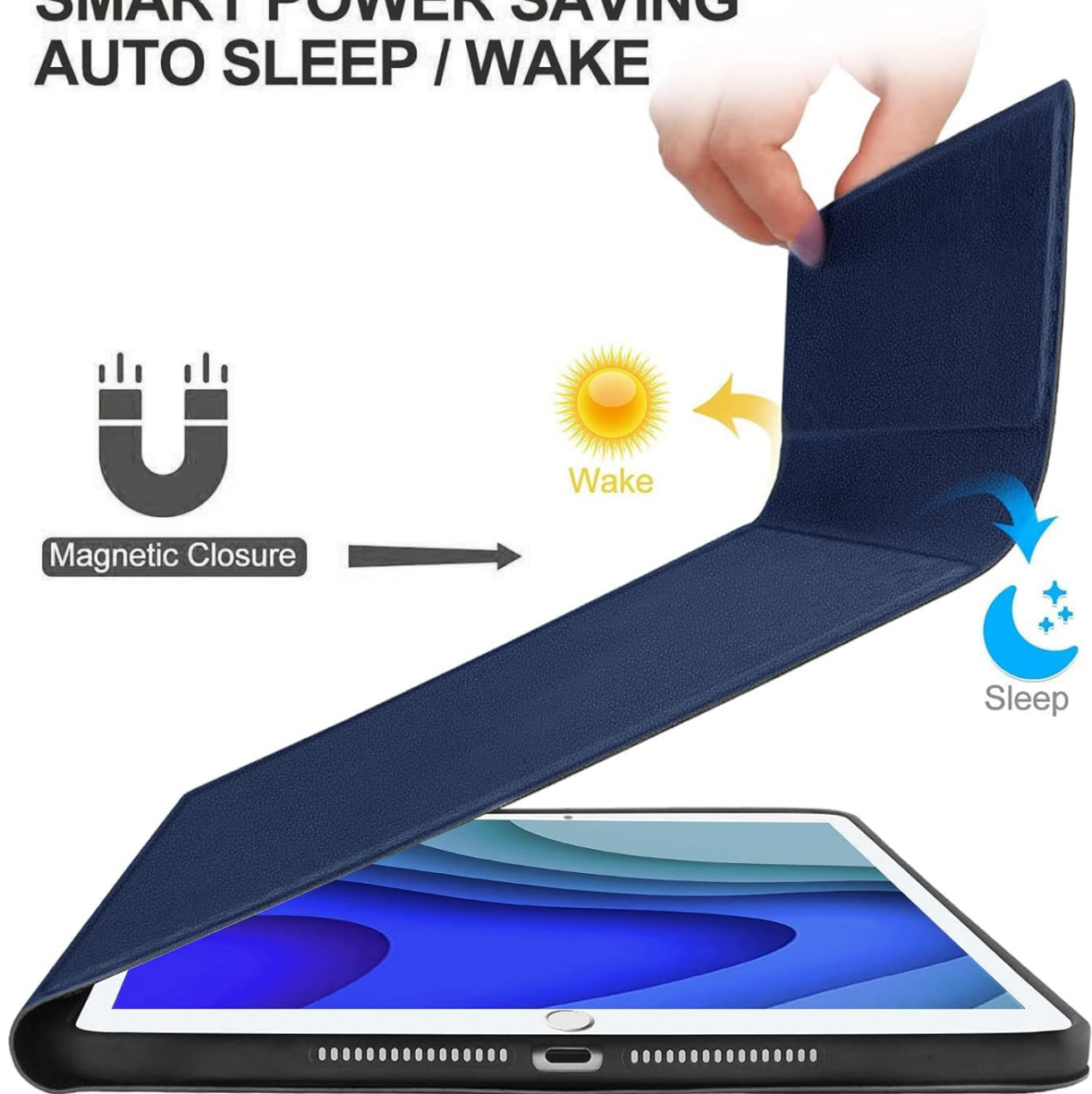
Image: A hand opening the keyboard case, with arrows indicating the 'Wake' function, and the case closing, indicating the 'Sleep' function.