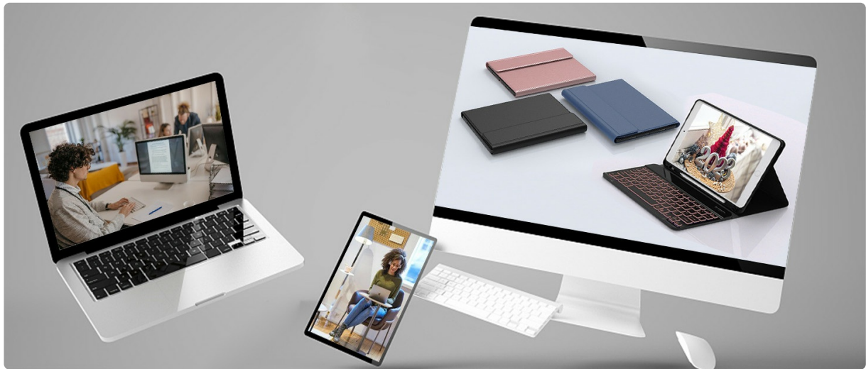
Image: The JADEMALL Keyboard Case shown with an iPad Mini, illustrating its use as a laptop-style setup, a stand, a tent mode, and as a protective tablet cover.

The JADEMALL Keyboard Case provides a protective cover and a detachable wireless Bluetooth keyboard for your iPad Mini. It enhances productivity and offers multiple viewing angles for various tasks.