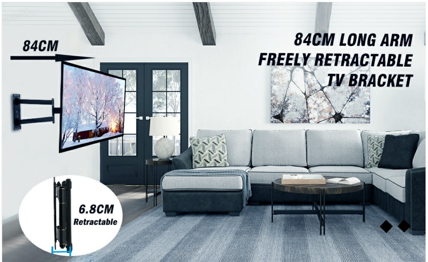
Image: Illustrates the mount's extension capability up to 840mm (33 inches) and retraction to 68mm (2.68 inches), along with its tilt range of +5 to -10 degrees.

Image: Demonstrates the adjustable features of the mount, including 180-degree swivel, +5/-10 degree tilt, and +/-3 degree post-installation level adjustment for optimal viewing comfort.