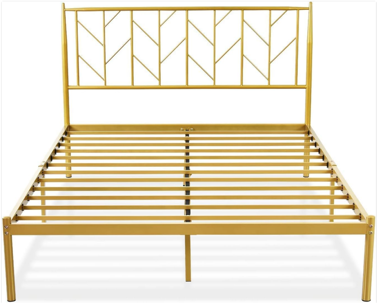
Image: Detail illustrating the non-slip rail design that secures the mattress.