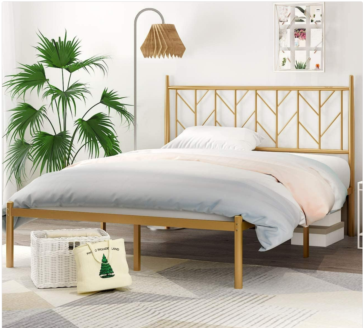
Image: Fully assembled SHA CERLIN Queen Metal Bed Frame.

Once all components are in place, go back and securely tighten all bolts and screws using the provided Allen wrench. Ensure the frame is stable and level.