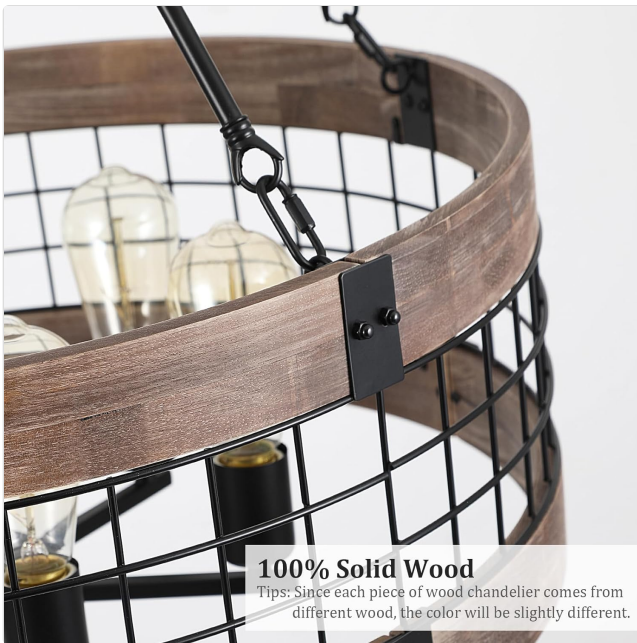
Close-up of the LamQee farmhouse chandelier showing the solid wood frame, black metal grid, and bulb sockets.