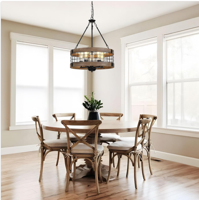
LamQee farmhouse chandelier installed in a dining room with a round table and cross-back chairs, highlighting its rustic charm.