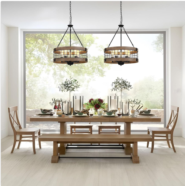
Two LamQee farmhouse chandeliers hanging above a long dining table, showcasing their suitability for larger spaces.