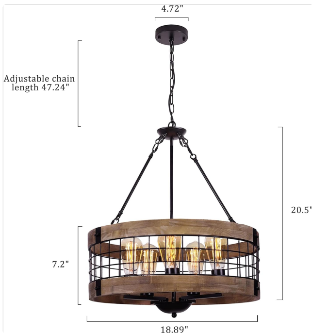
Dimensional drawing of the LamQee 19-inch farmhouse chandelier, showing 18.89 inch diameter, 7.2 inch height, and 47.24 inch adjustable chain length.