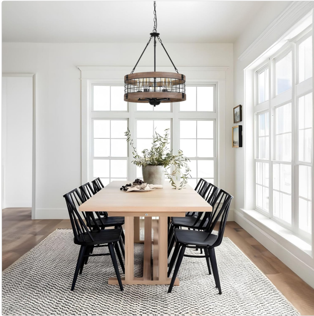
LamQee farmhouse chandelier installed in a dining room with a long wooden table and black chairs.

View the LamQee 19-inch 5-light farmhouse chandelier in various settings and see its features up close.