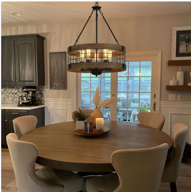
LamQee farmhouse chandelier installed in a dining room with a round wooden table and upholstered chairs.