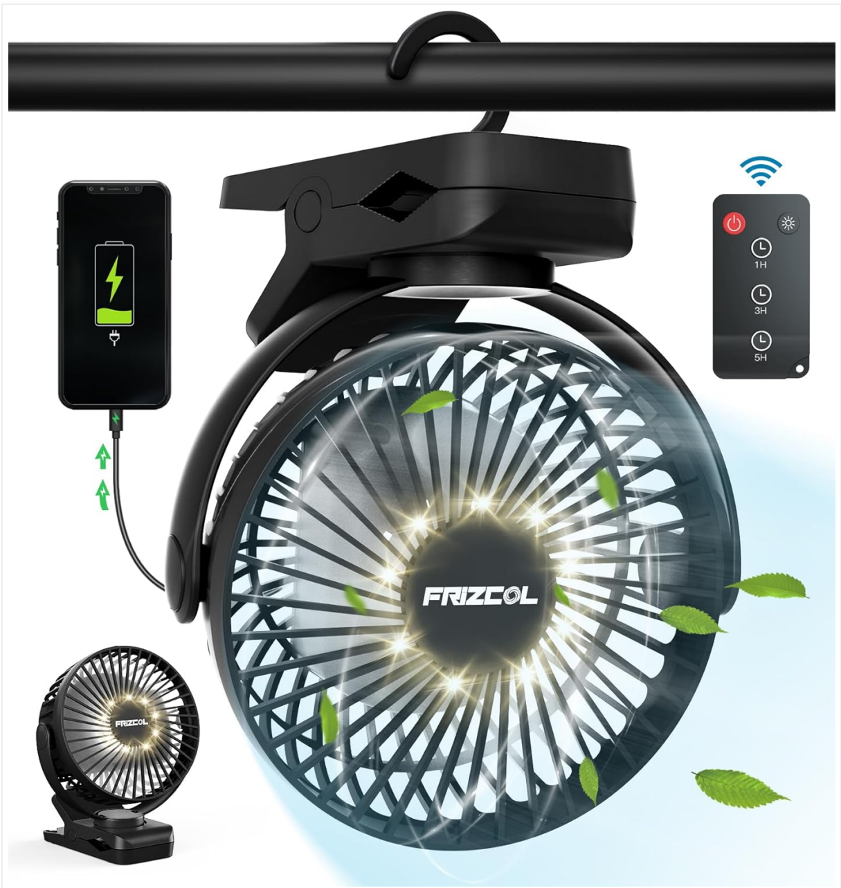
Figure 2.1: FRIZCOL Portable Clip-on Fan with remote control and phone charging capability.