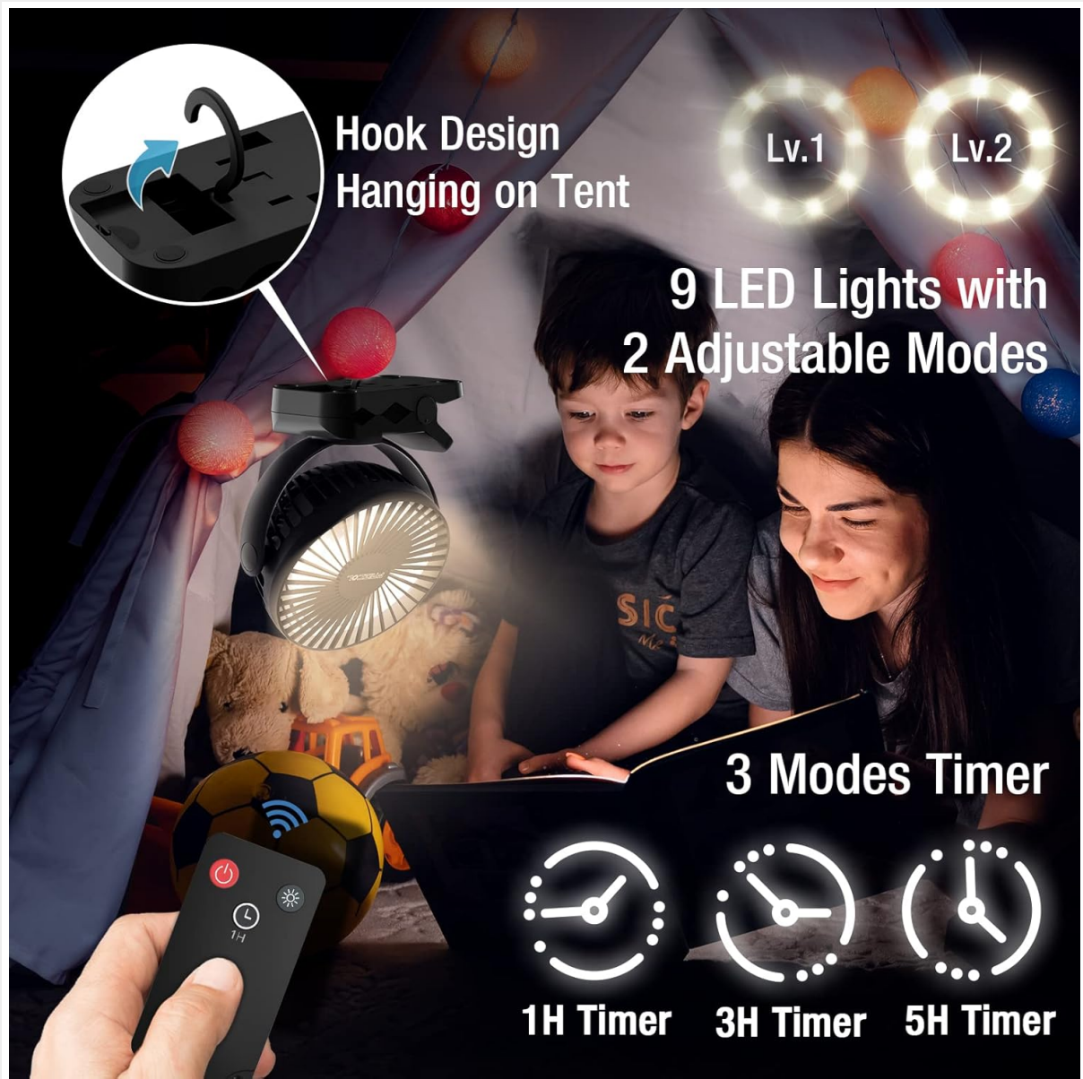
Figure 4.2: Fan hanging in a tent, demonstrating the hook design.