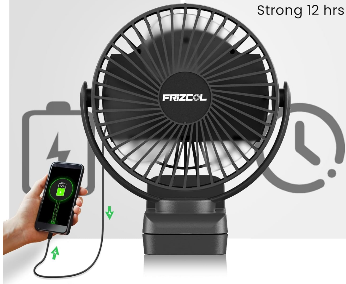
Figure 4.1: Charging the fan and its large battery capacity.

Gentle 65 hrs Nature 42 hrs Strong 12 hrs