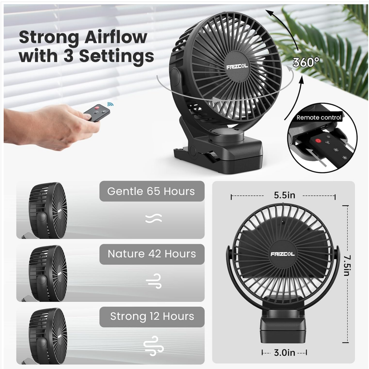
Figure 5.1: Fan speed settings and 360-degree adjustability.