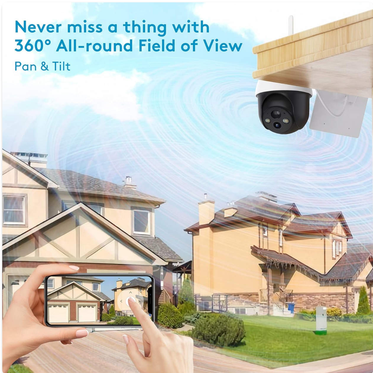
Figure 5.1: The camera offers a 360° all-around field of view with pan and tilt functions.

From the live view screen, use the directional controls to remotely pan (horizontal rotation up to 360°) and tilt (vertical rotation up to 90°) the camera lens to monitor different areas.