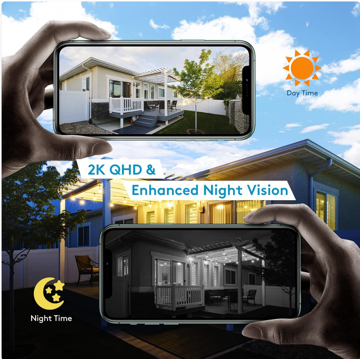
Figure 5.6: 2K HD quality with enhanced night vision capabilities.

The camera features upgraded infrared LEDs for clear night vision up to 66ft. When sufficient ambient light is present, it can provide full-color night vision.