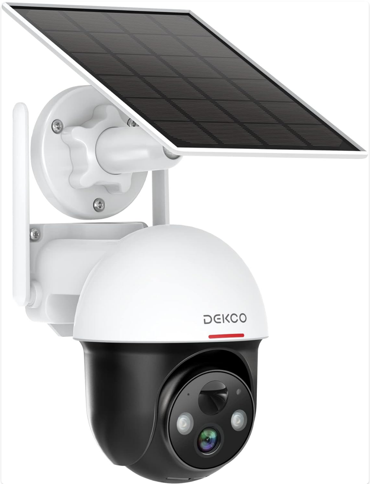
Figure 1.1: DEKCO 2K Solar Security Camera with integrated solar panel.