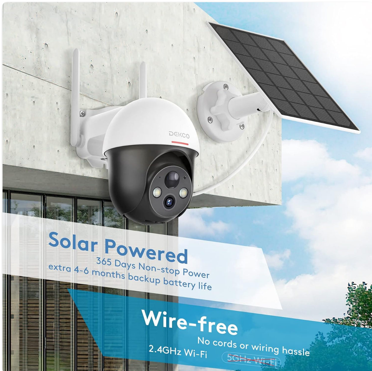
Figure 4.2: The camera is designed for wire-free installation, powered by its solar panel.