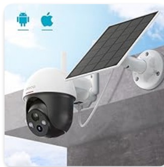
Figure 4.1: The CloudEdge app is compatible with both Android and iOS devices.