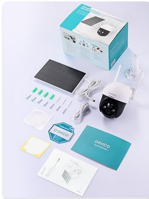
Figure 2.1: Included items in the product package.