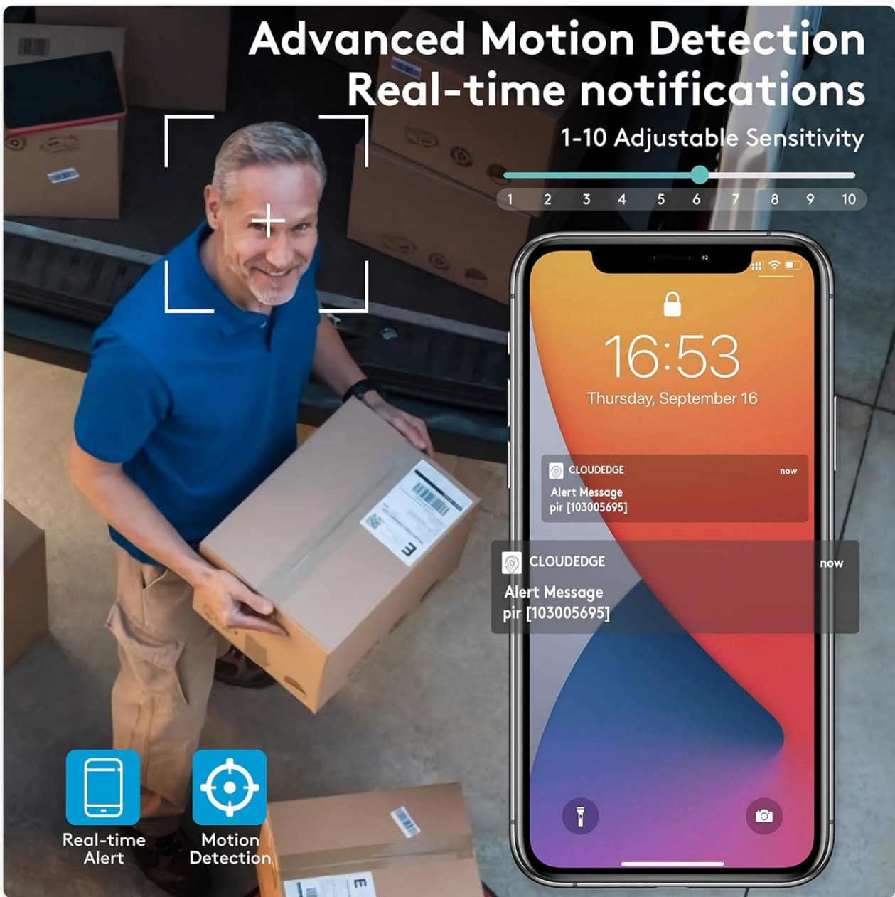
Figure 5.3: Advanced Motion Detection provides real-time notifications with adjustable sensitivity.