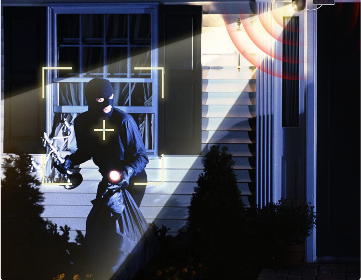
Figure 5.4: The camera can ward off intruders with a motion-activated alarm, including a flashing light and siren.

Flashing light and siren to drive away unwanted people.