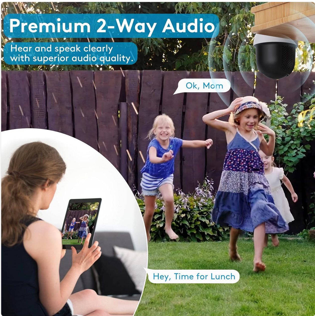
Figure 5.2: Premium 2-Way Audio allows clear communication.