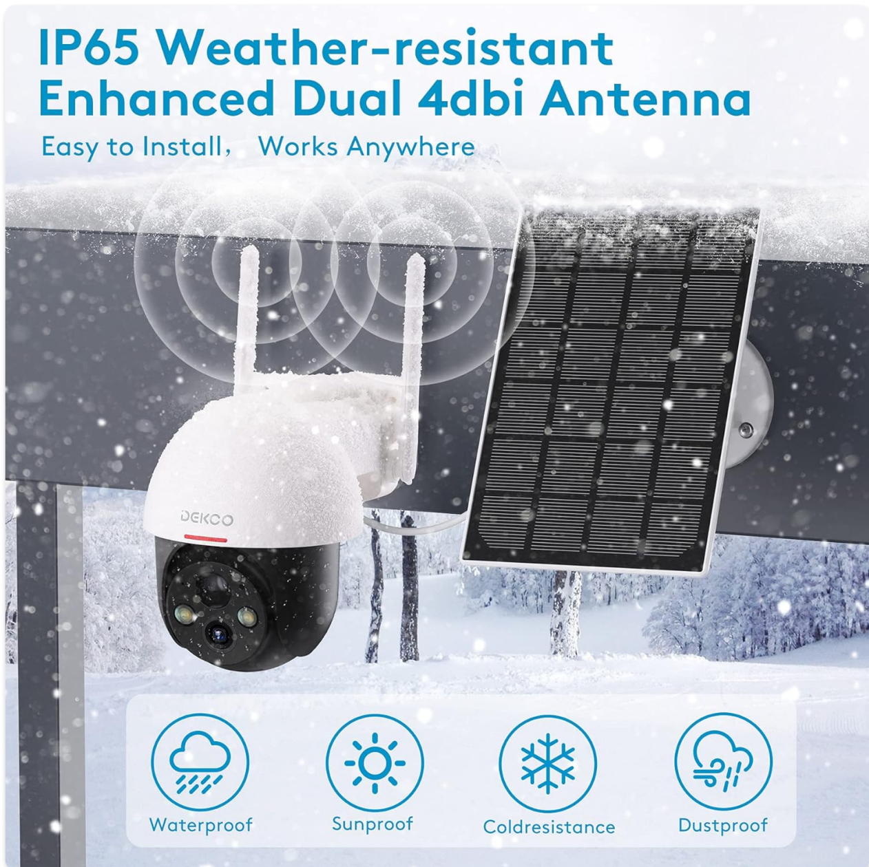
Figure 6.1: The camera is IP65 weather-resistant, designed to withstand various outdoor conditions.

Periodically check the CloudEdge app for available firmware updates. Keeping your camera's firmware updated ensures optimal performance, new features, and security enhancements.