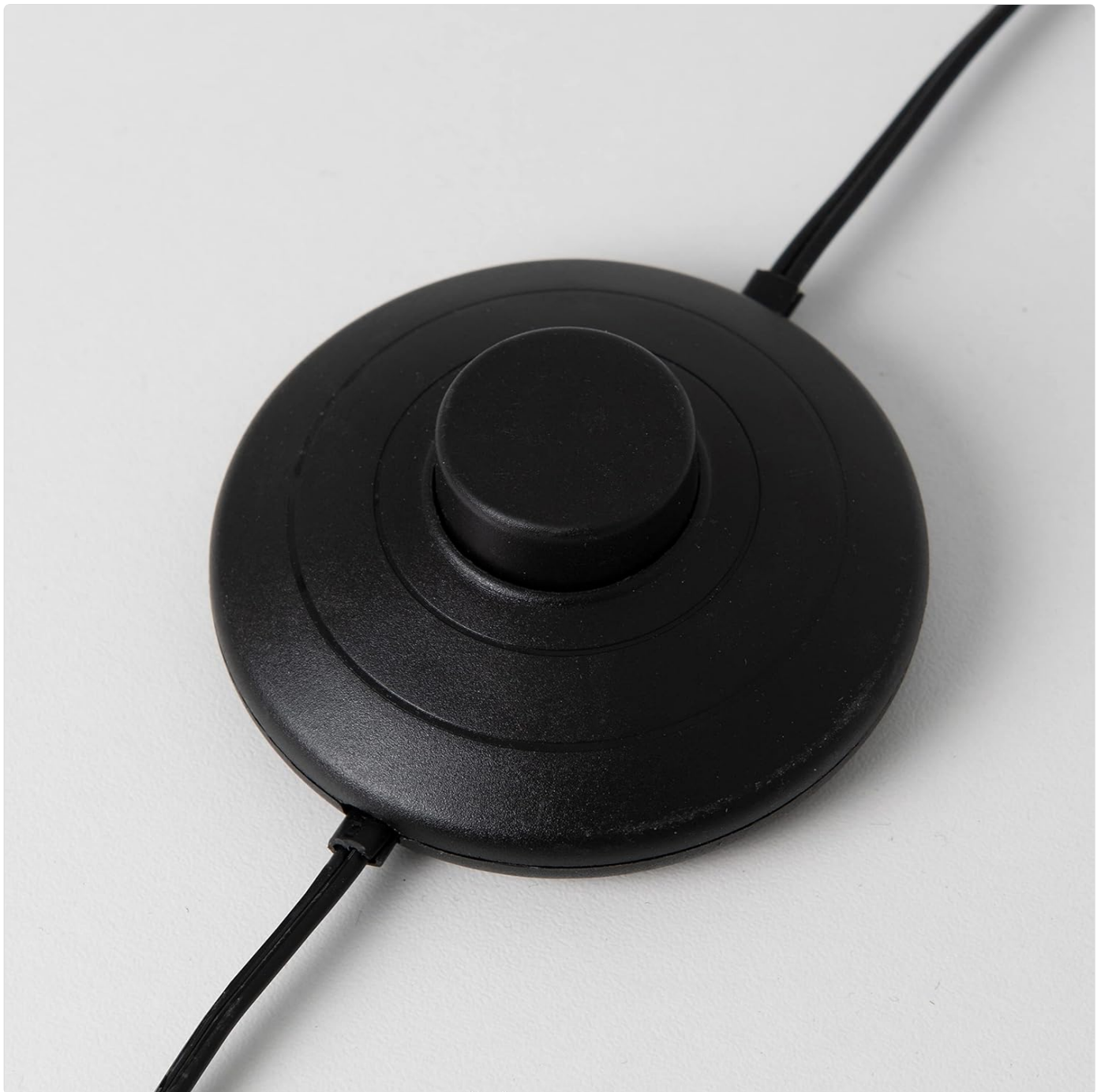
Figure 4: The integrated foot switch, used for both power control and dimming functions.