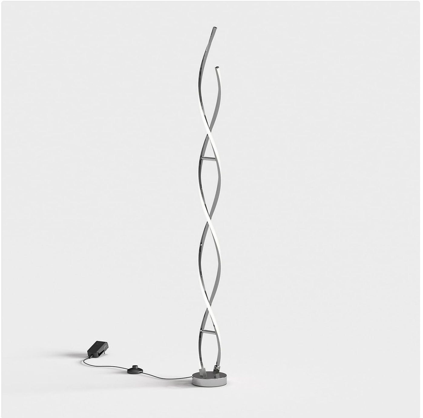
Figure 2: The Artika Swirl Floor Lamp as it appears with its power cable and foot switch.