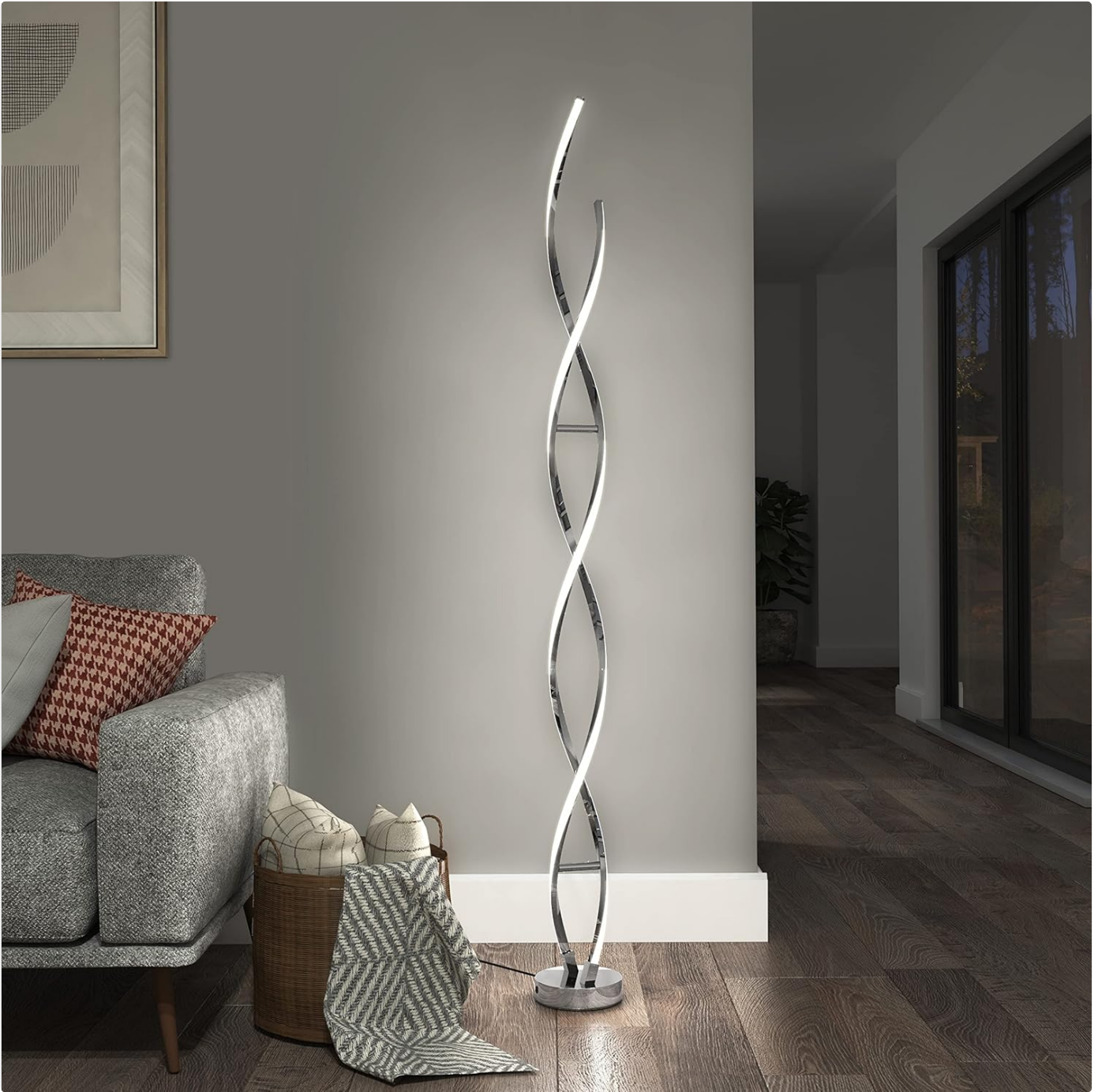
Figure 3: Example of lamp placement in a living room, demonstrating its aesthetic integration.