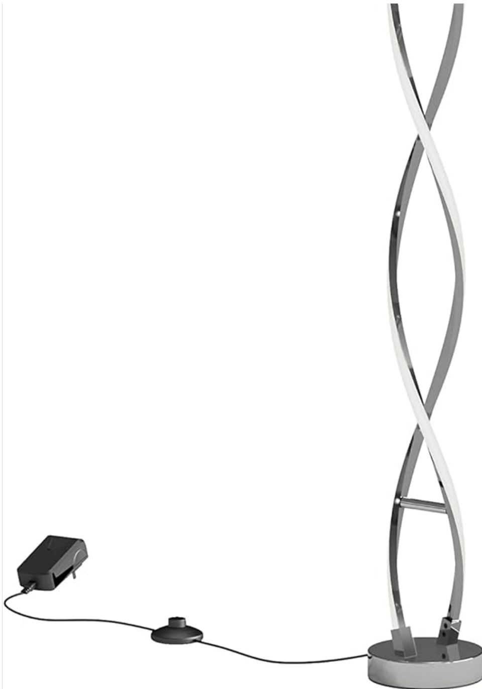
Figure 1: Artika Swirl Integrated LED Floor Lamp, showcasing its unique chrome finish and spiral design.