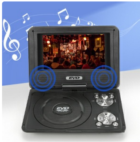
Image: The DVD player with visual indicators pointing to its dual built-in speakers.