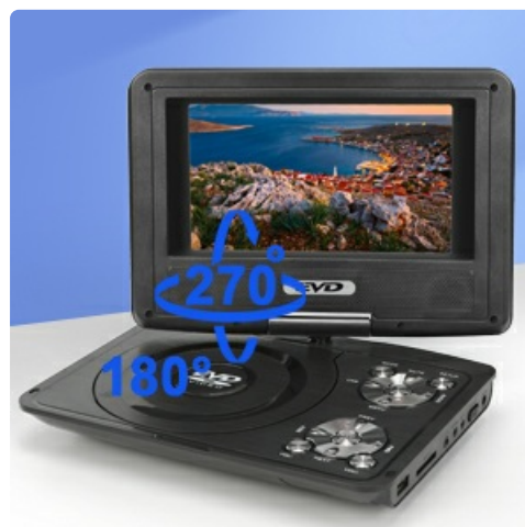
Image: A visual representation of the screen's 270-degree swivel and 180-degree flip capabilities.