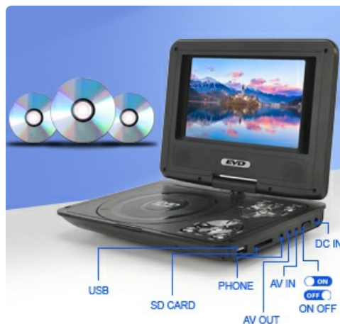
Image: A detailed view of the player's side ports, including USB, SD Card slot, headphone jack, AV In/Out, and DC In.