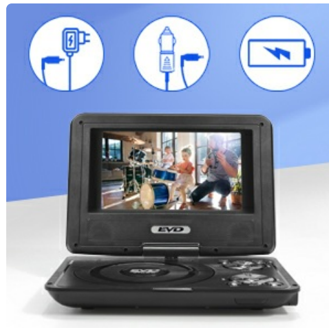
Image: Illustration of the three power modes: AC adapter, car adapter, and internal battery.