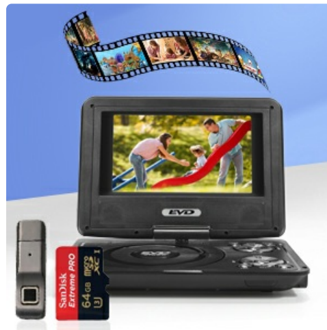
Image: The DVD player shown with a USB flash drive and an SD card, highlighting its compatibility with various digital media.