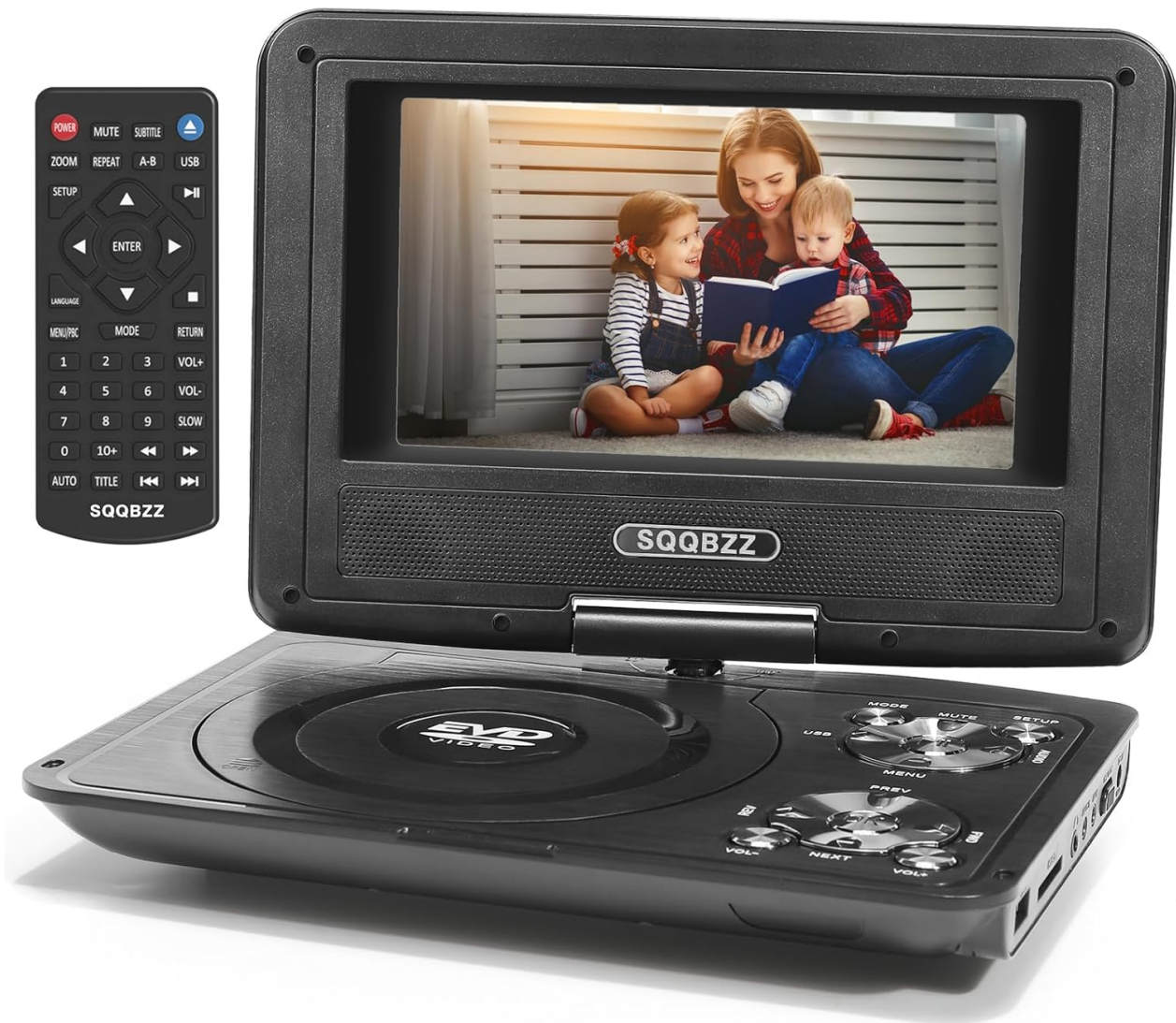
Image: The SQQBZZ 7-inch Portable DVD Player with its remote control, showcasing its compact design.