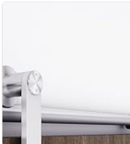
Step 4: Install floor guide.