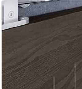
Step 2: Install hangers.