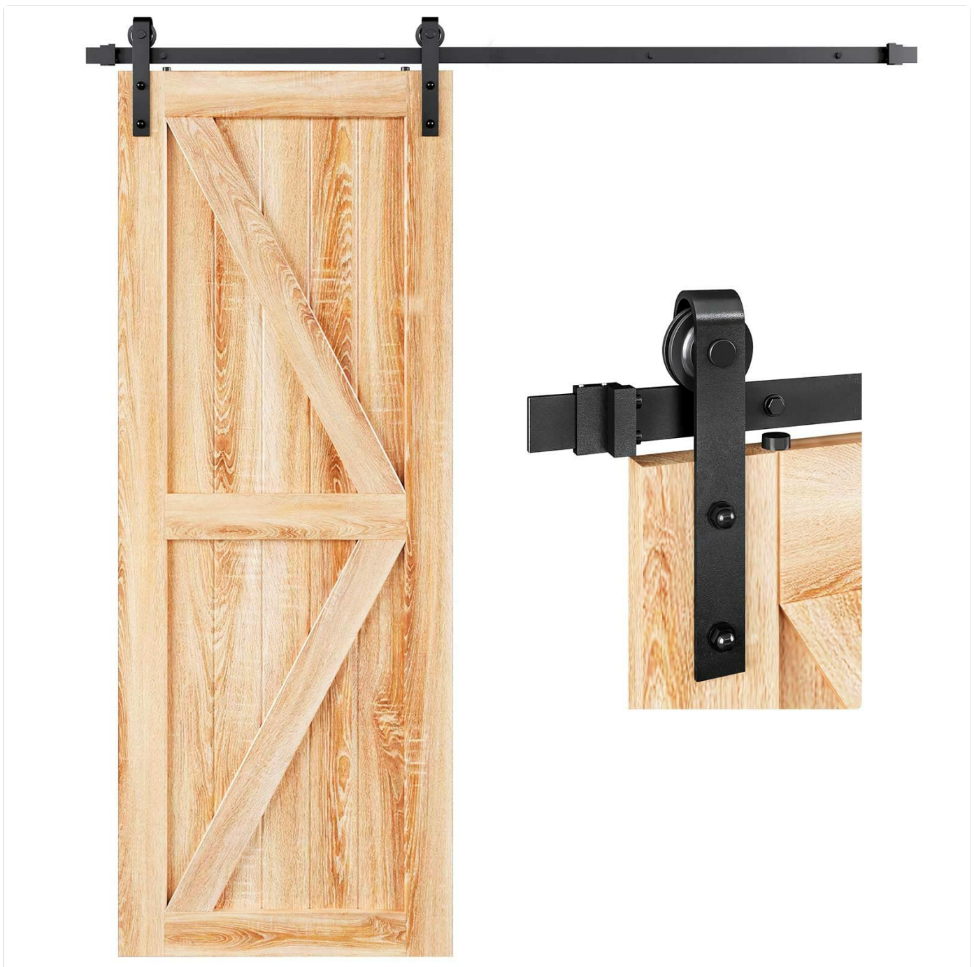
Image: The EaseLife 5.5FT Heavy Duty Sliding Barn Door Hardware Track Kit installed, showcasing its application in a home environment.