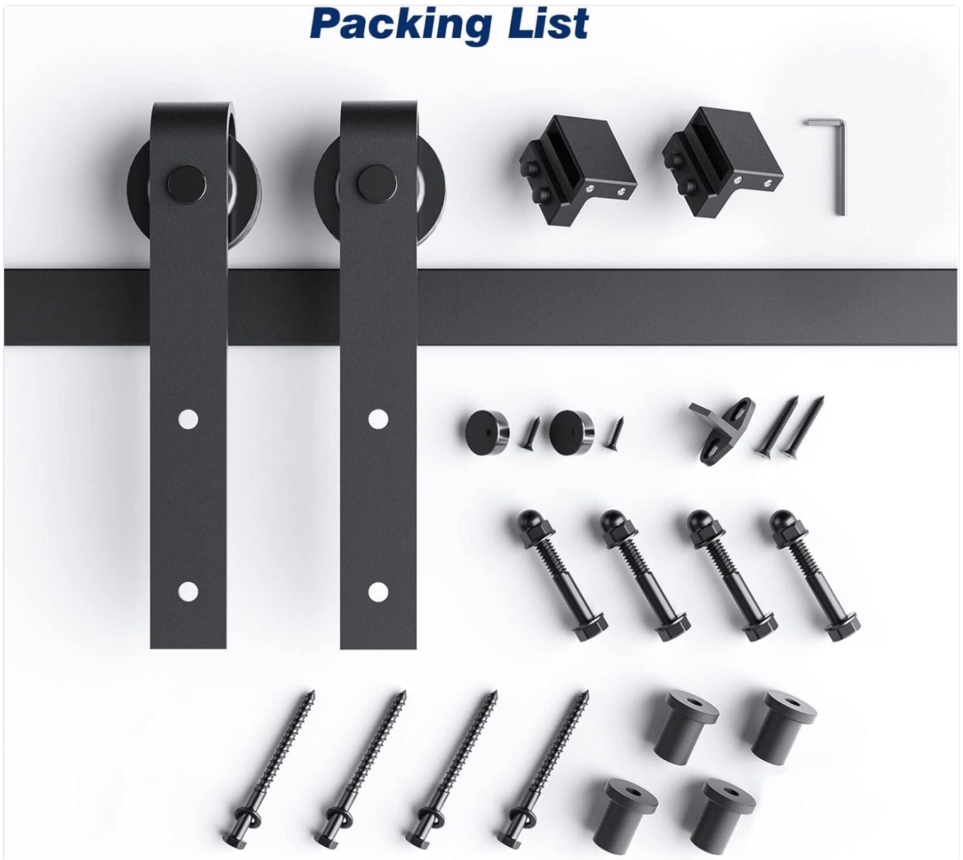
Image: A detailed view of all included components in the EaseLife barn door hardware kit.