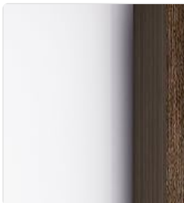
Step 5: Installation completed.