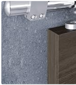
Step 1: Fix track to wall.