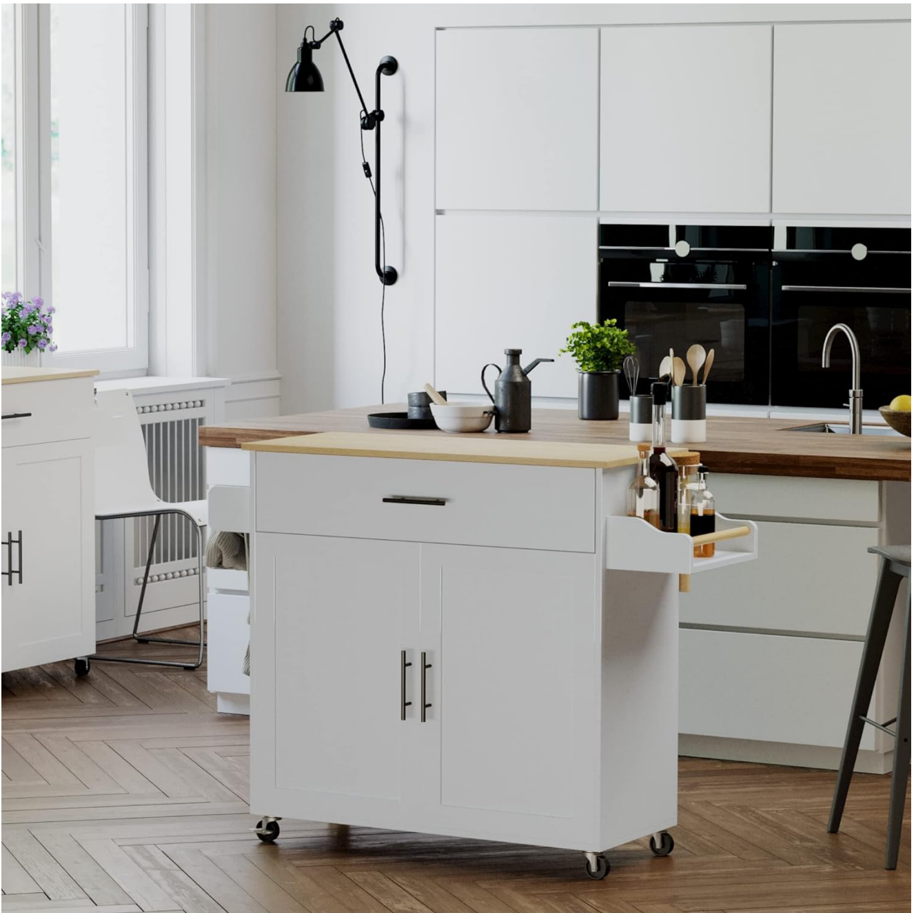
Figure 7: Spice Rack in Use.