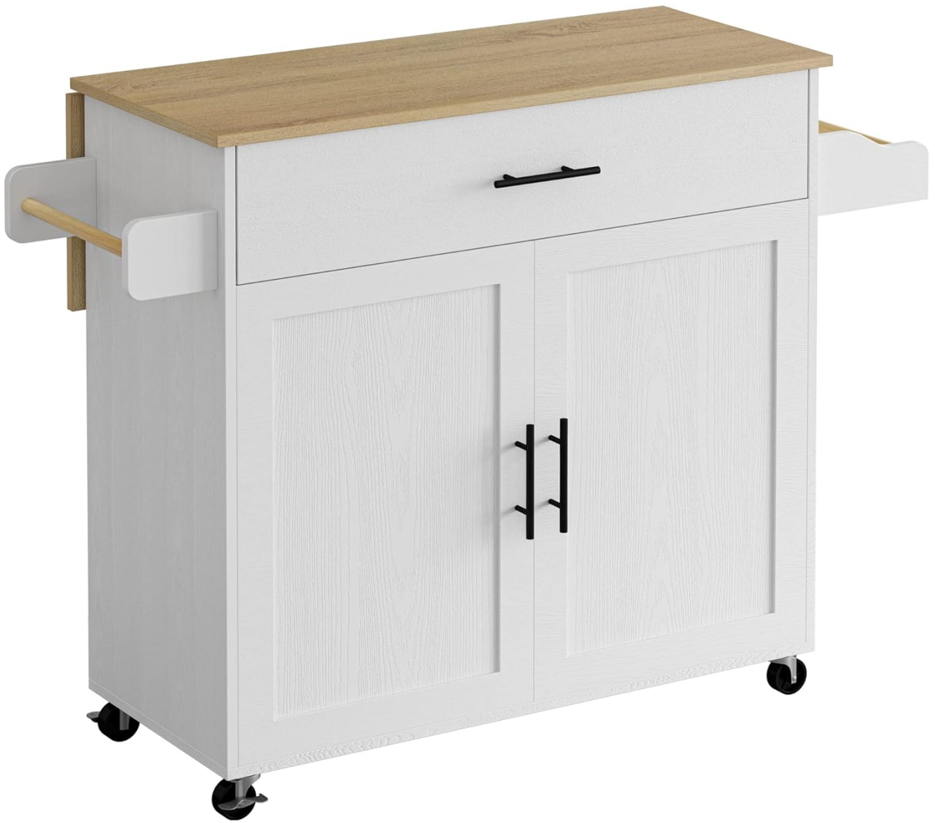
Figure 8: Towel Bar Detail.