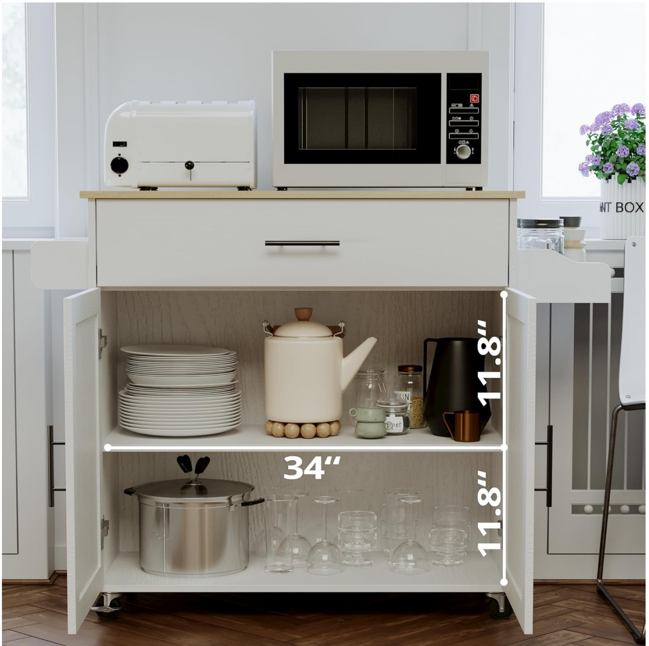
Figure 2: Interior Storage Dimensions.