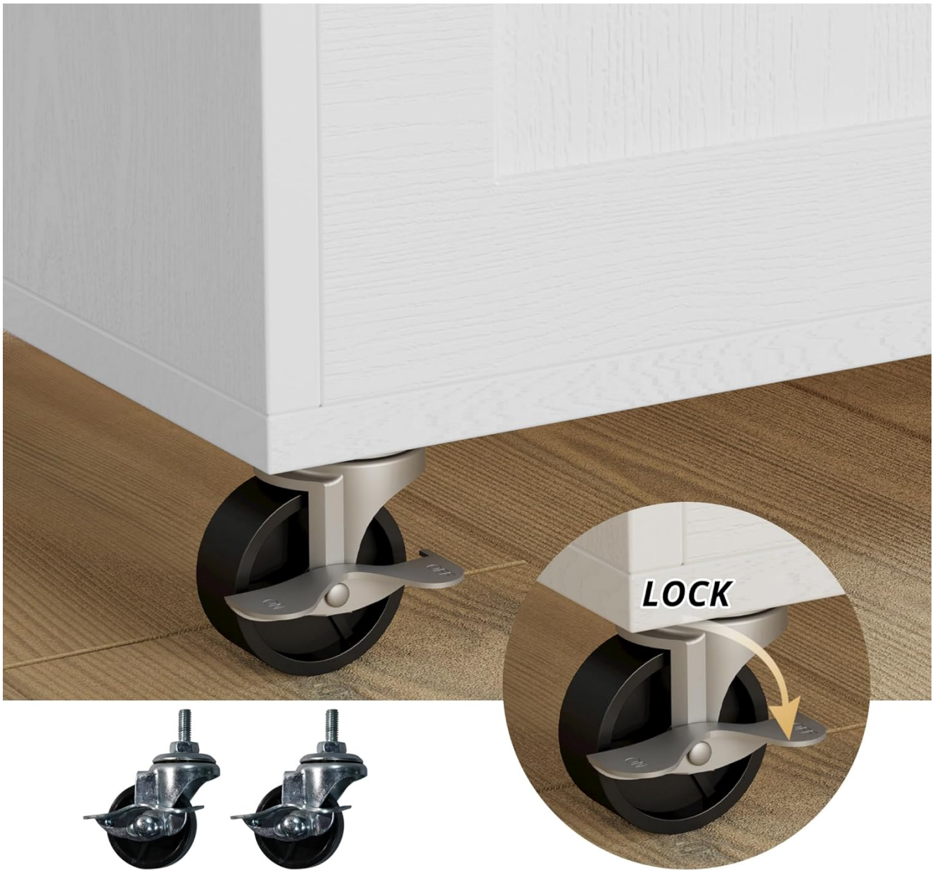
Figure 5: Locking Caster Detail.