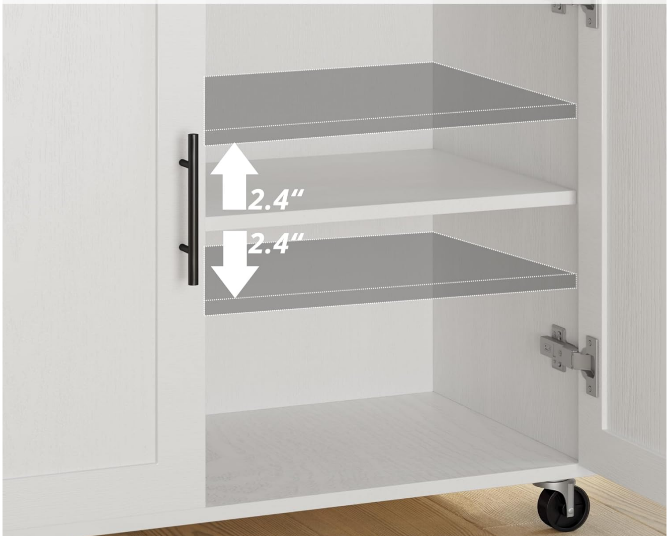
Figure 4: Adjustable Shelf Mechanism.