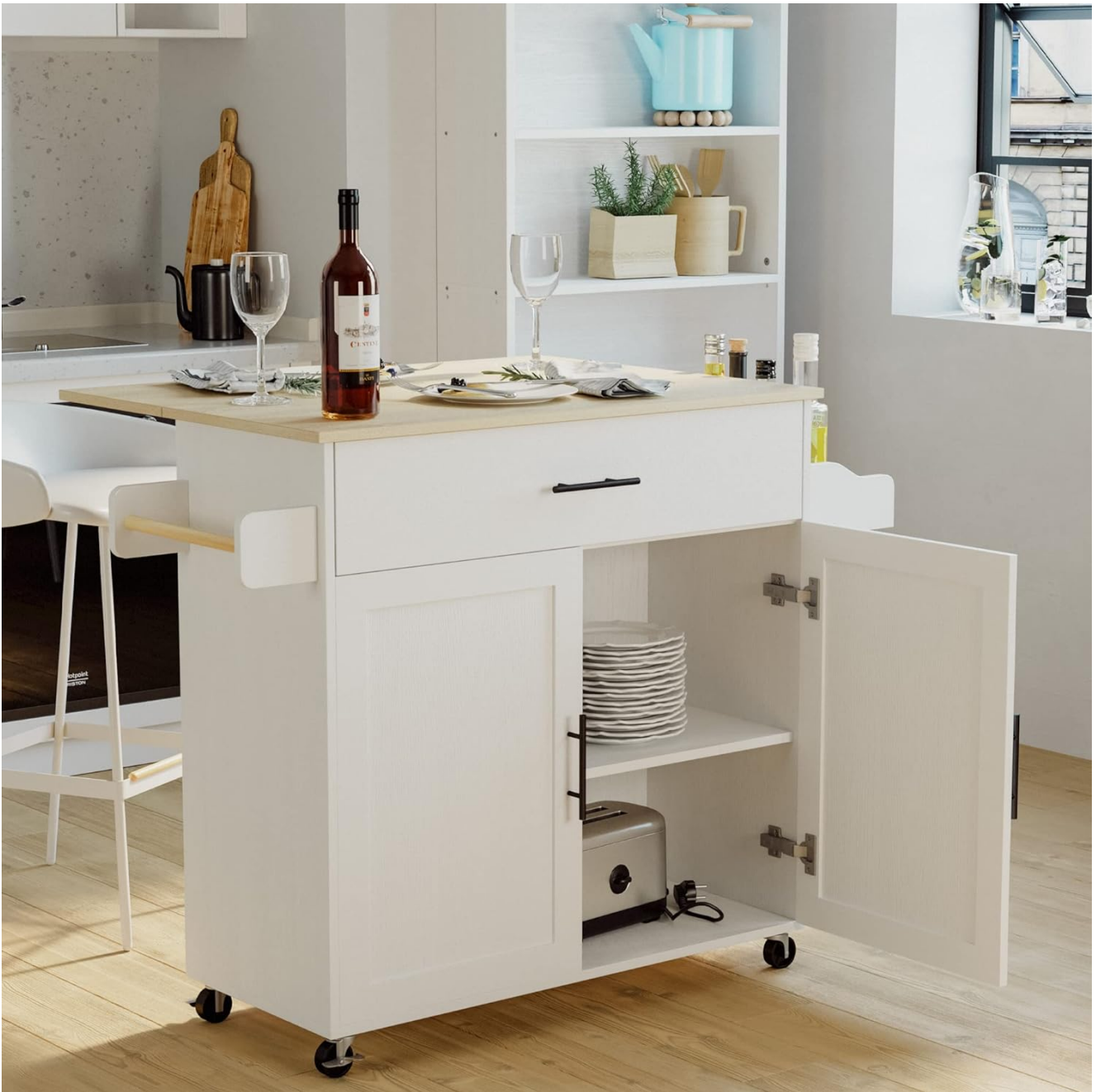
Figure 3: Assembled Kitchen Island with Cabinet Doors Open.

The IRONCK Rolling Kitchen Island Table requires assembly. All necessary hardware and tools are typically included. Follow the step-by-step instructions provided in the packaging for detailed assembly. It is recommended to have two people for assembly to ensure stability and ease of handling larger components.