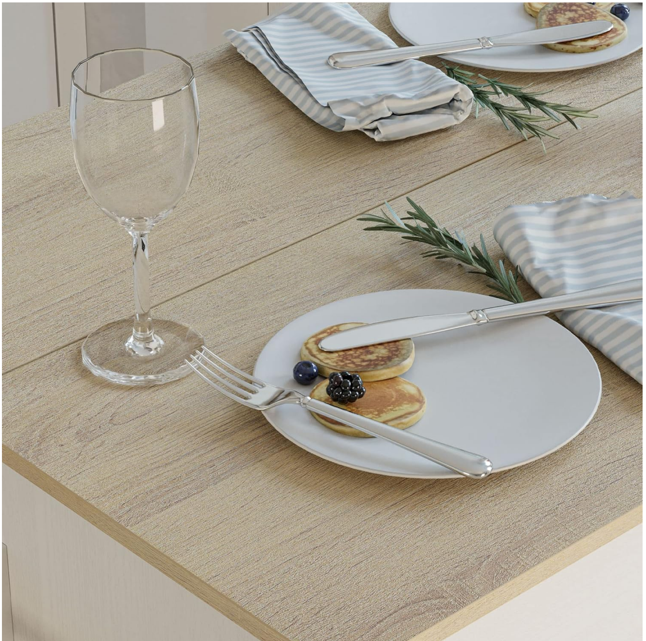
Figure 6: Drop Leaf Countertop in Extended Position.