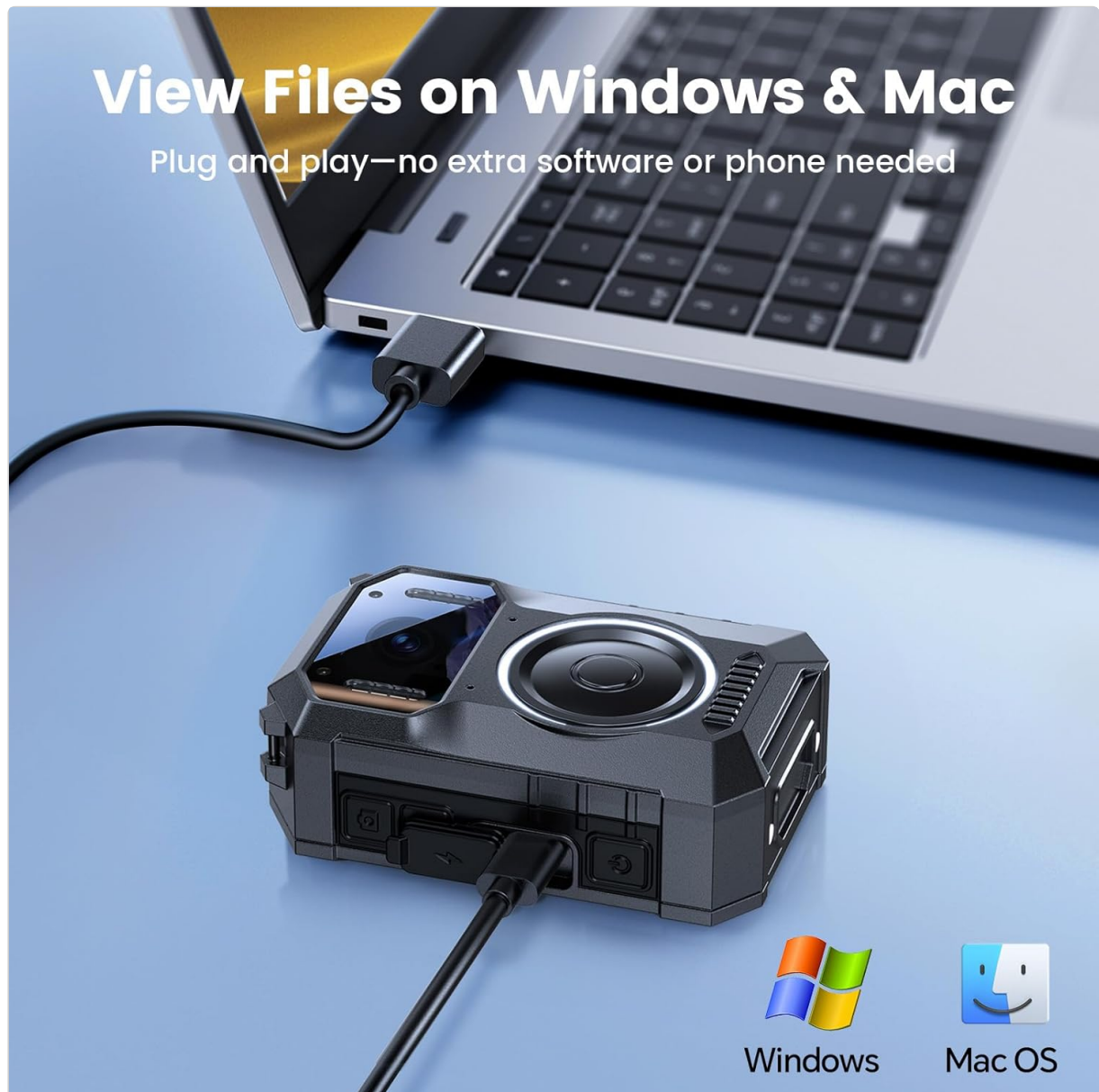
Figure 10: Connect your M11 to a computer to easily transfer and manage files.

The BOBLOV M11 is compatible with both Windows and Mac operating systems for easy file transfer. Connect the camera to your computer using the provided USB cable. The device will appear as a removable storage drive, allowing you to access and manage your recorded footage without requiring special software.