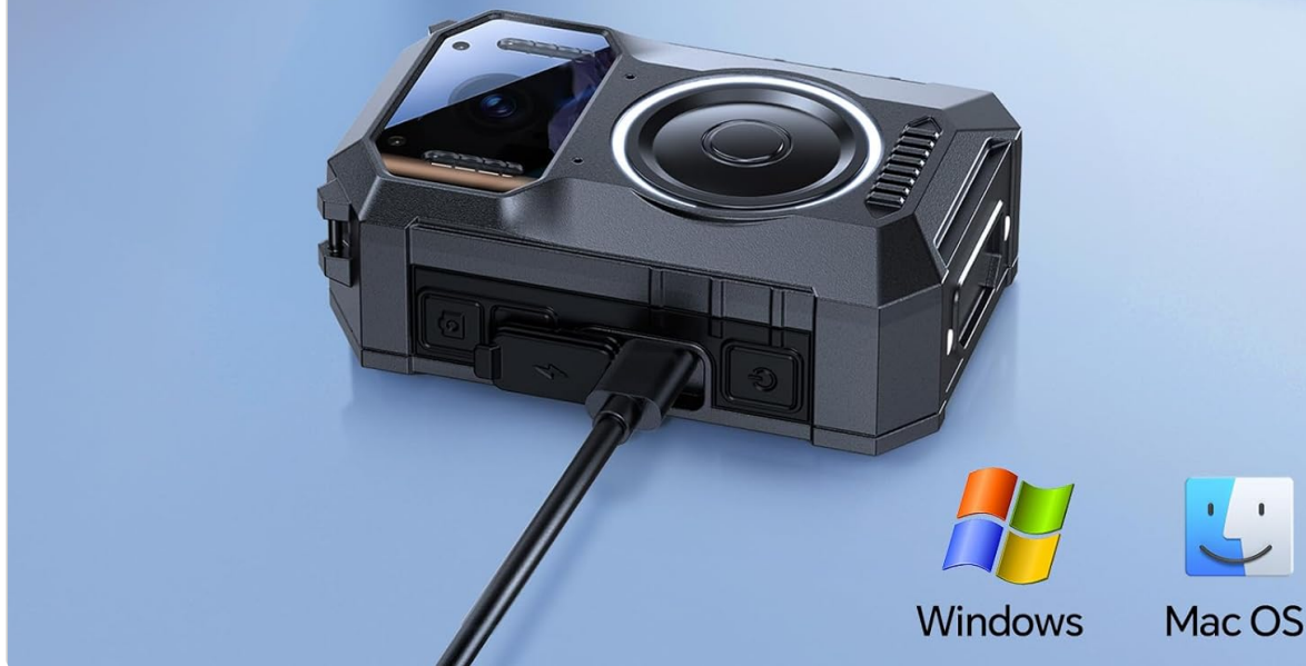
Figure 6: Seamlessly transfer and view your M11 footage on both Windows and Mac computers.

Plug and play—no extra software or phone needed