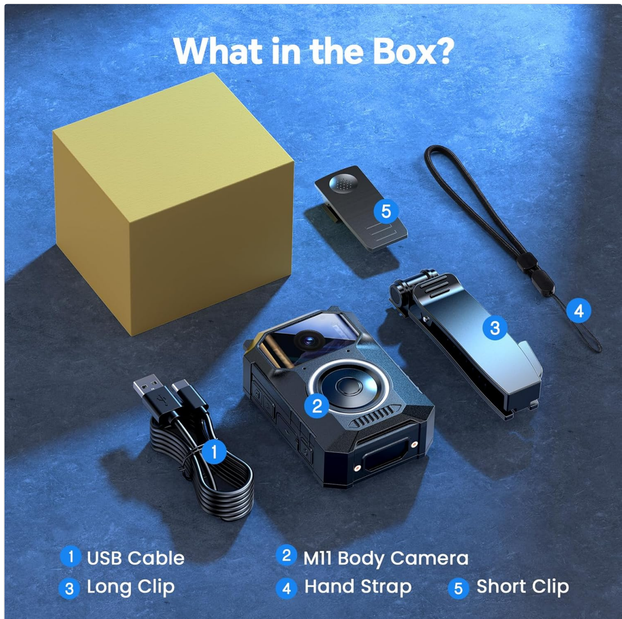
Figure 1: All items included in the BOBLOV M11 Body Camera package. This includes the M11 camera unit, a long clip, a short clip, a USB charging/data cable, and the user manual.