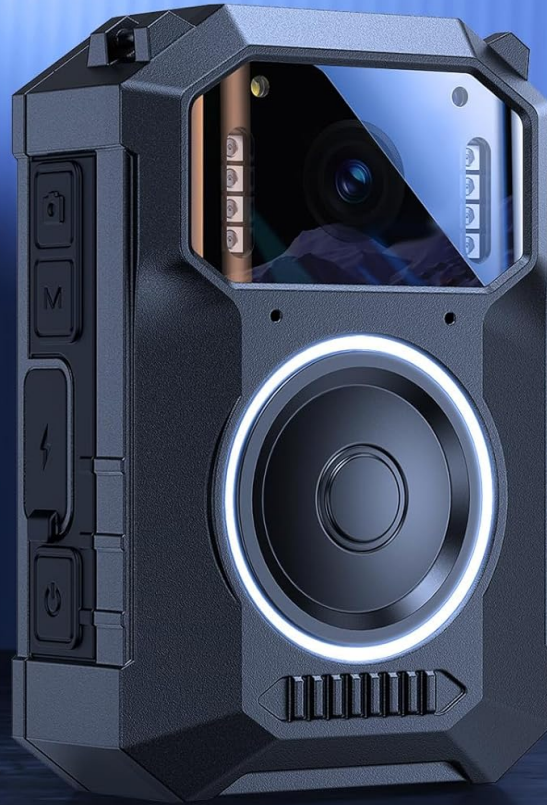
Figure 4: The M11's robust battery supports up to 10 hours of recording, ensuring coverage for full shifts.