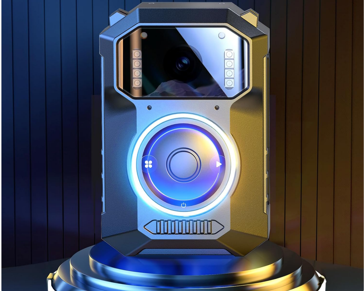
Figure 3: The prominent central button on the M11 ensures effortless operation, allowing users to press and record without needing to look.