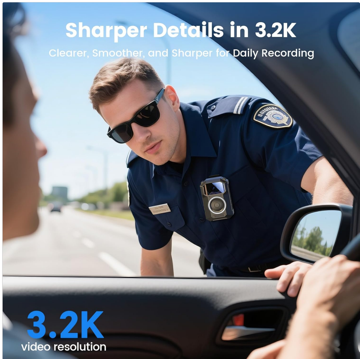
Figure 2: The M11 camera captures sharp details in 3.2K resolution, ideal for various recording scenarios.