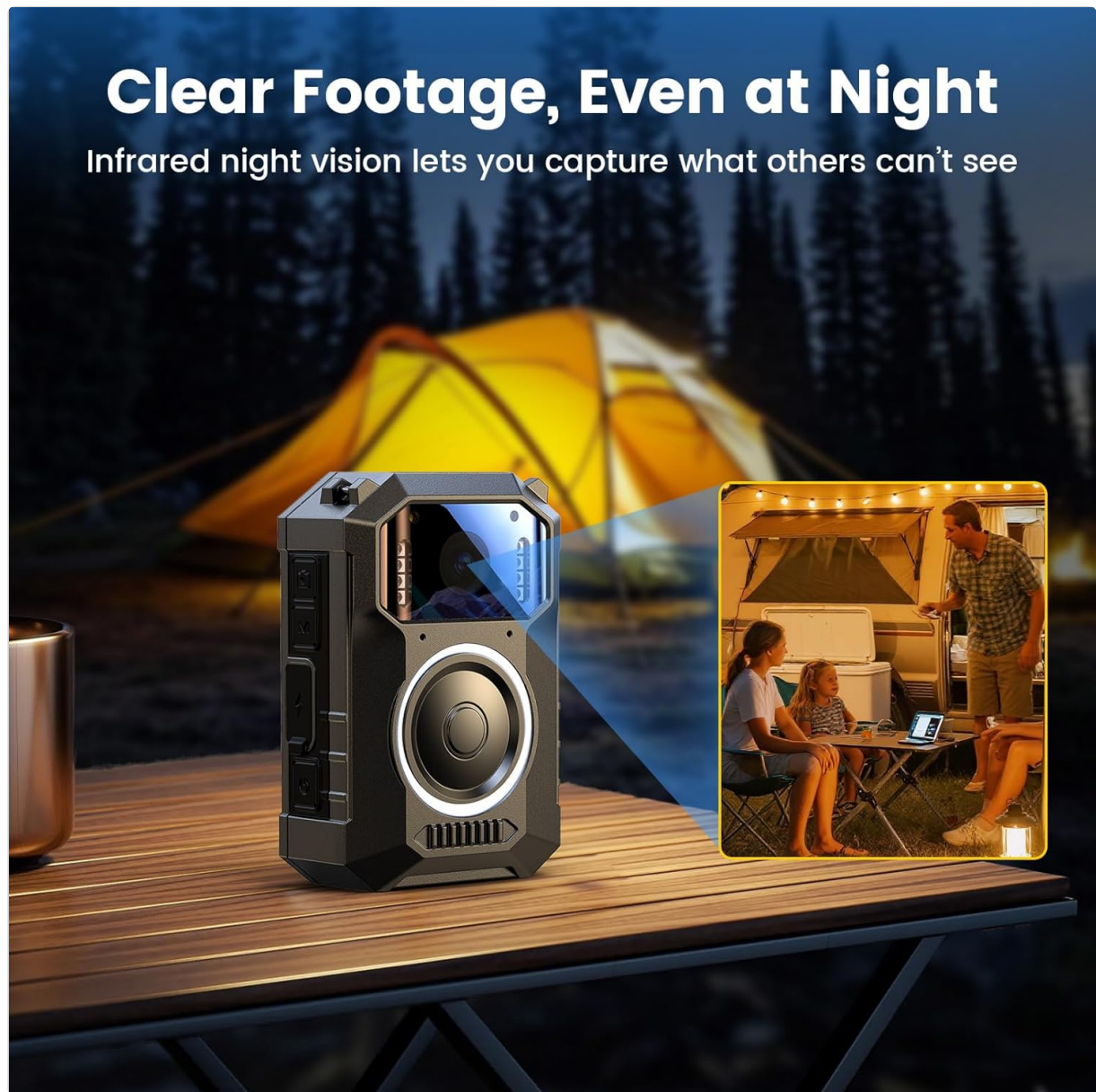
Figure 5: With 8 IR lights, the M11 provides clear footage in challenging low-light environments.