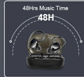
Image: The multifunction charging case is displayed, highlighting its 1800mAh capacity, digital battery display, and magnetic earbud placement.