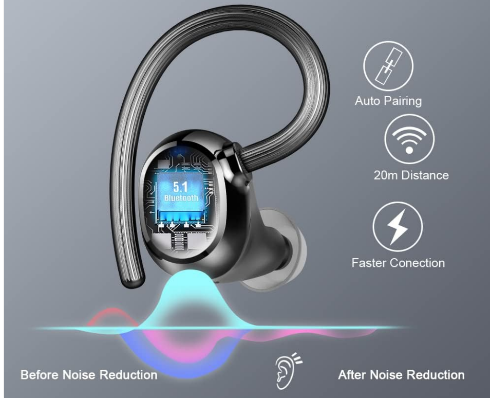
Image: An illustration demonstrating the advanced Bluetooth 5.1 chip, auto-pairing feature, and a 20-meter connection distance for stable connectivity.

Use the latest Bluetooth 5.1 chip to ensure a faster and more stable connection.