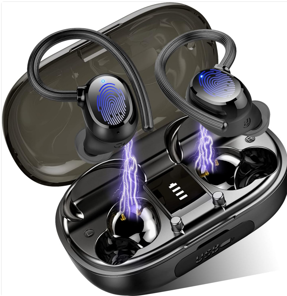
Image: The Geryst Q52 wireless earbuds are shown inside their open charging case, illustrating the product's design and charging contacts.