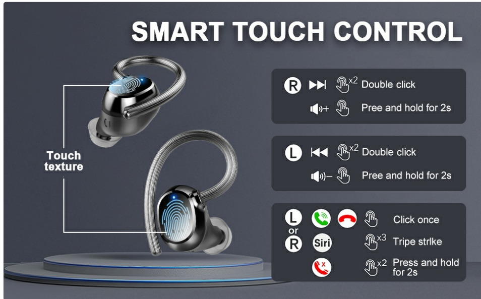
Image: A visual guide detailing the smart touch control functions for both left and right earbuds, including actions for music, calls, and voice assistant.