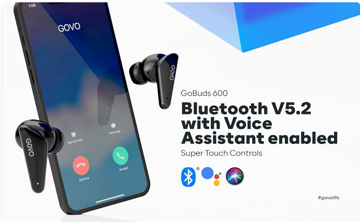
Image Description: A smartphone screen is shown with call and voice assistant icons (Bluetooth, Google Assistant, Siri) alongside the GOVO GOBUDS 600 earbuds. This illustrates the seamless integration of Bluetooth V5.2 and voice assistant features for convenient control.

Access your device's voice assistant (Google Assistant, Siri) with a simple touch command on the earbuds. This allows for hands-free control of music, calls, and other smart functions.