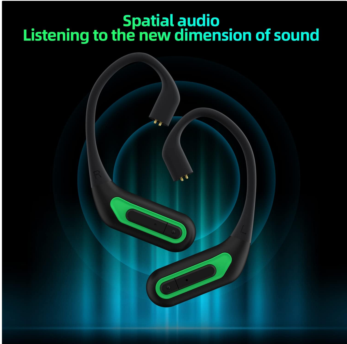
Image: A visual representation detailing the activation and benefits of Full Power Mode, High Performance Mode (Game Mode), and Spatial Audio.