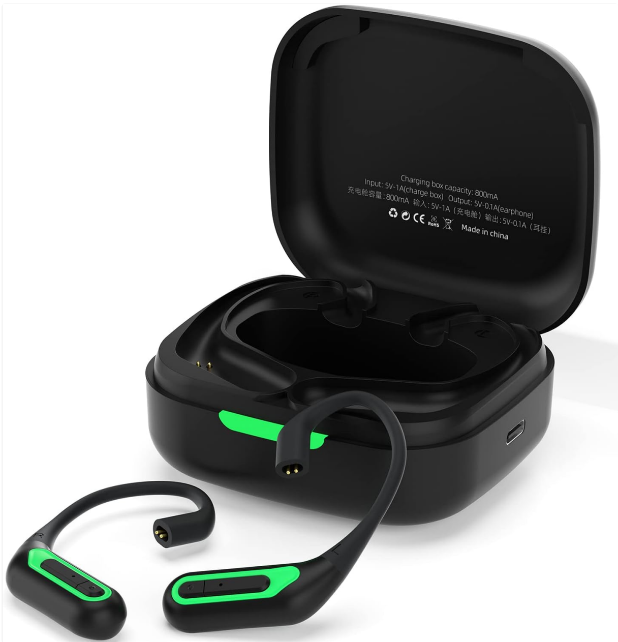
Image: The erjigo KZ-AZ10 wireless earhooks shown inside their charging case. The earhooks are black with green accents, and the charging case is black.