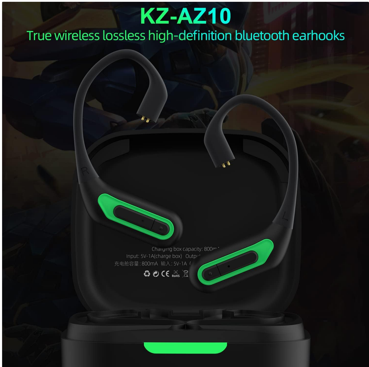
Image: A close-up of the erjigo KZ-AZ10 charging case with the earhooks inside, showing the charging specifications printed on the inner lid.