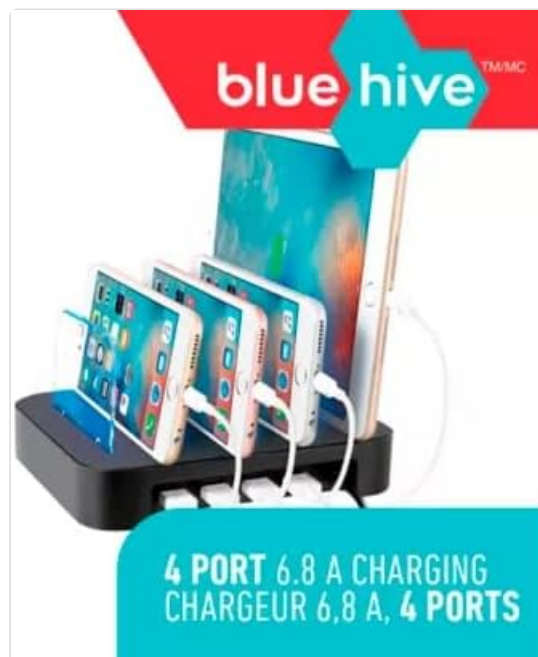
Image: A close-up view of the Bluehive 4-Port Charging Station with various devices connected, highlighting the charging ports and the overall setup.