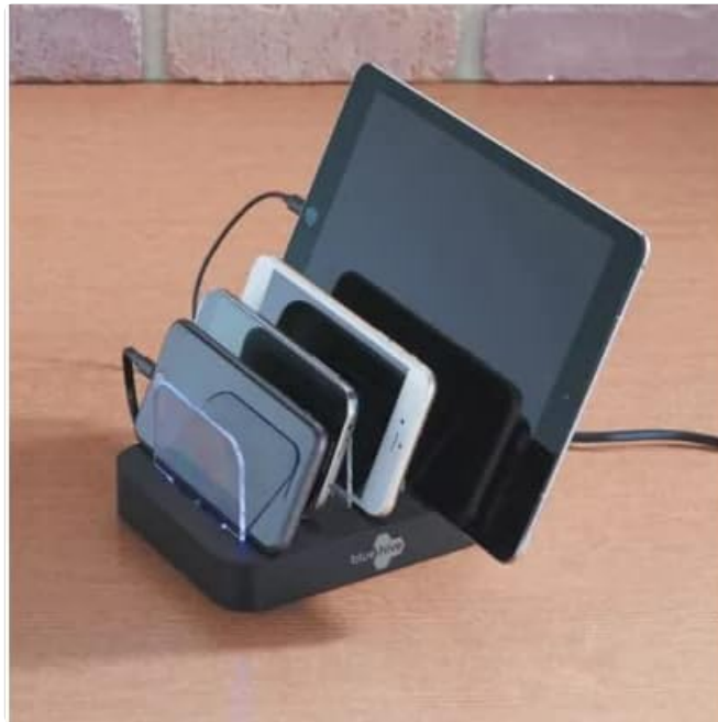
Image: The Bluehive 4-Port Charging Station shown with multiple smartphones and a tablet docked for charging, illustrating its capacity and design.