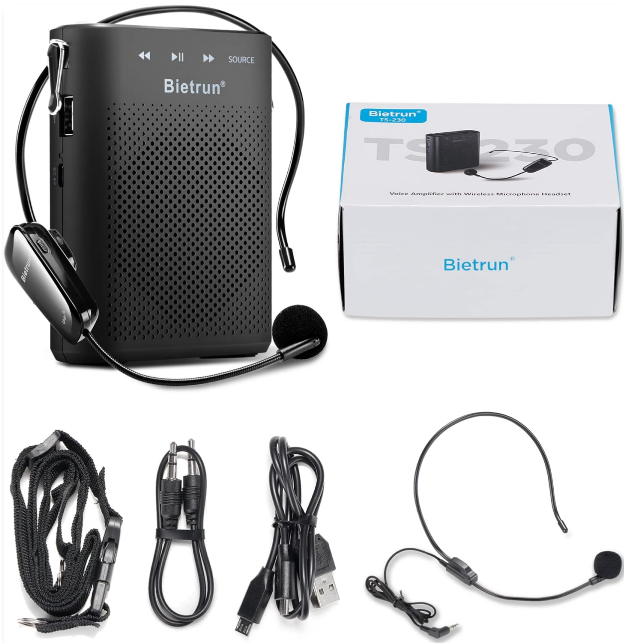
Image: All items included in the Bietrun Voice Amplifier package.