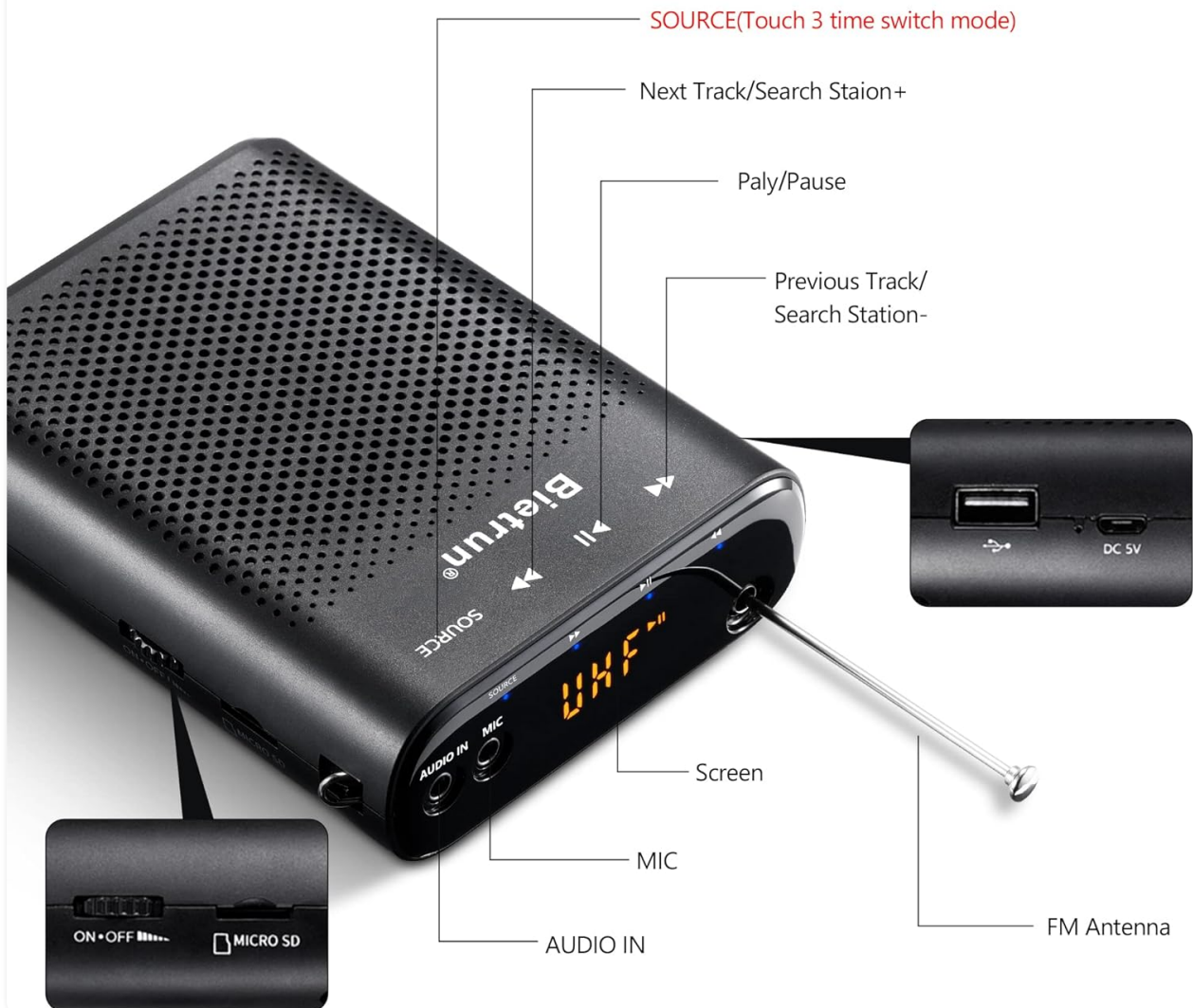
Image: Detailed view of the amplifier's touch controls, ports (MIC, AUDIO IN, USB, DC 5V), and FM antenna.

Touch SOURCE button 3 times to switch mode