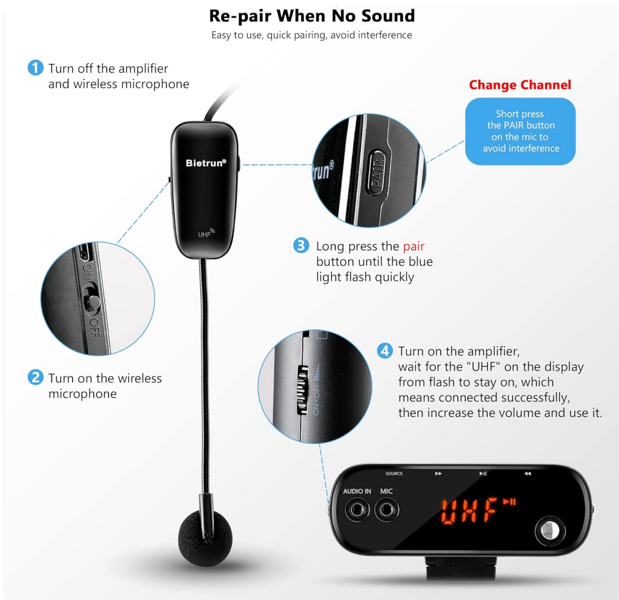
Image: Visual guide for re-pairing the wireless microphone and amplifier, showing power buttons and pairing indicator.

Video: Demonstrates how to use the Bietrun Voice Amplifier and troubleshoot pairing issues if there is no sound. This video is provided by the seller, Bietrun.