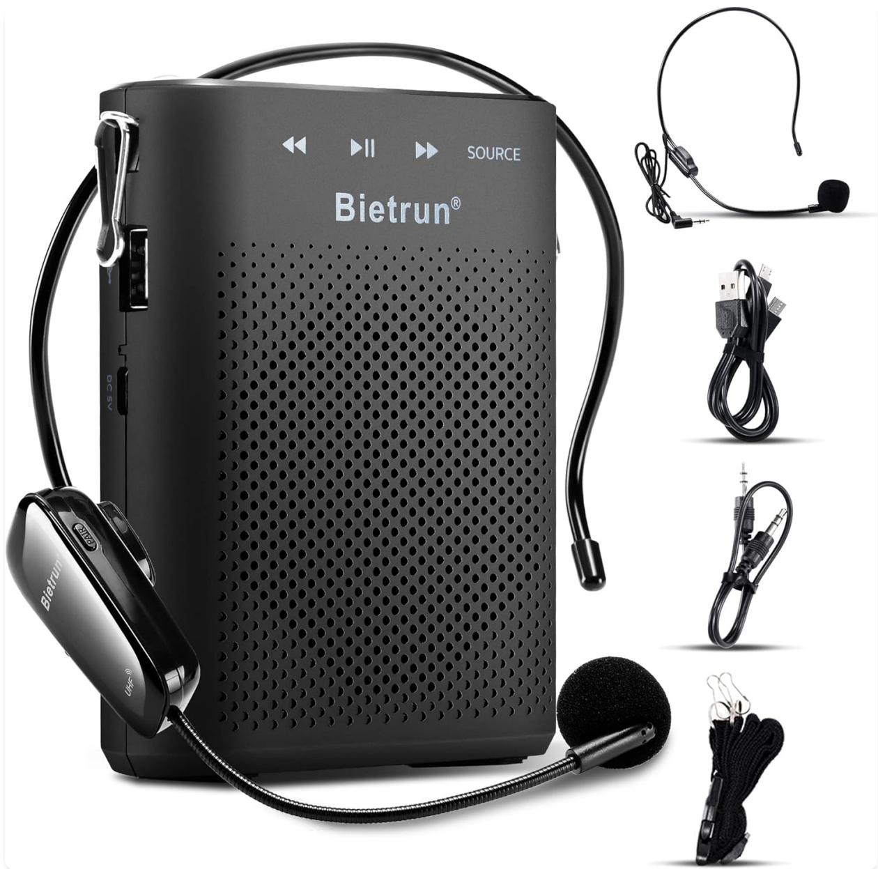
Image: The Bietrun Voice Amplifier main unit with its accompanying headsets and cables.