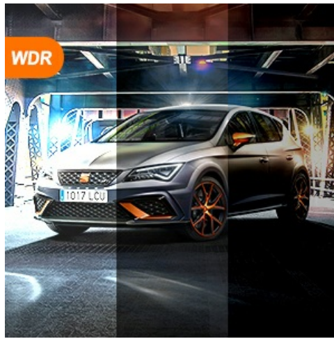
Image: Visual representation of WDR technology improving image clarity in varying light conditions.