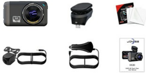
Image: Contents of the JOMISE D530 Dash Cam package.