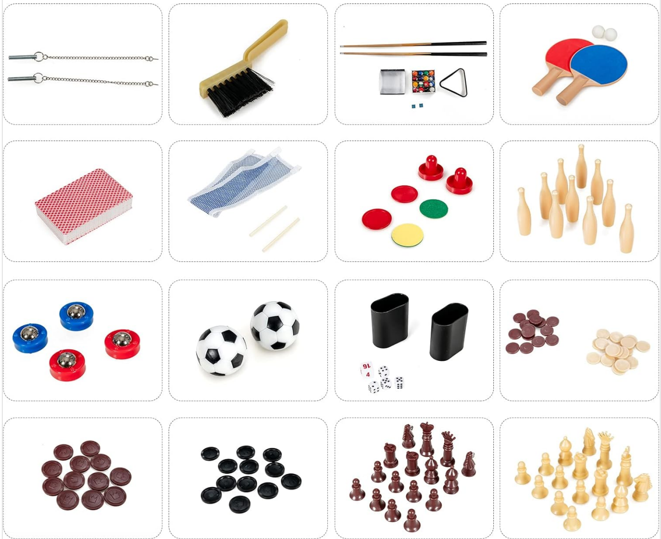
Figure 1: All accessories included with the game table. This includes items for foosball, billiards, table tennis, air hockey, bowling, chess, checkers, backgammon, and poker, along with assembly hardware.

Corresponding accessories satisfy your various needs for entertainment