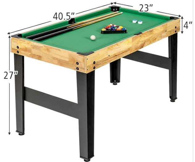
Figure 4: Product dimensions and player count for the Goplus 10-in-1 game table.