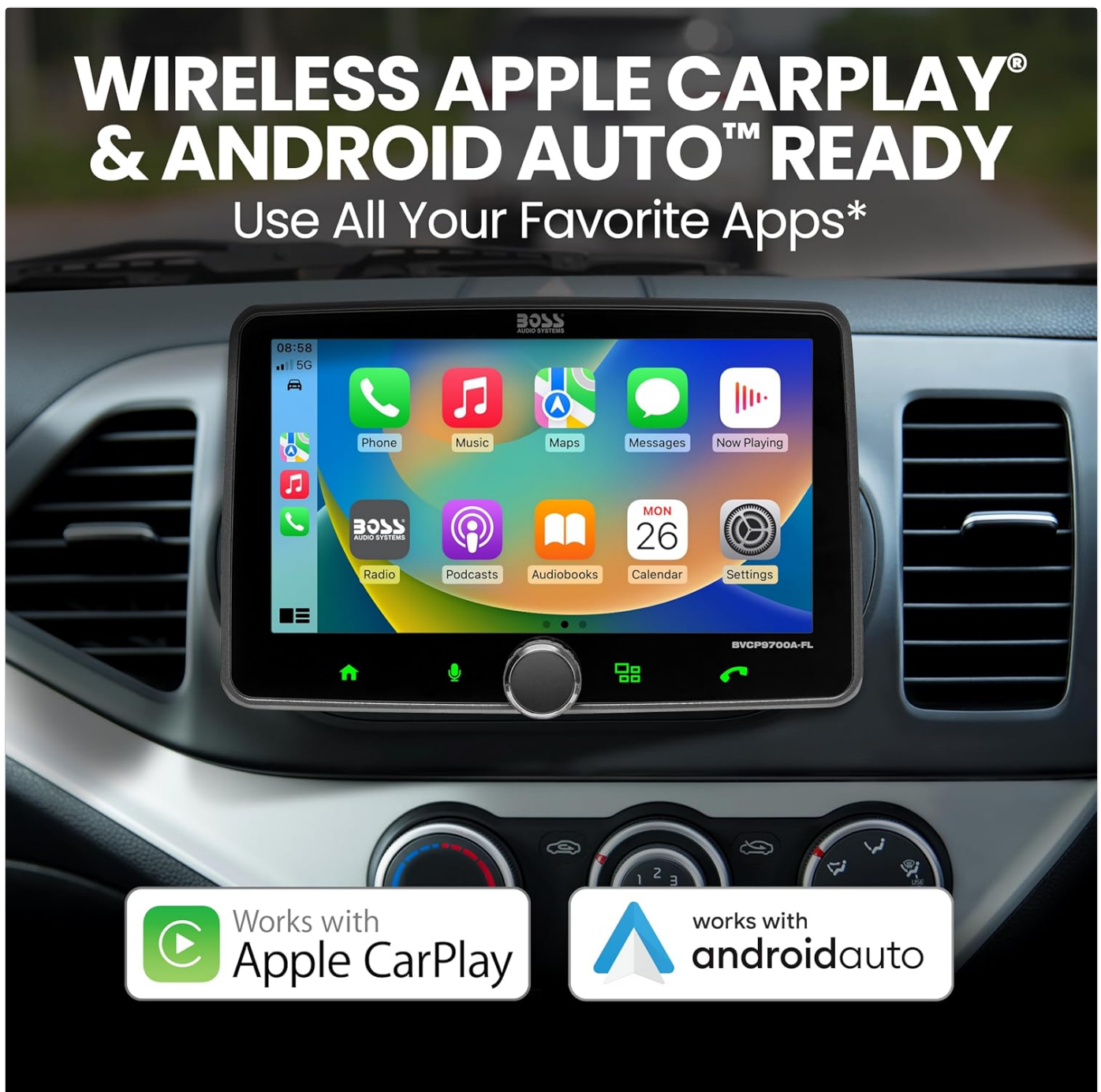
Figure 5.1: Wireless Apple CarPlay and Android Auto functionality.