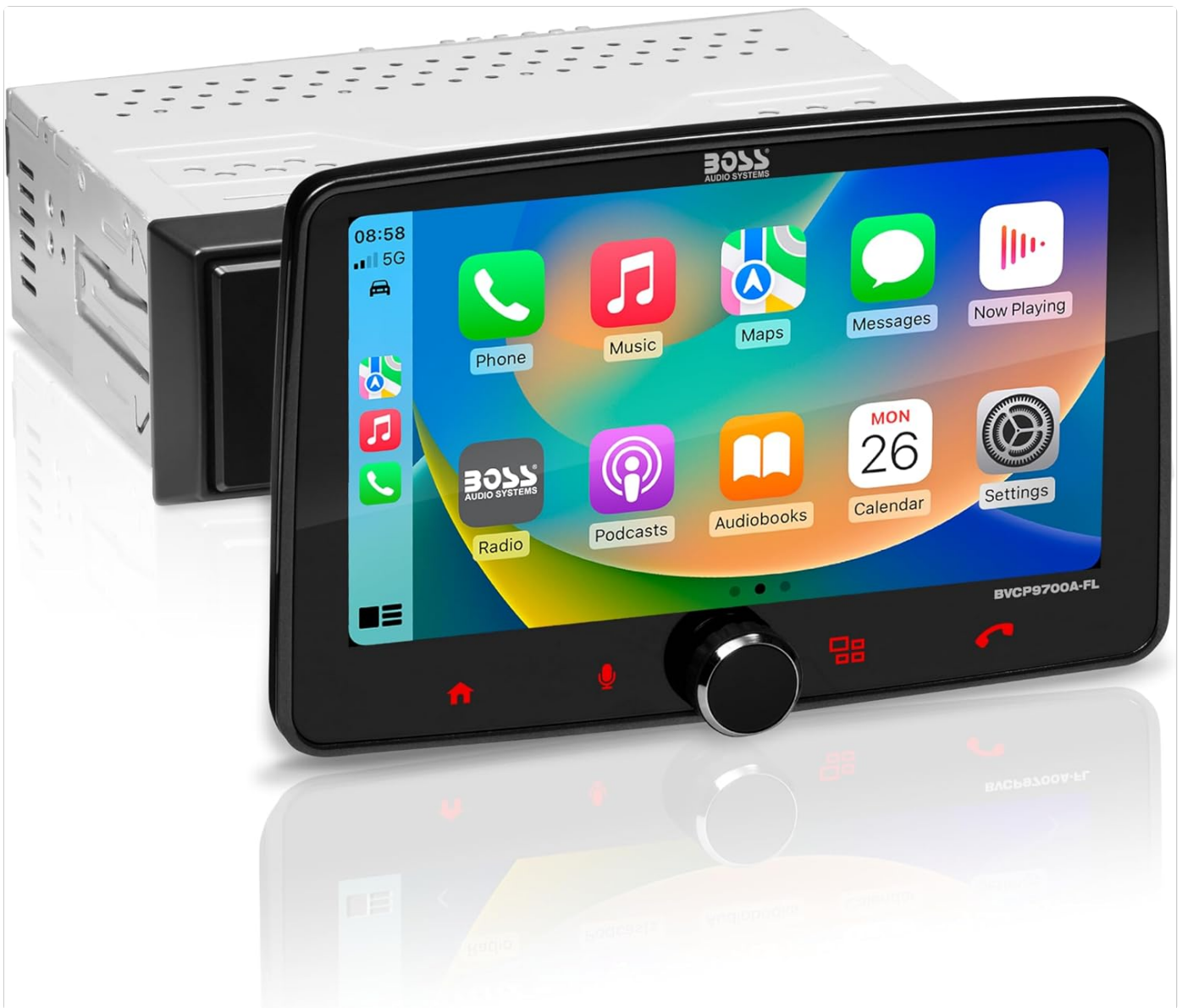
Figure 1.1: Front view of the BOSS Audio Systems BVCP9700A-FL car stereo with its 7-inch touchscreen.