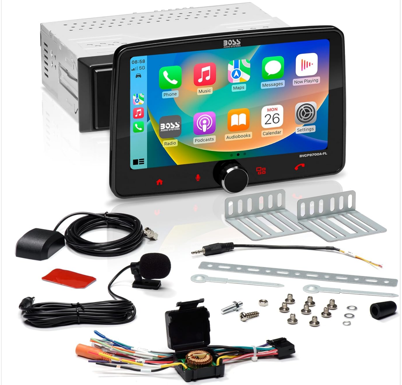
Figure 3.1: All components included with the BVCP9700A-FL car stereo.