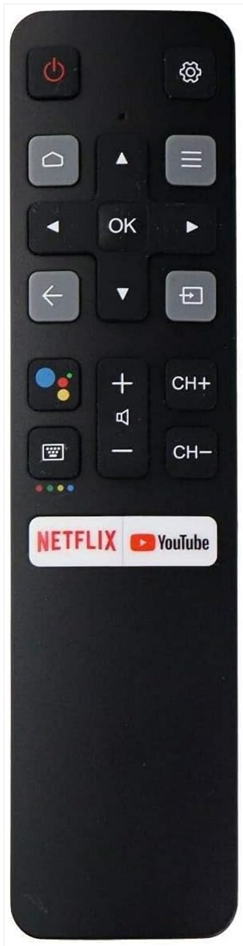
Figure 1: BESIA Bluetooth Remote Control RC802V FNR1