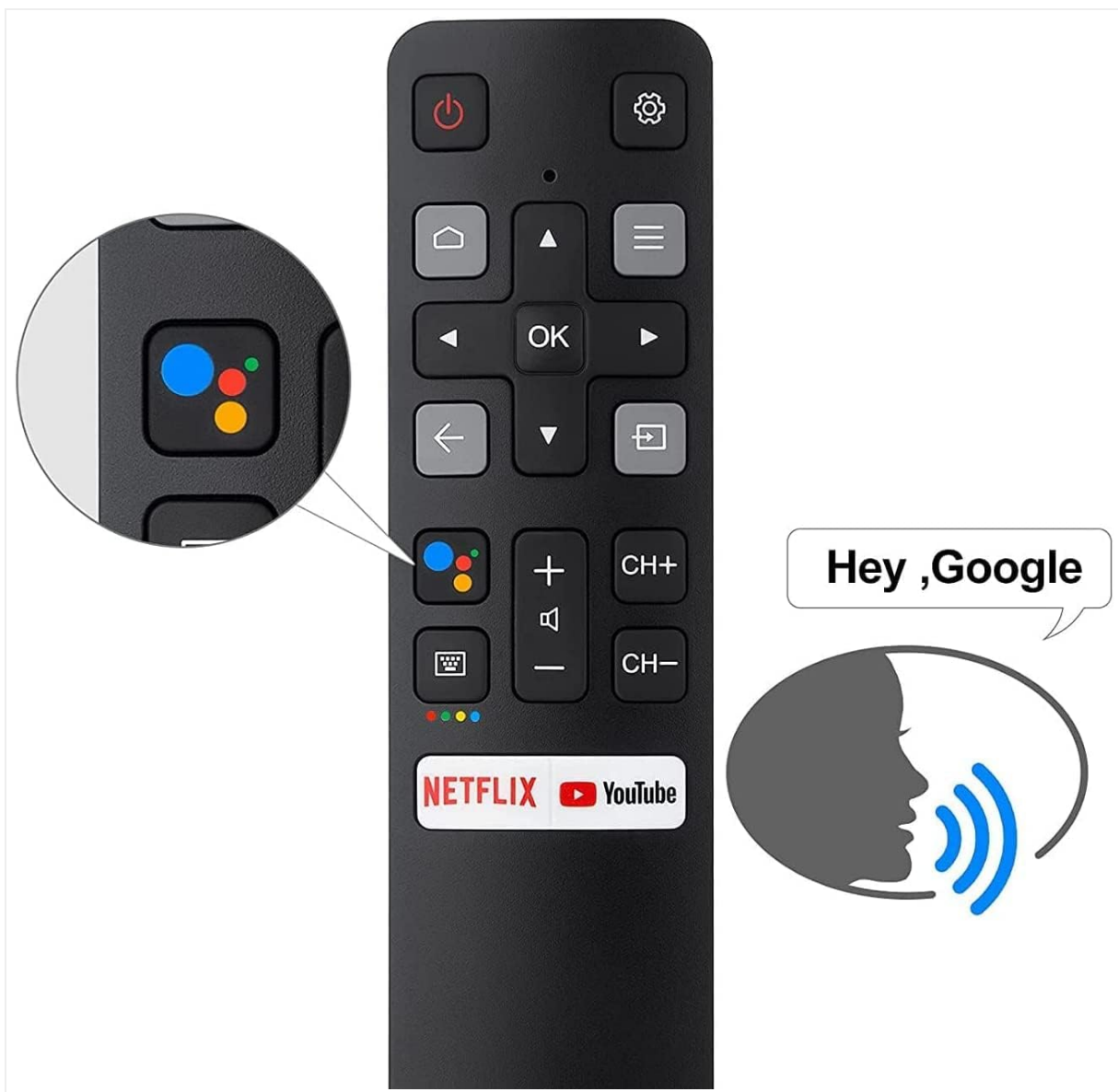
Figure 5: Google Assistant Voice Control