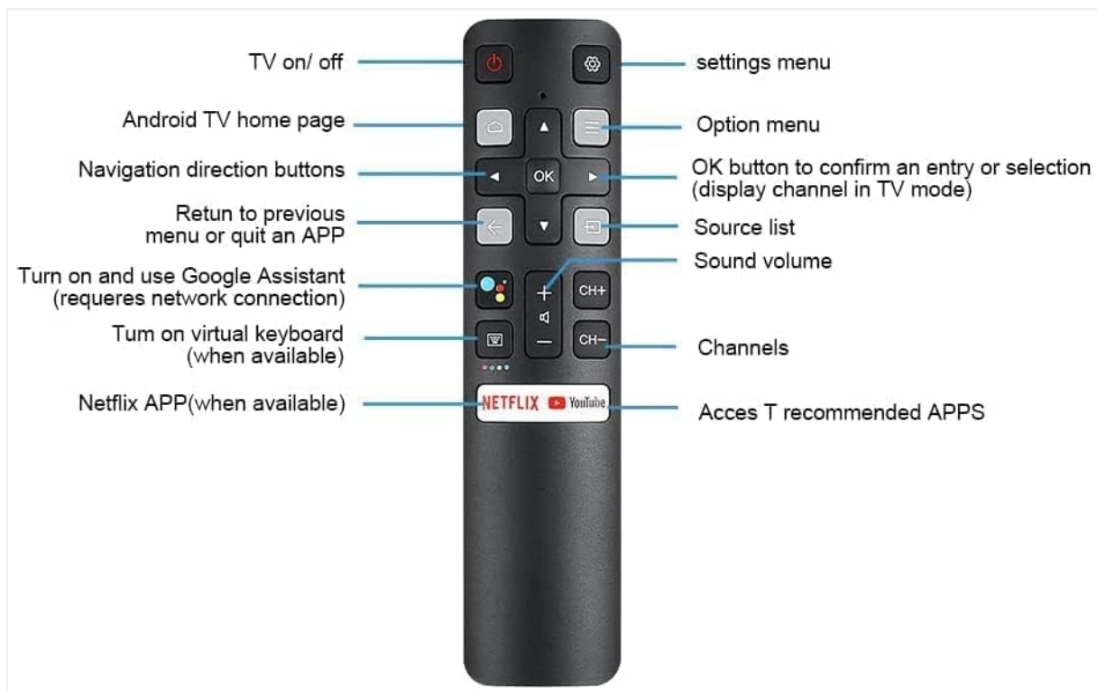
Figure 4: Remote Control Button Functions