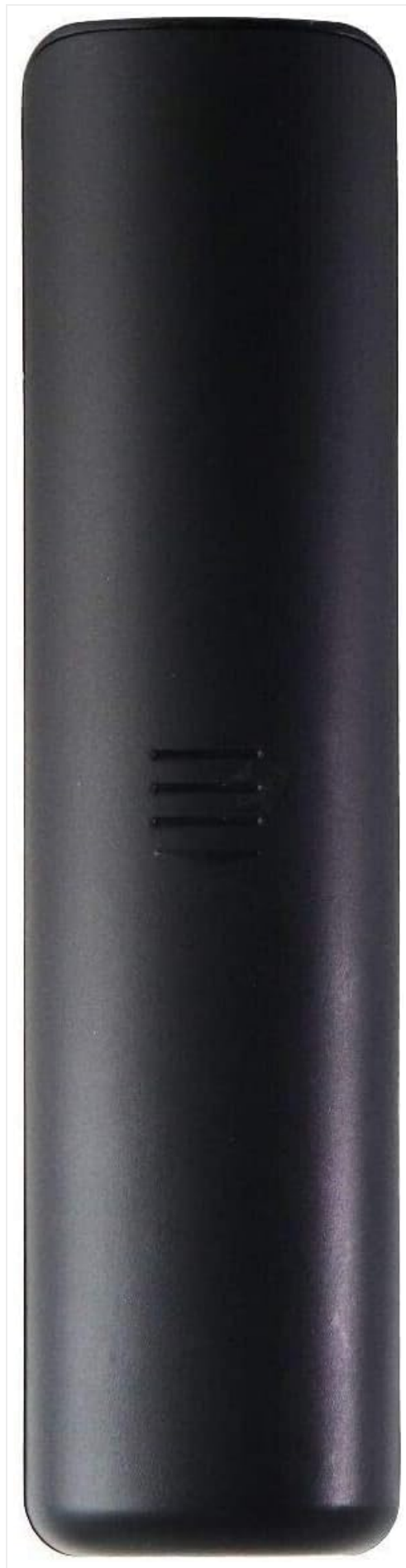
Figure 2: Back of the remote control