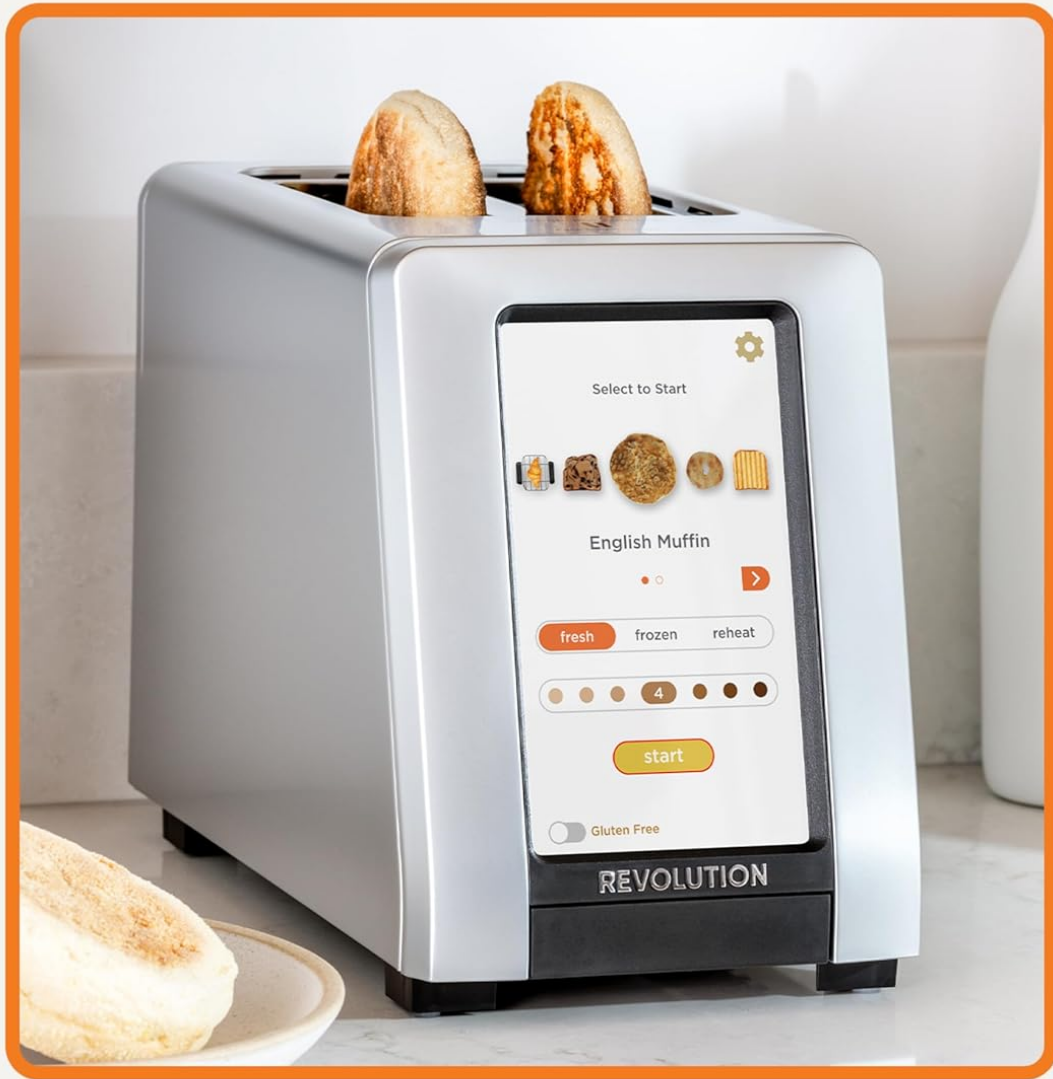
Front view of the Revolution R270 Toaster, showcasing the touchscreen interface with an English Muffin selection. The toaster has a brushed platinum finish.

Check out the NEW upgrade, R180 Connect Plus for upgraded features and the ultimate toasting experience.