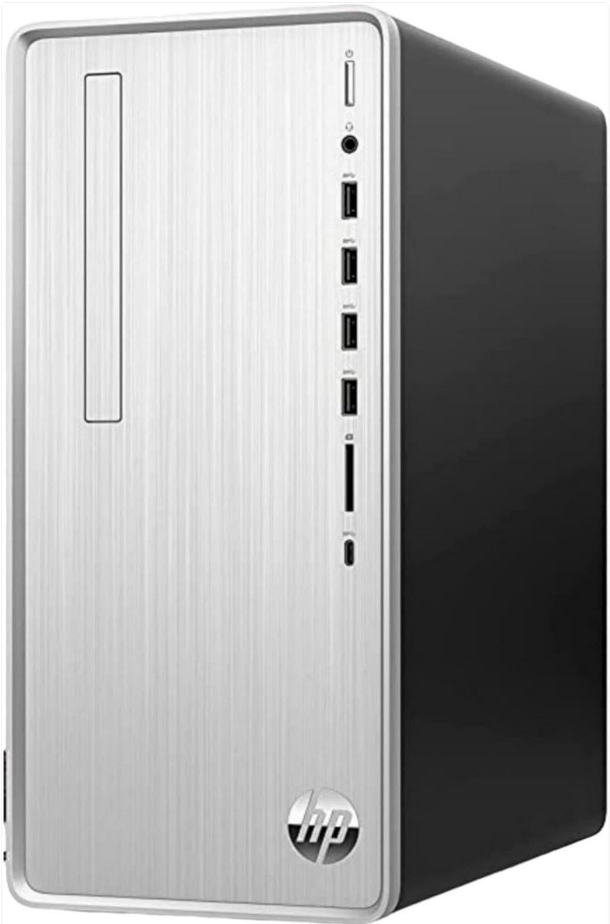
Figure 1: Front view of the HP Pavilion Desktop PC tower. This image displays the sleek natural silver finish of the desktop tower, highlighting its compact design suitable for various spaces.