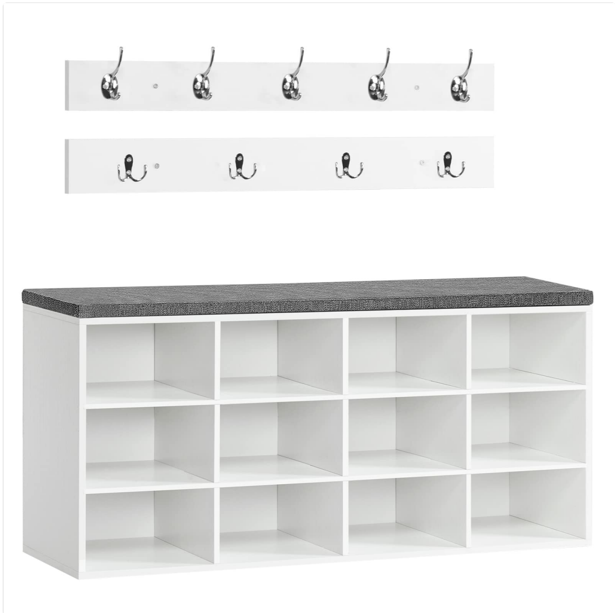
Image: The Hoobro shoe bench and coat rack fully assembled and in use in an entryway.