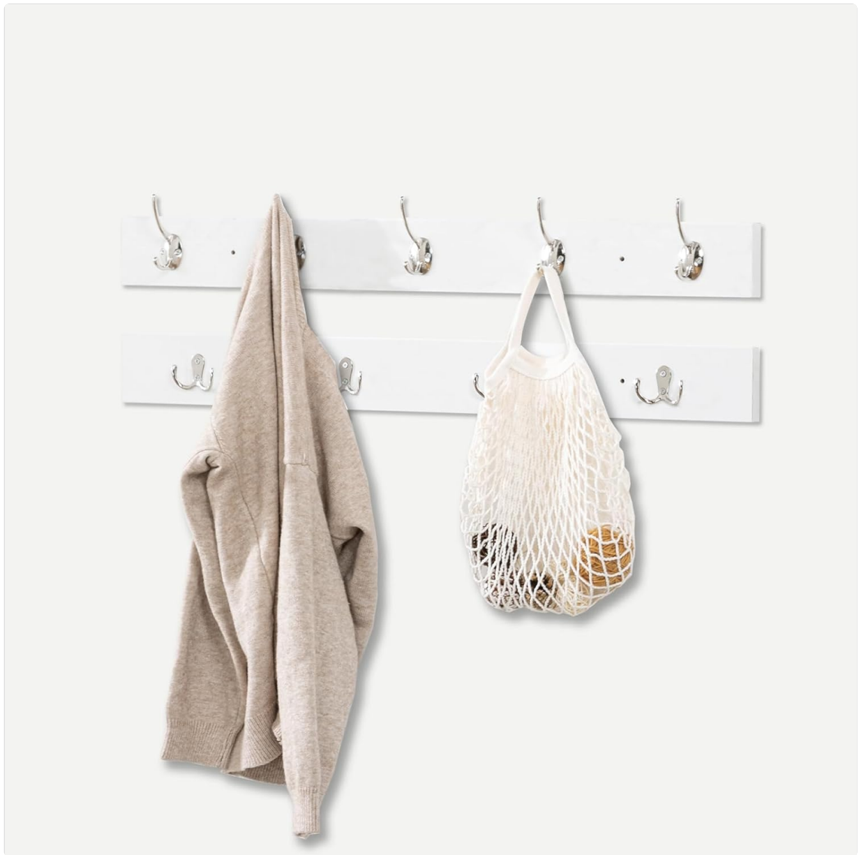
Image: Close-up of the coat rack with hooks, demonstrating its use for hanging garments and accessories.