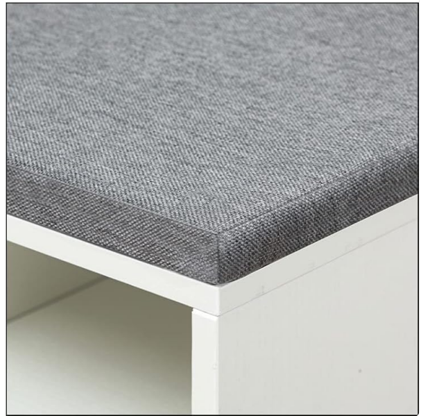
Image: Detailed view of the cushion's Velcro attachment, a shoe compartment, and the cushion's fabric texture.