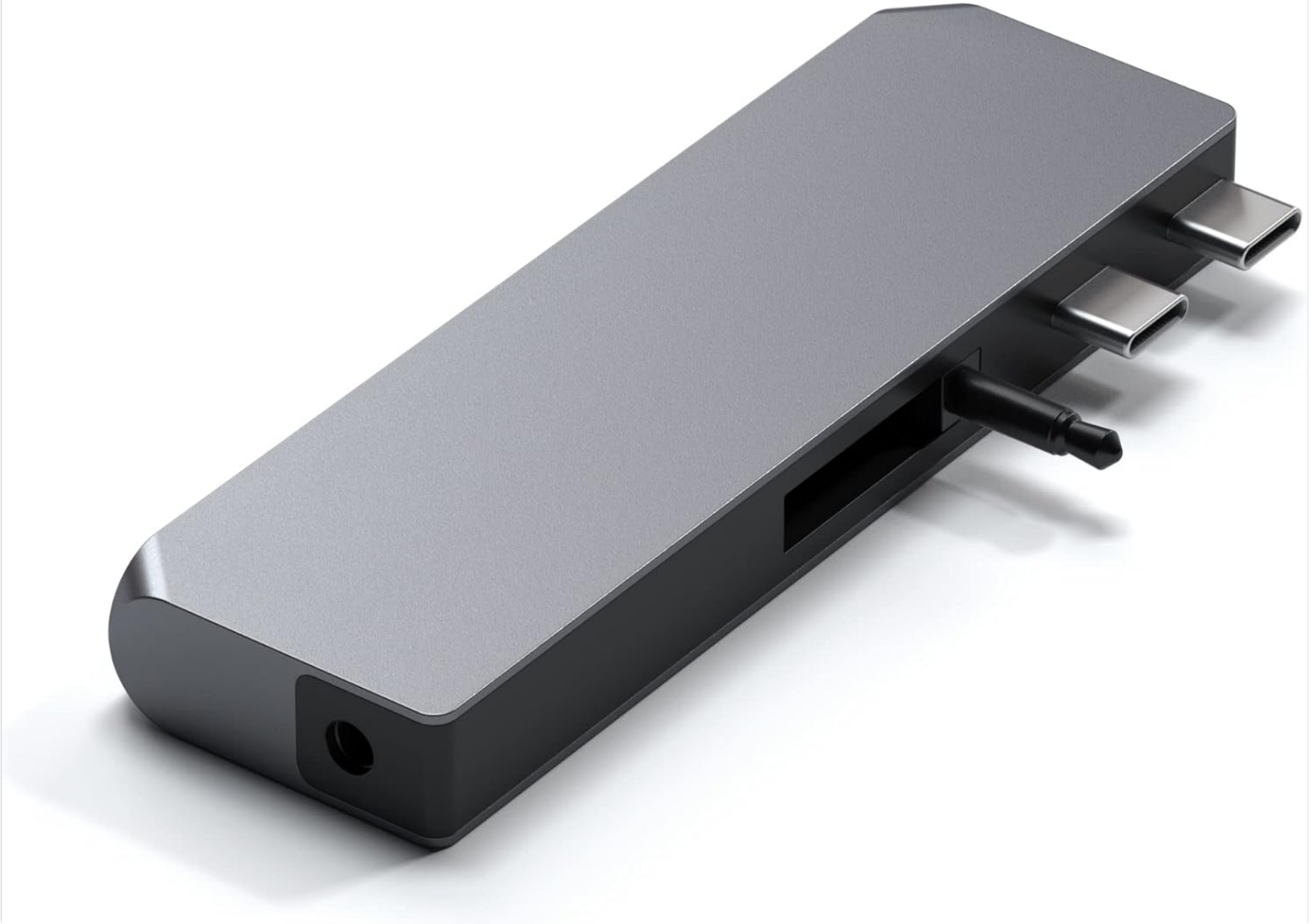
Image: A close-up view of the Satechi Pro Hub Mini securely attached to a MacBook Pro, highlighting the integrated audio jack and its accompanying clip for a seamless fit.

Fits perfectly on your MacBook Pro 14 & 16-inch