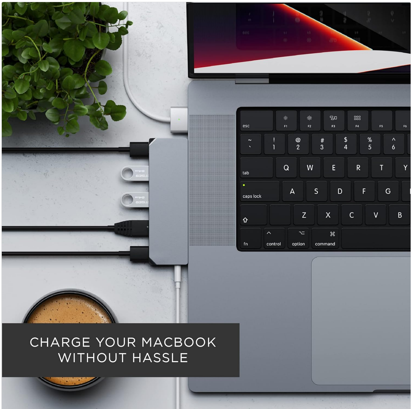
Image: The Satechi Pro Hub Mini connected to a MacBook Pro, illustrating how the hub allows for charging while expanding connectivity.