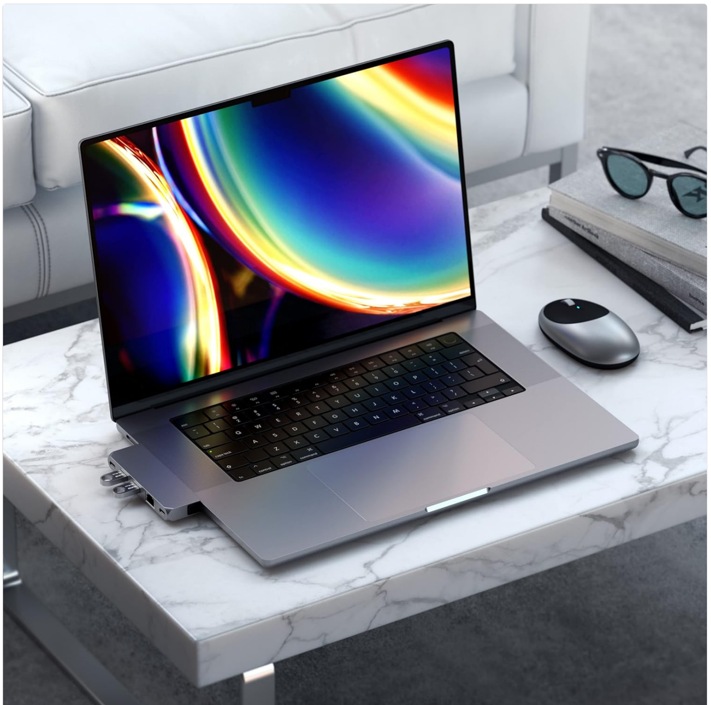
Image: The Satechi Pro Hub Mini integrated into a desktop environment with a MacBook Pro, illustrating its compact design and how it blends with the laptop.