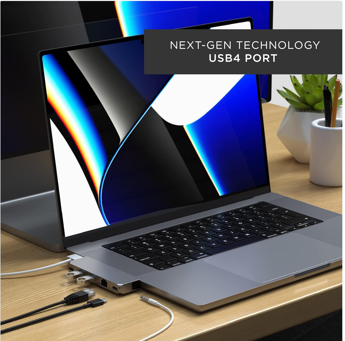
Image: A MacBook Pro connected to an external monitor, demonstrating the display output capability through the Satechi Pro Hub Mini's USB4 port.