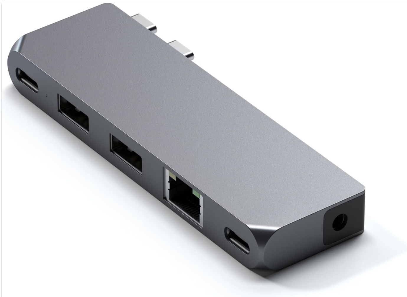
Image: The Satechi USB C Hub Multiport Adapter Pro Hub Mini, showcasing its sleek Space Gray design and compact form factor.