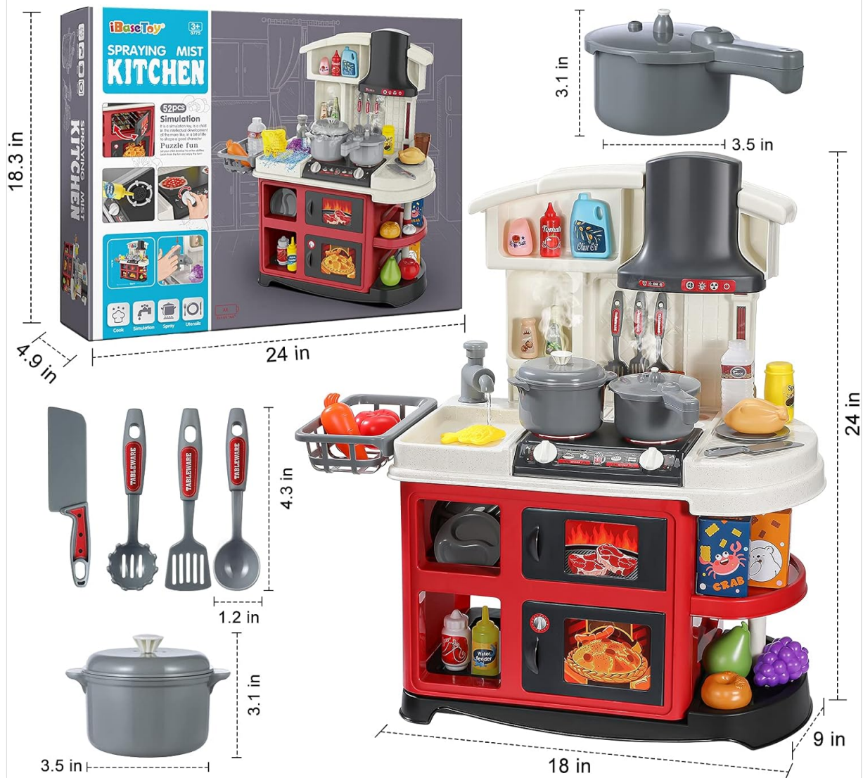
Figure 2.1: Included Kitchen Accessories. This image displays the full set of 52 kitchen food accessories, including various play food items, cooking utensils, pots, and pans.