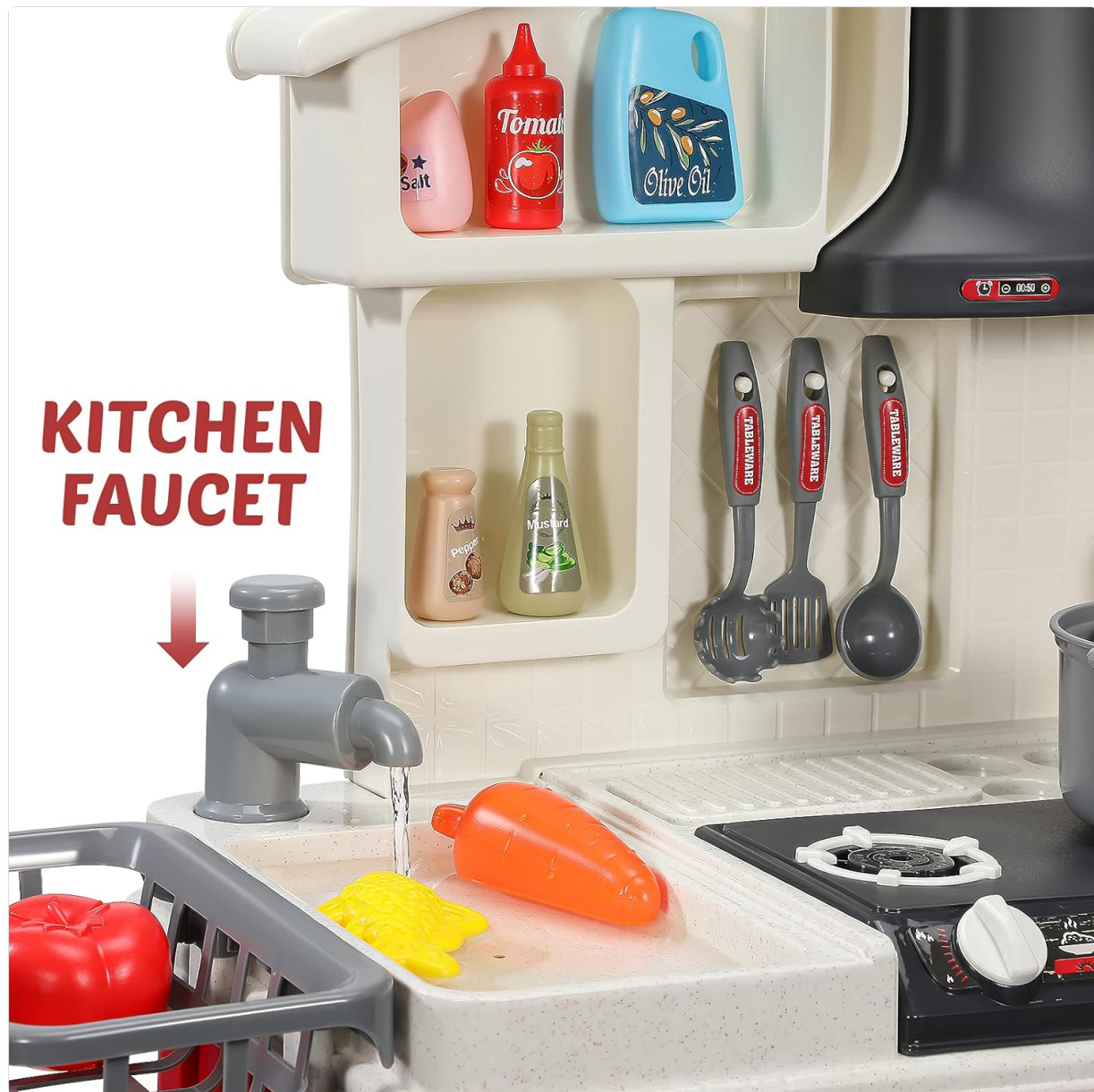
Figure 4.2: Kitchen Faucet Function. This image demonstrates the circulating water system of the sink, with water flowing from the faucet.