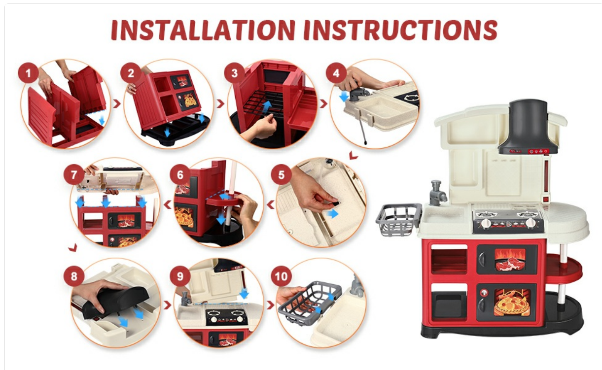
Figure 3.1: Assembly Steps. This image provides a visual, numbered guide for assembling the kitchen playset, illustrating each component's placement.