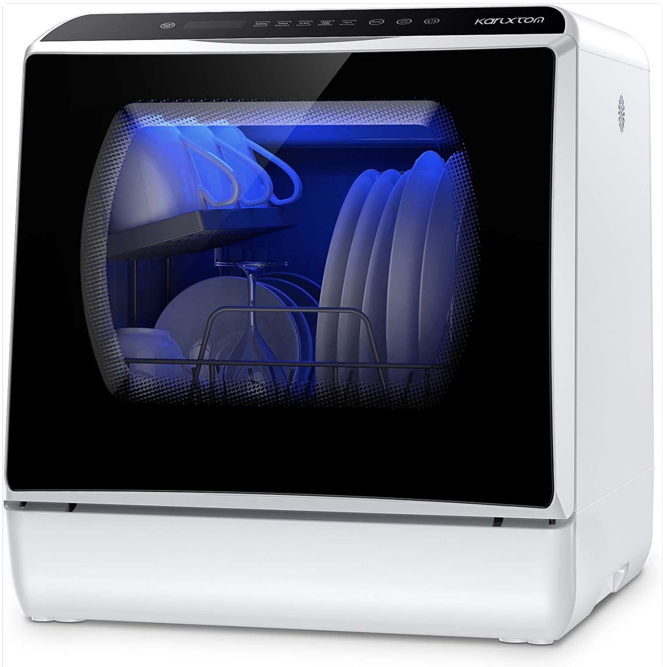
Image: The Karluxton Countertop Dishwasher, showcasing its compact design and interior capacity.