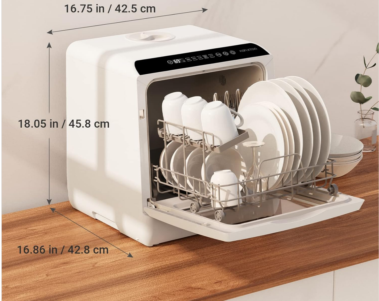
Image: Diagram illustrating the dimensions of the portable countertop dishwasher: 16.75 inches (42.5 cm) width, 18.05 inches (45.8 cm) height, and 16.86 inches (42.8 cm) depth.