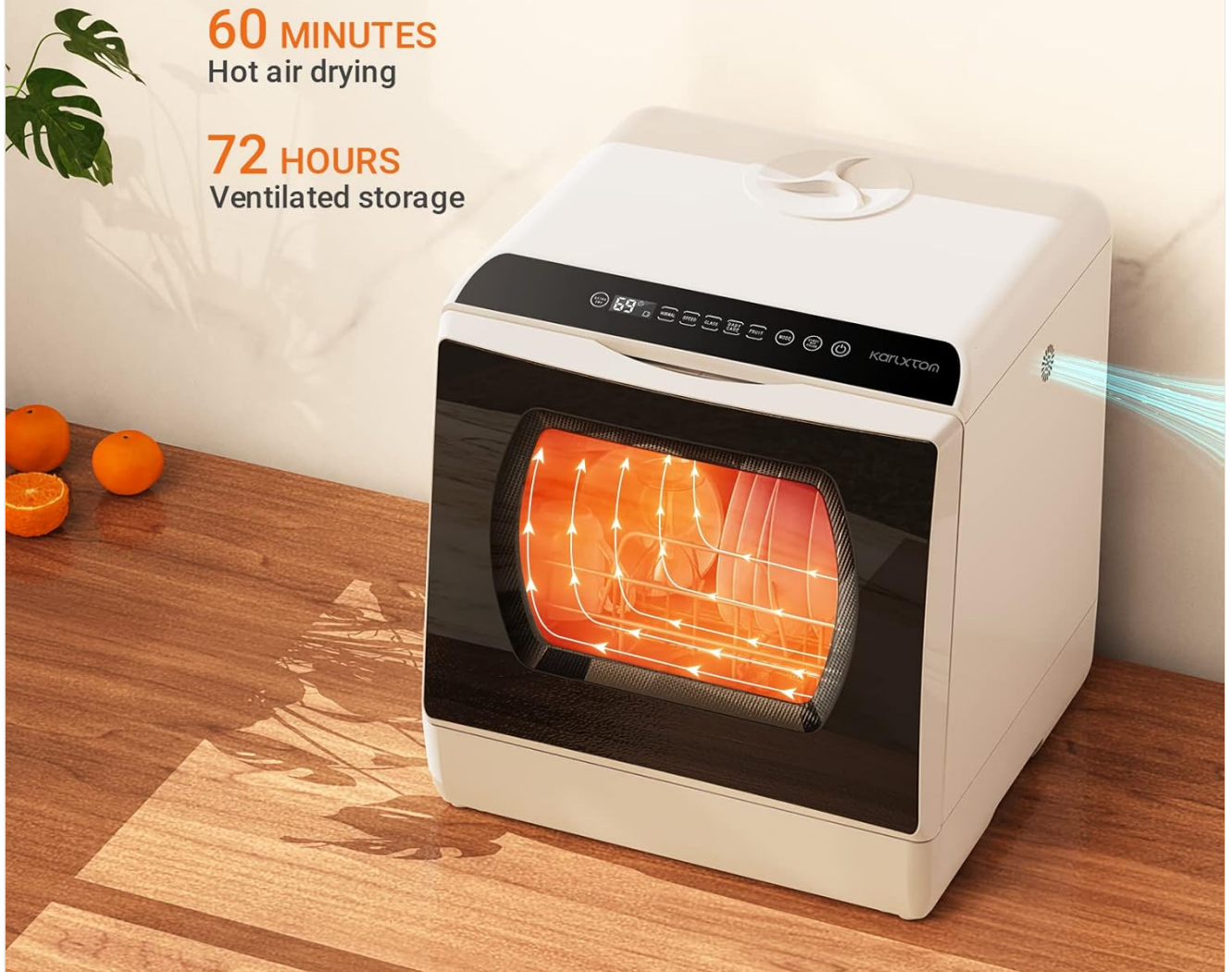
Image: Visual representation of the PTC hot air drying and ventilated storage functions, highlighting 60 minutes of hot air drying and 72 hours of ventilated storage.