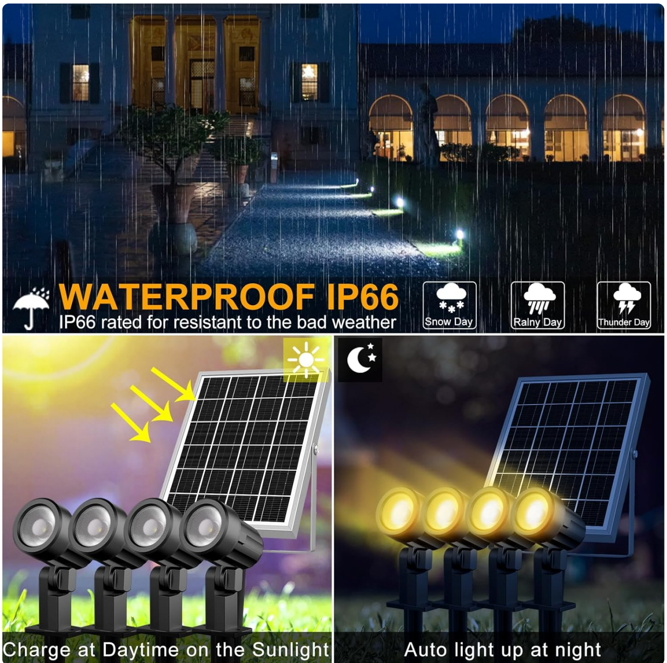
Figure 3: Assembly diagram of the solar light system.