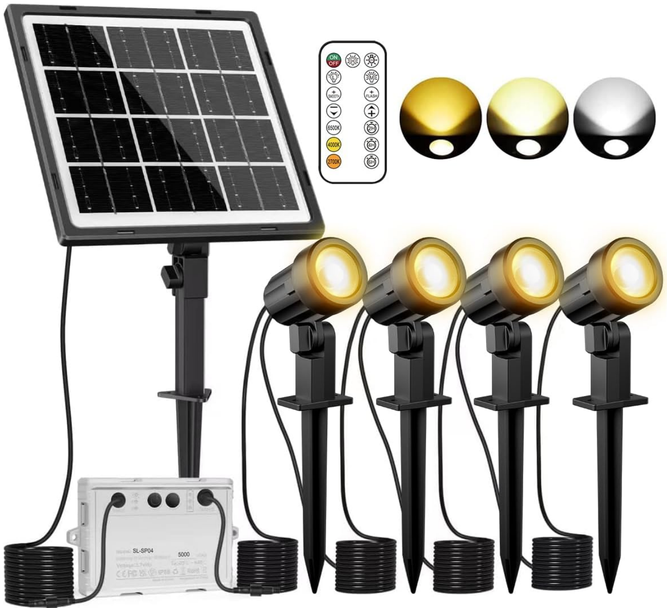
Figure 1: Overview of MEIKEE Solar Spot Lights components.