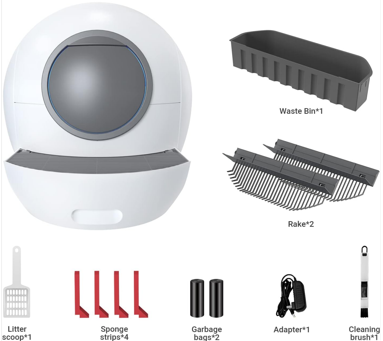
Figure 2: Product List showing included accessories.