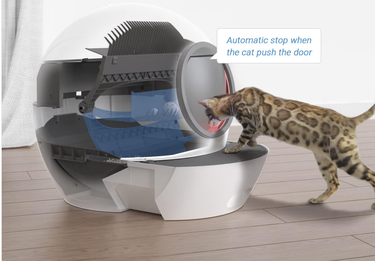
Figure 6: Safety Door Protection, automatically stopping if a cat pushes the door.

Effectively prevent cat from being harmed during machine cleaning