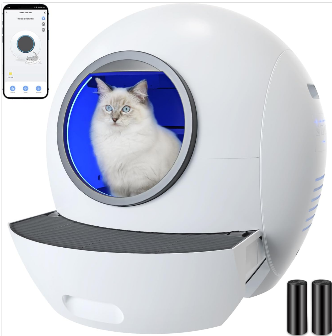
Figure 1: ELS PET Self Cleaning Cat Litter Box (Grey with APP).