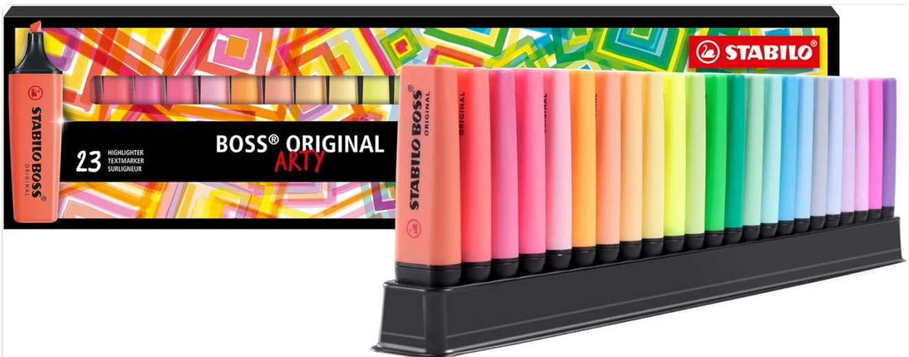
Image: The complete STABILO BOSS ORIGINAL ARTY Highlighter Deskset, showcasing 23 highlighters in a range of neon and pastel colors, arranged in a black desk organizer.

The STABILO BOSS ORIGINAL ARTY Highlighter Deskset offers a comprehensive collection of 23 highlighters in assorted colors, including both vibrant neon and soft pastel shades. Designed for various applications such as highlighting, drawing, and creative projects, these highlighters are known for their distinctive shape and reliable performance. This manual provides essential information for the proper use, care, and maintenance of your STABILO highlighters.