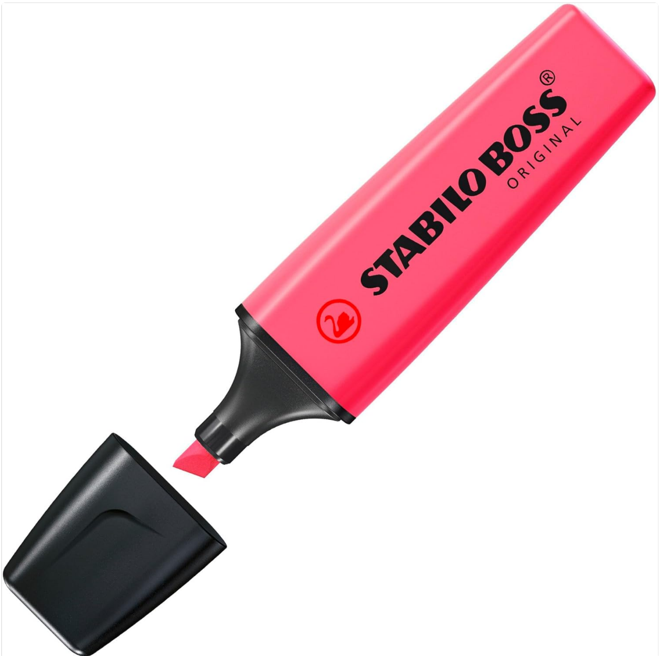
Image: A close-up view of the chisel tip of a STABILO BOSS ORIGINAL highlighter, demonstrating its broad application on paper.