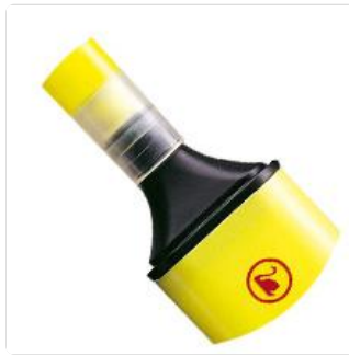
Image: A graphic depicting the refill mechanism for STABILO BOSS highlighters, highlighting their eco-friendly design.