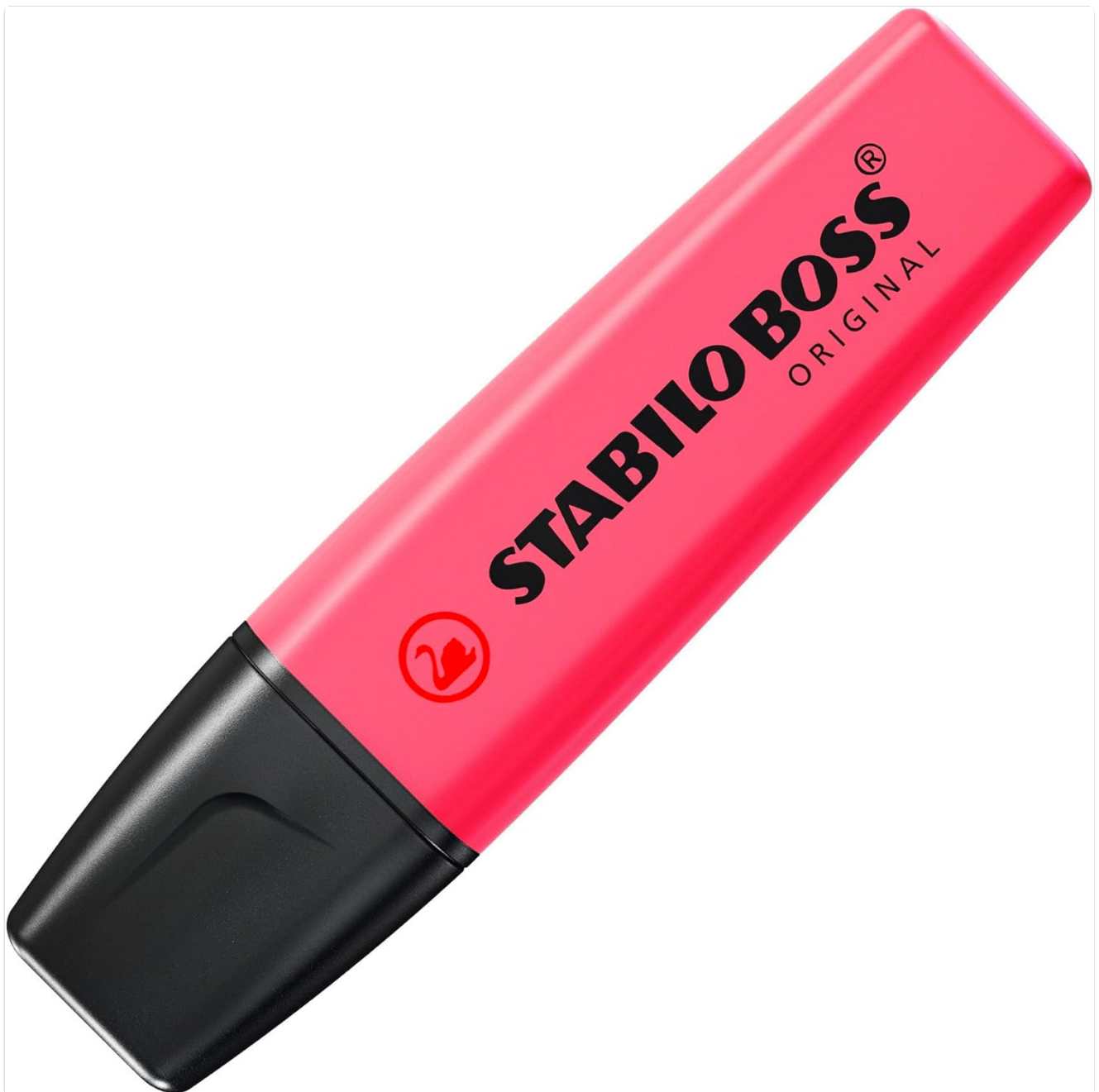
Image: A pink STABILO BOSS ORIGINAL highlighter with its black cap removed, ready for use.