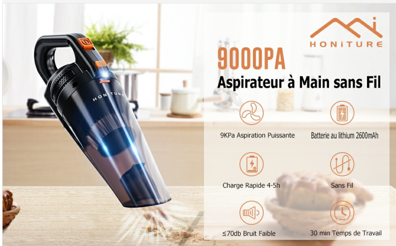
Image: A detailed view of the vacuum cleaner, highlighting its main body, dust cup, filter, power button, and charging port.

Familiarize yourself with the components of your vacuum cleaner: