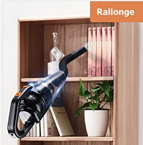
Image: The vacuum with the extension tube attached is shown cleaning dust from a bookshelf.