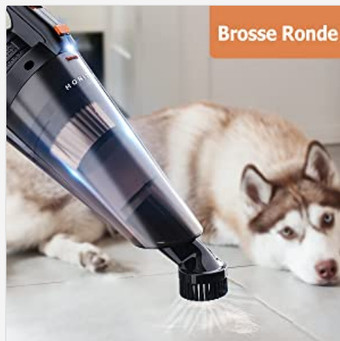
Image: The brush nozzle is used to clean pet hair from a tiled floor, with a dog lying nearby.