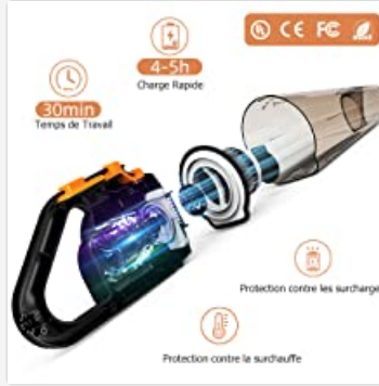
Image: An exploded view of the vacuum cleaner's internal components, illustrating the battery and its protective features during charging.