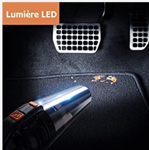
Image: The vacuum's LED light is shown illuminating dirt and debris on a car's floor mat, enhancing visibility during cleaning.

The vacuum cleaner is equipped with an LED light to illuminate dark areas, making dust and debris more visible. This is particularly useful for cleaning under furniture, car seats, or in dimly lit compartments.