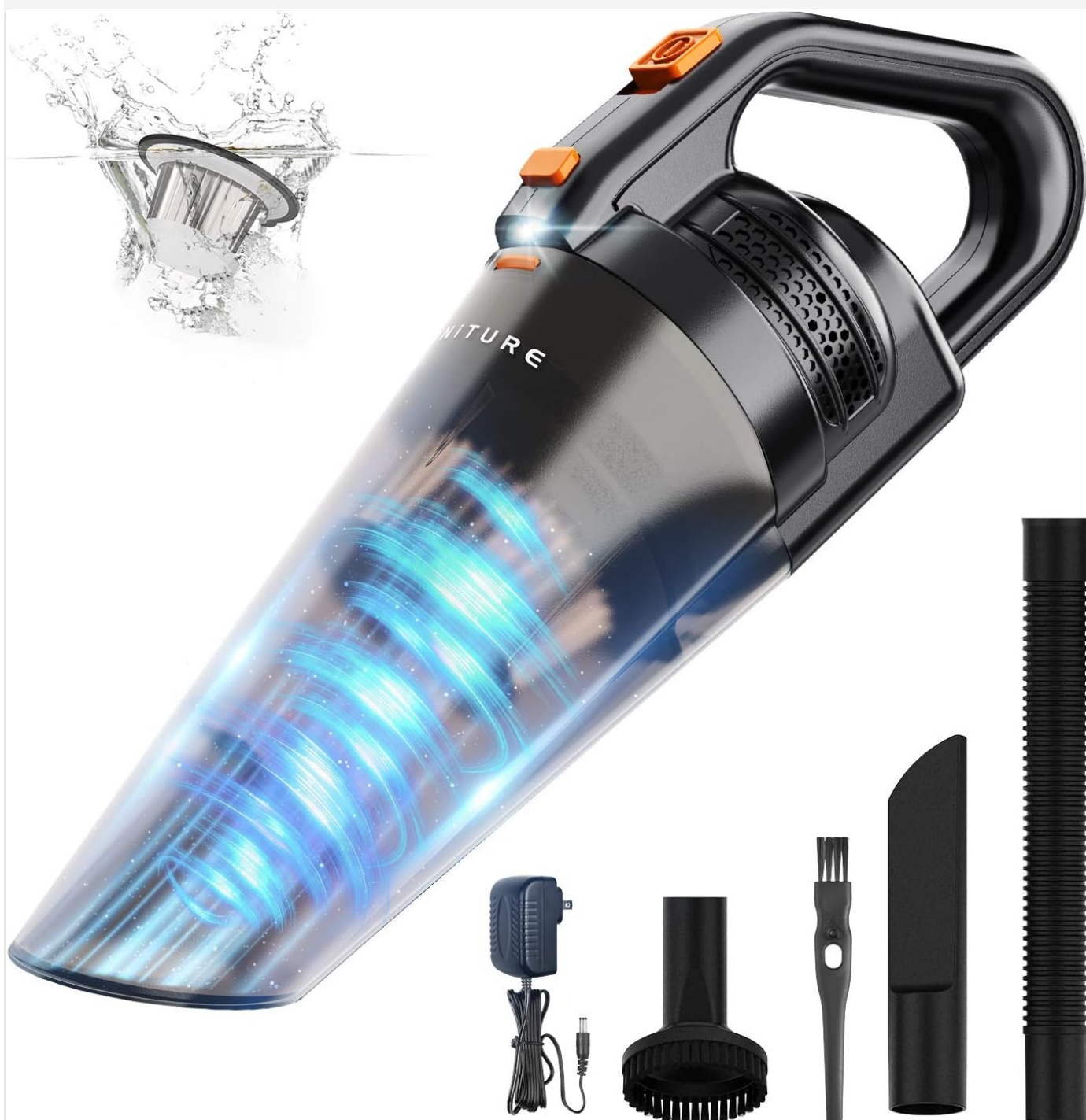
Image: The HONITURE handheld vacuum cleaner shown with its various attachments and charging adapter.