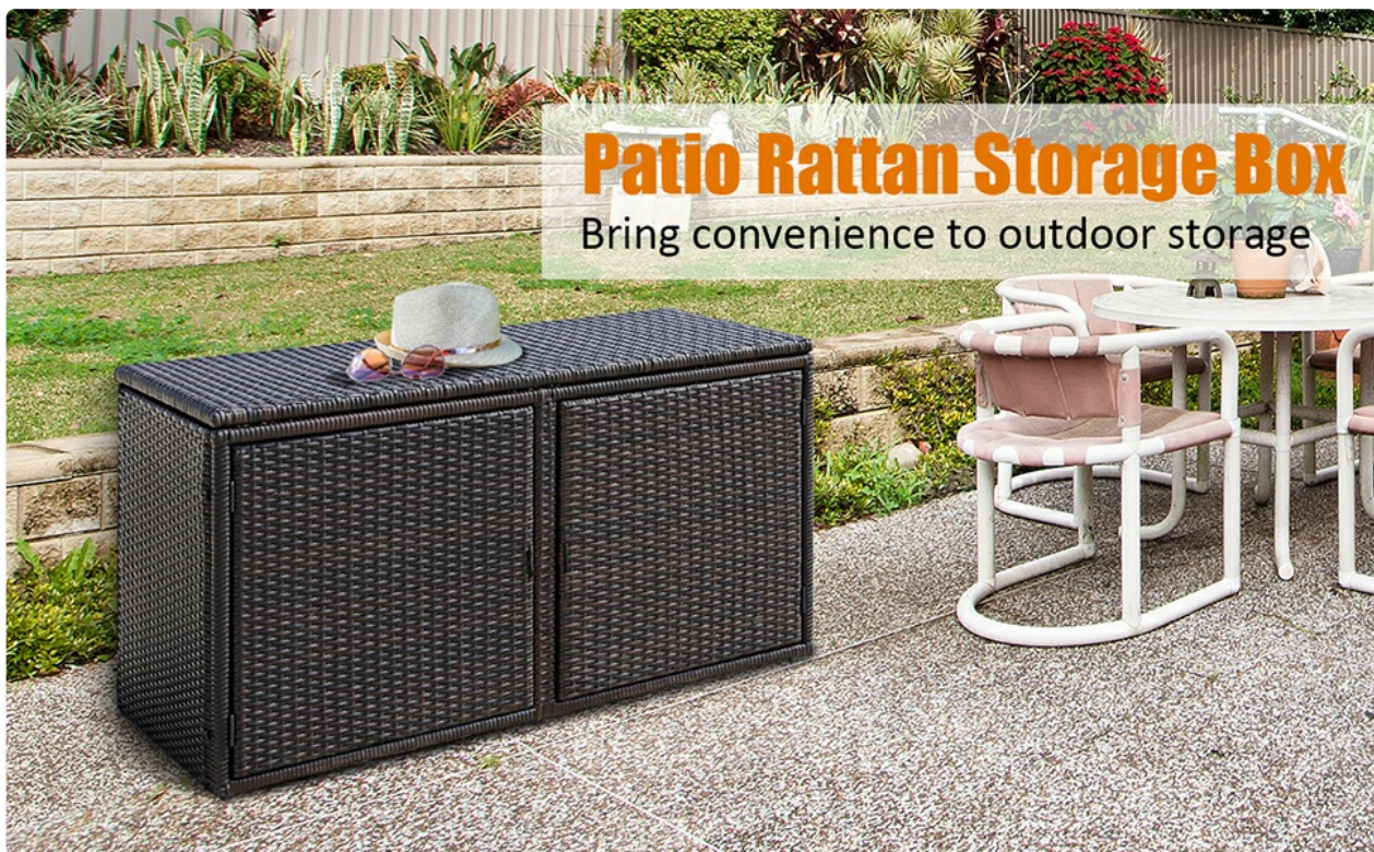
Image 5.1: Demonstrating the dual access points of the storage box.