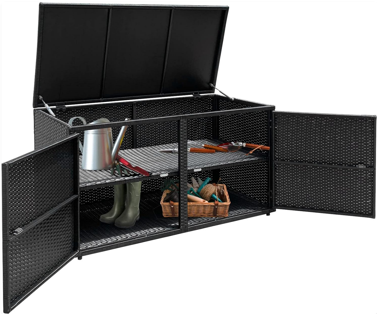
Image 1.1: The HAPPYGRILL 88 Gallon Outdoor Wicker Storage Deck Box, open to display its internal shelf and storage capacity.