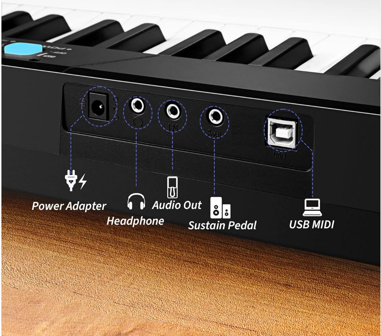
Figure 4.1: Connectivity ports on the Starfavor 88 Key Keyboard.