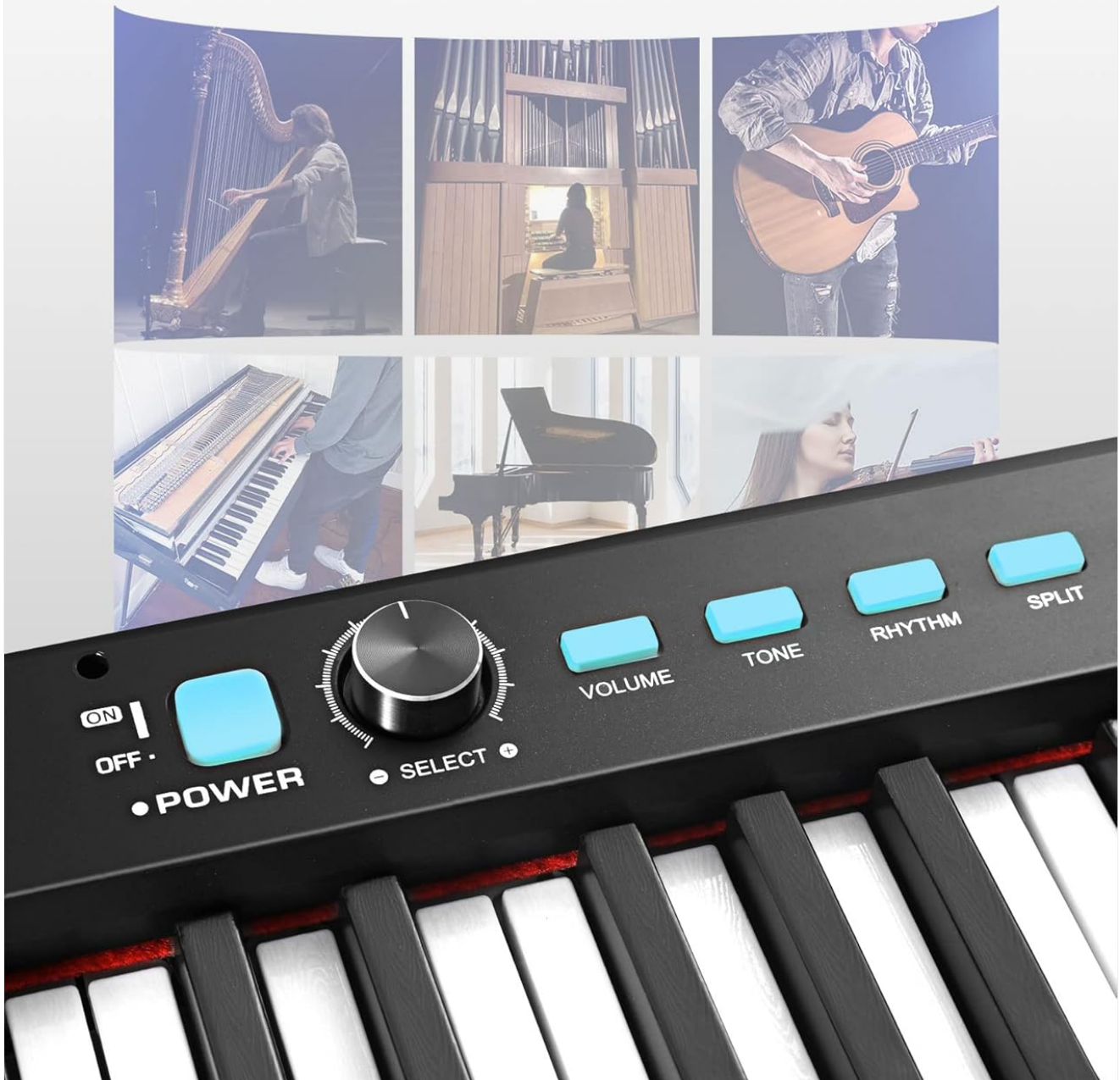
Figure 5.1: Main control panel of the keyboard.