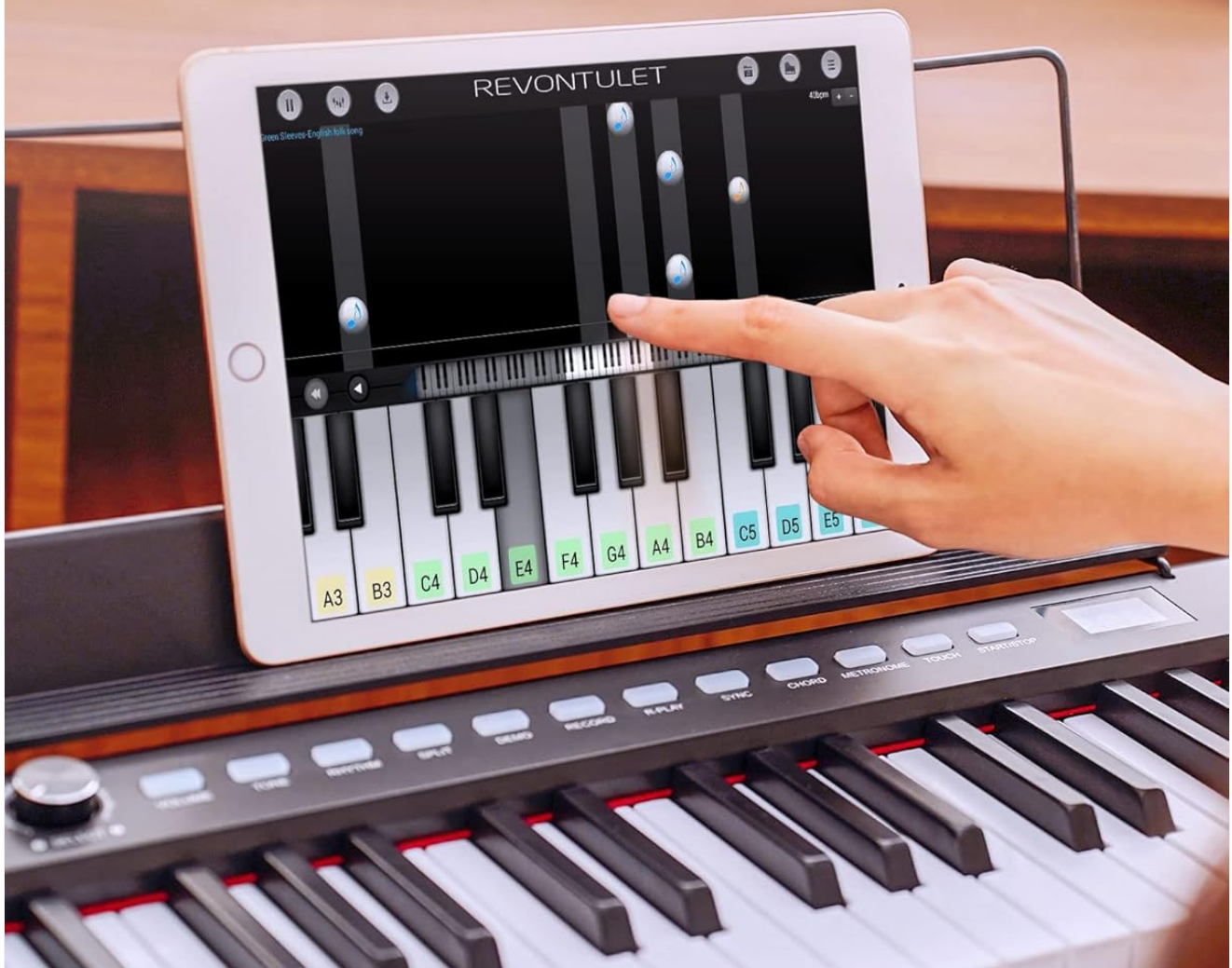
Figure 5.3: The keyboard in Learning Mode with a connected smart device.