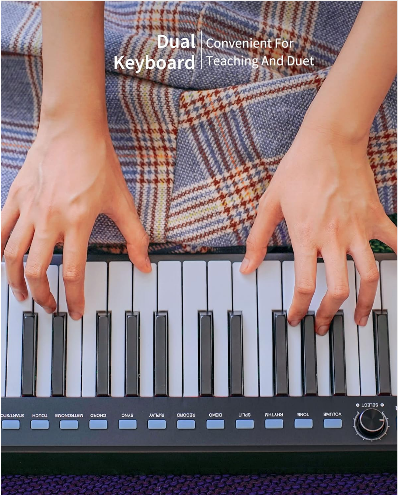
Figure 5.2: Demonstration of the Dual Keyboard feature.