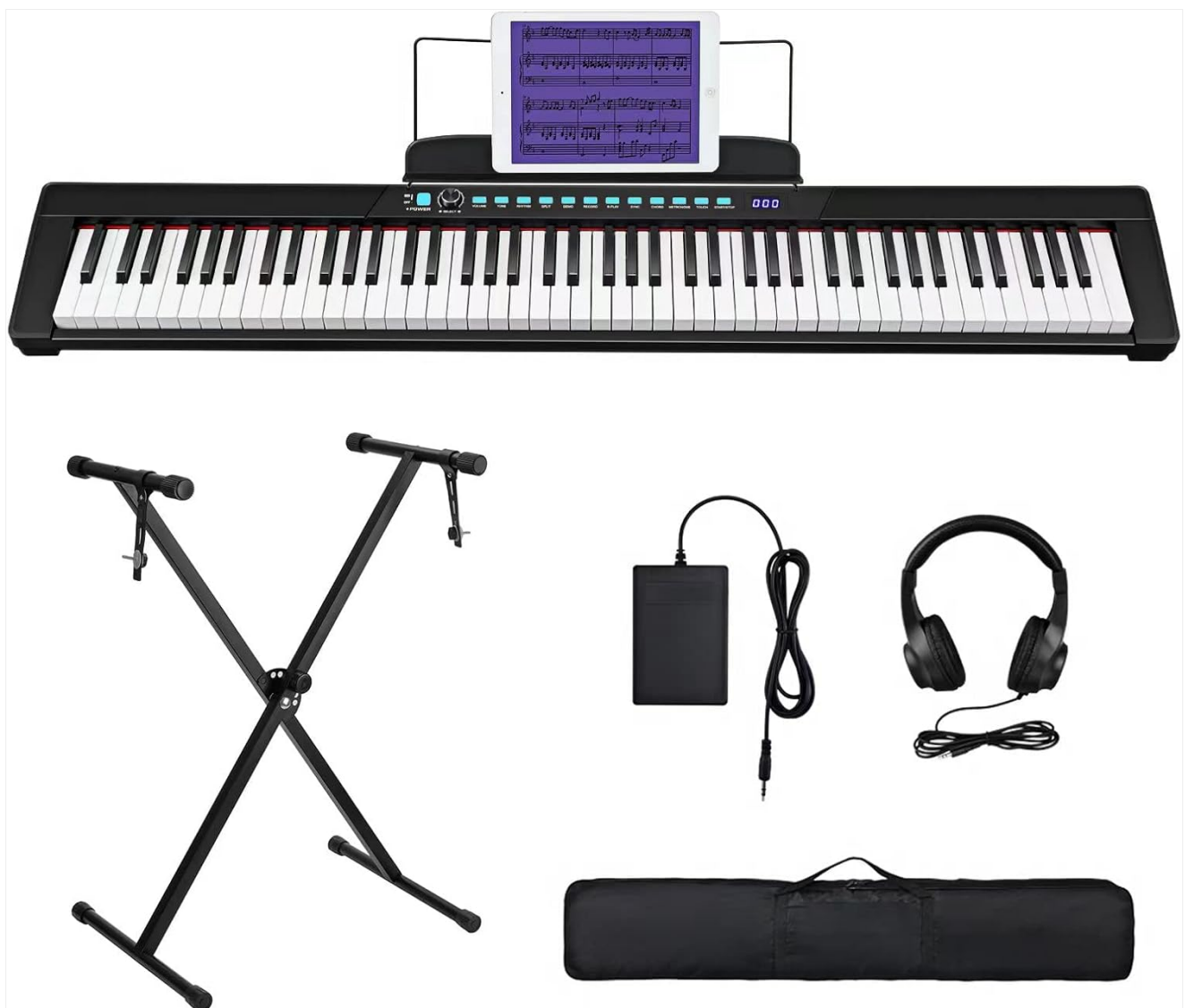
Figure 3.1: Overview of the Starfavor 88 Key Keyboard and its included accessories.