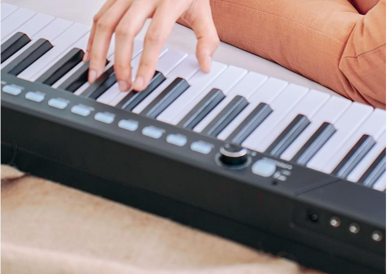
Figure 1.1: The Starfavor 88 Key Keyboard demonstrating its thin and portable design, suitable for playing anywhere.