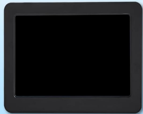
Figure 4.1: The large, clear display for easy reading.

Display Console Frame Dimensions : 5.2x3.8x0.87inch LCD Dimensions: 4.6x3.2inch