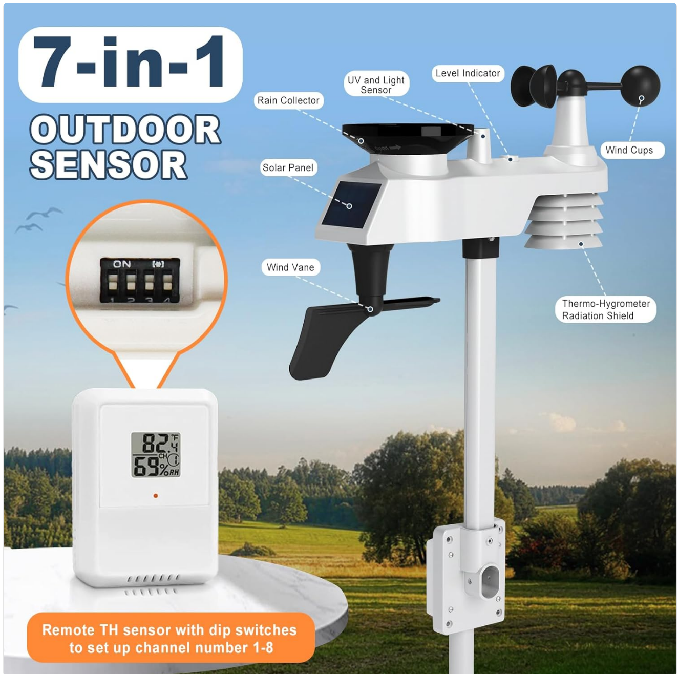
Figure 2.2: Components of the 7-in-1 Outdoor Sensor Array and Remote Sensor.