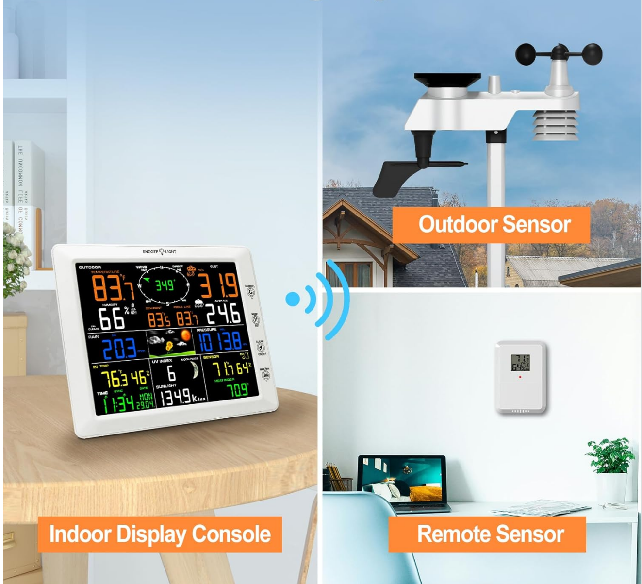
Figure 3.1: Recommended placement and transmission range.