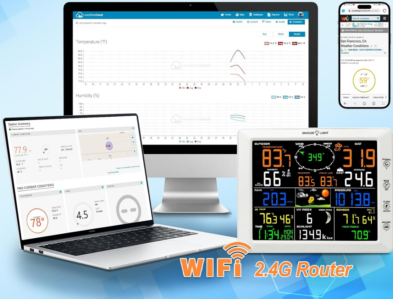
Figure 4.3: Wi-Fi connectivity and online data sharing.