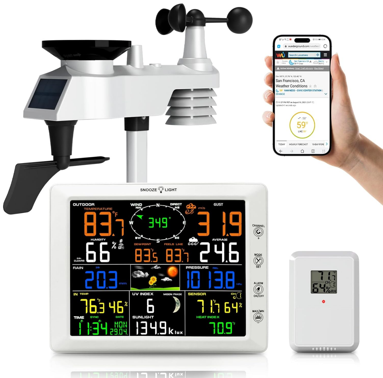
Figure 1.1: Overview of the AIRAIN TECH WiFi Weather Station components.