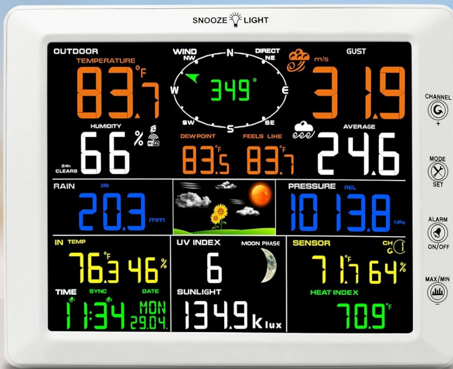
Figure 2.1: Comprehensive 14-in-1 weather monitoring capabilities.