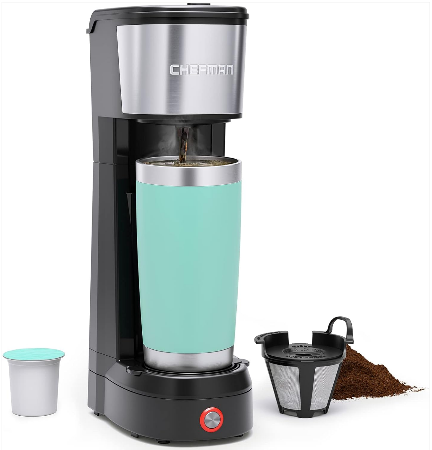
Image: The Chefman InstaCoffee Max brewing into a travel mug, highlighting its quick 30-second brewing capability.