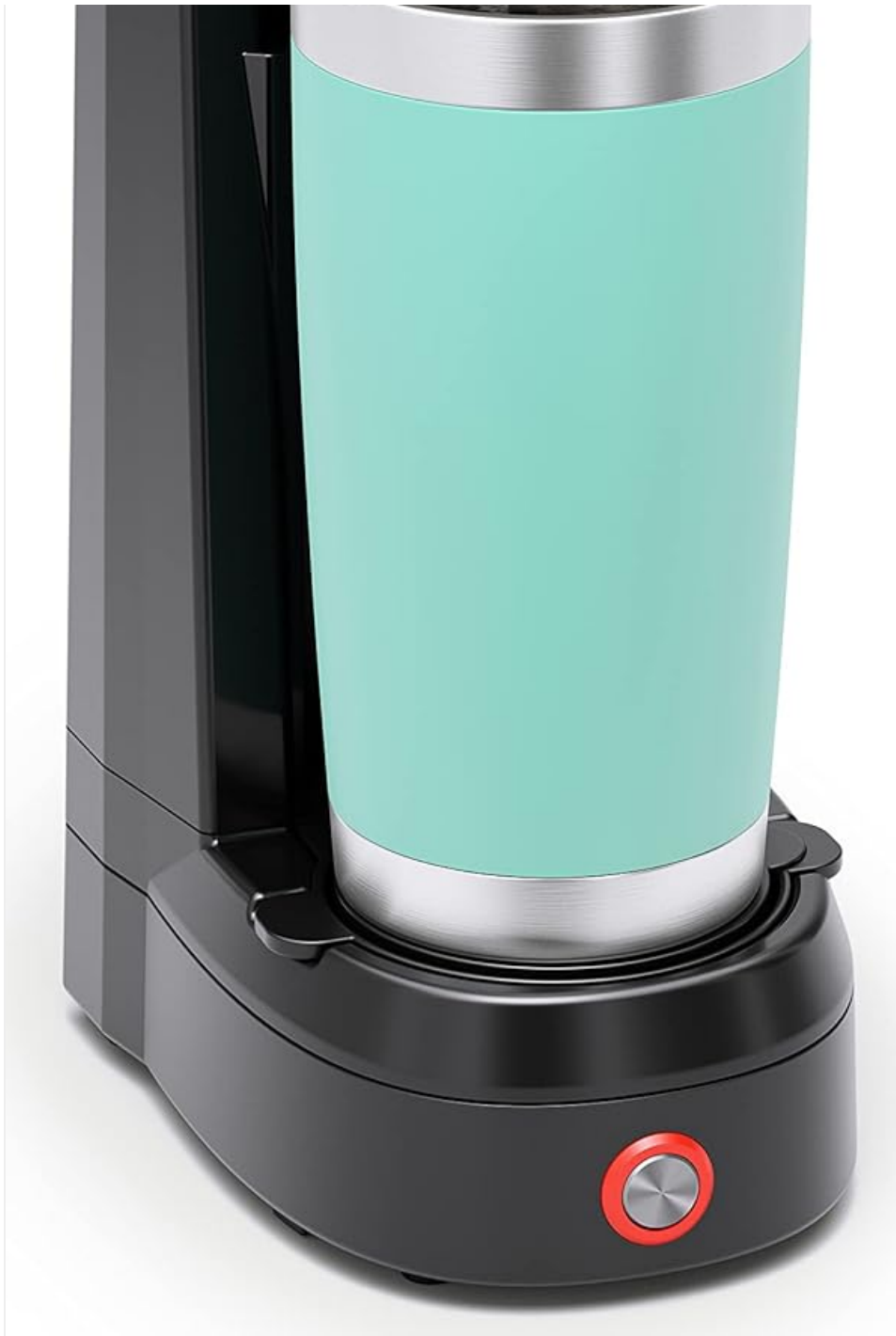
Image: A close-up view of the Chefman InstaCoffee Max actively brewing coffee into a travel mug, demonstrating the brewing process.