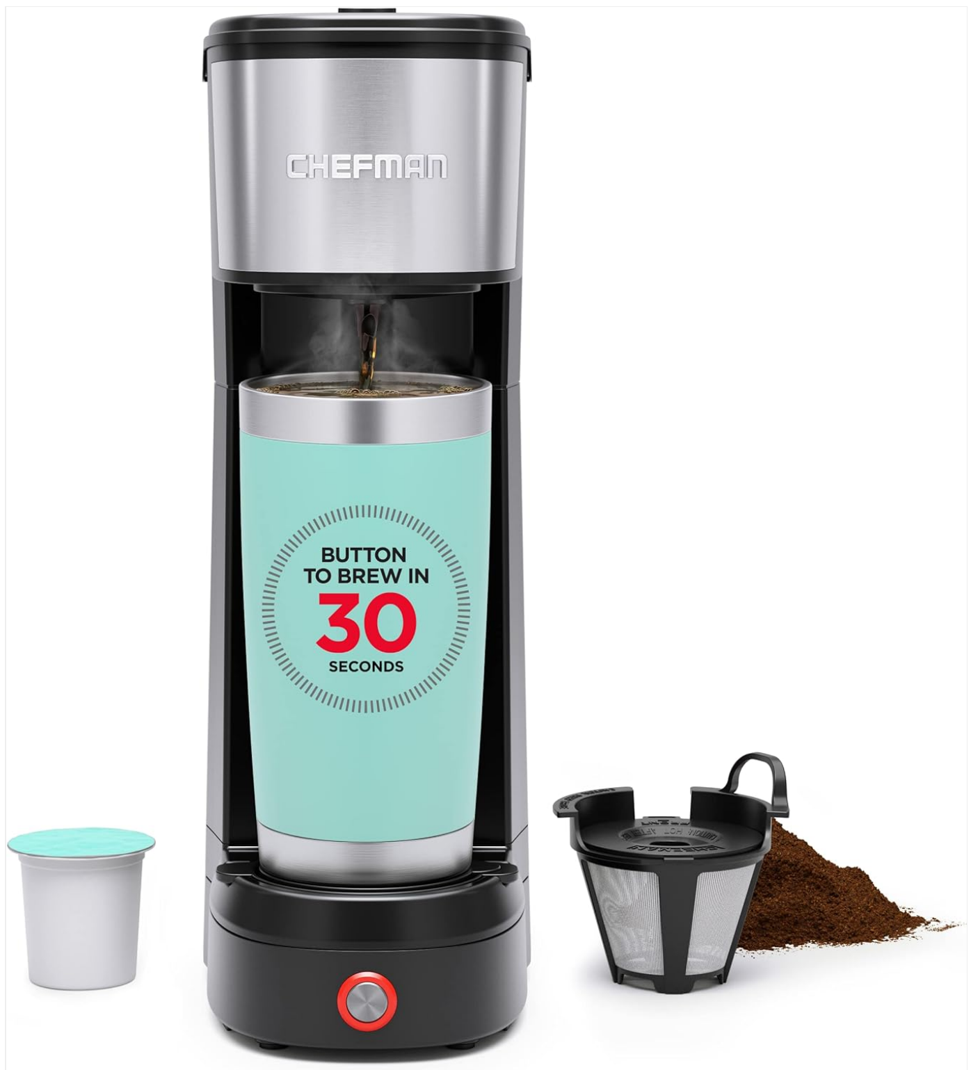
Image: The Chefman InstaCoffee Max coffee maker, showcasing its sleek design, a K-Cup, and the reusable ground coffee filter.