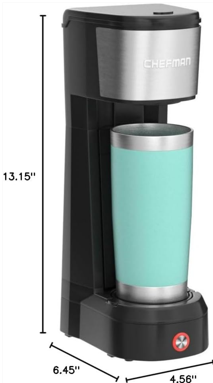
Image: Diagram showing the dimensions of the Chefman InstaCoffee Max: 4.56"D x 6.45"W x 13.15"H.