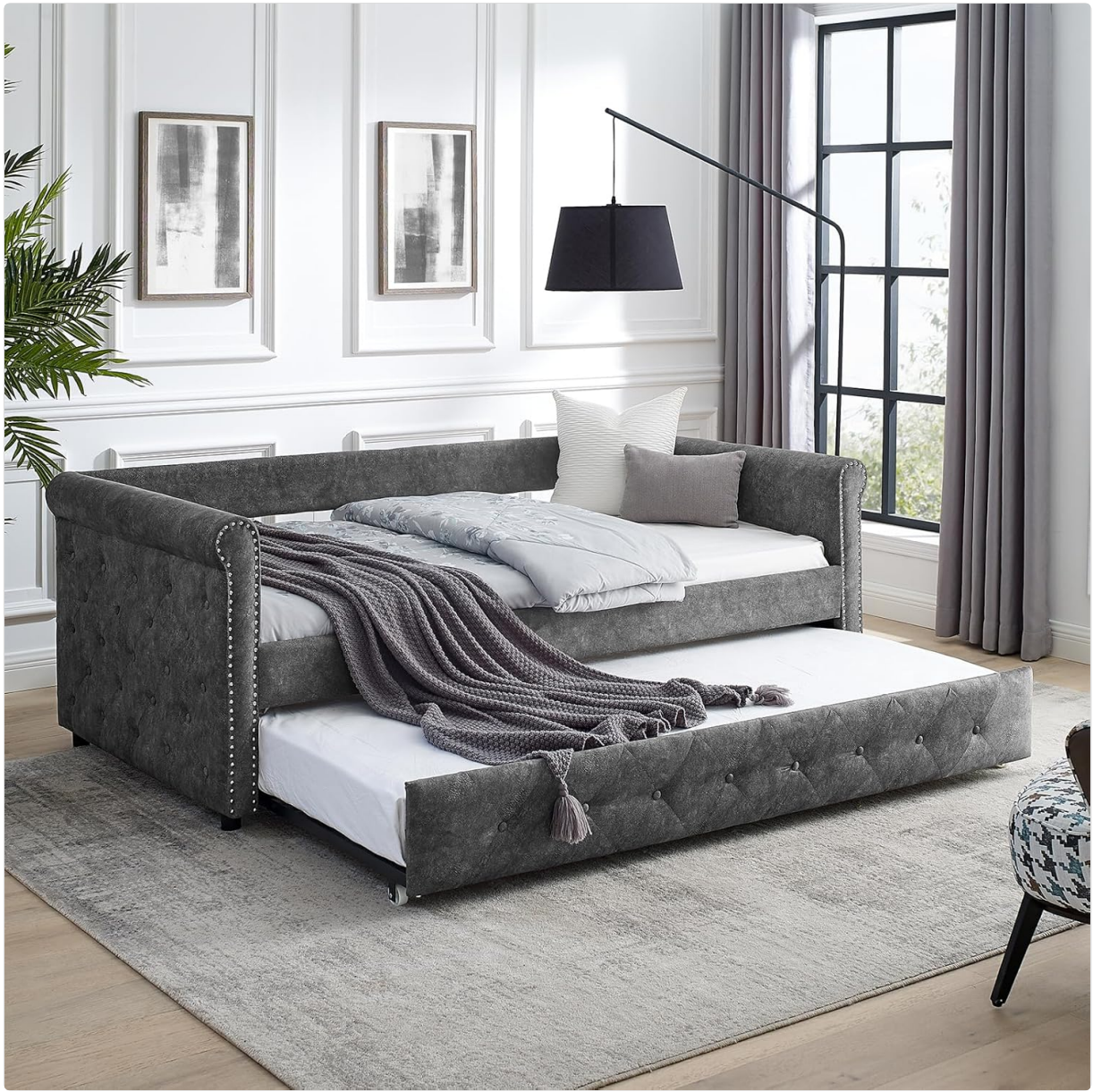
Image showing the Antetek Daybed with its trundle fully extended, ready for use.