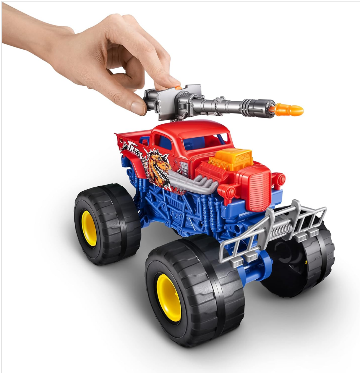
Image: Attaching the fireable weapon to the monster truck.

designated slot on the truck's roof and press firmly until it clicks into place. Ensure it is securely attached before use.