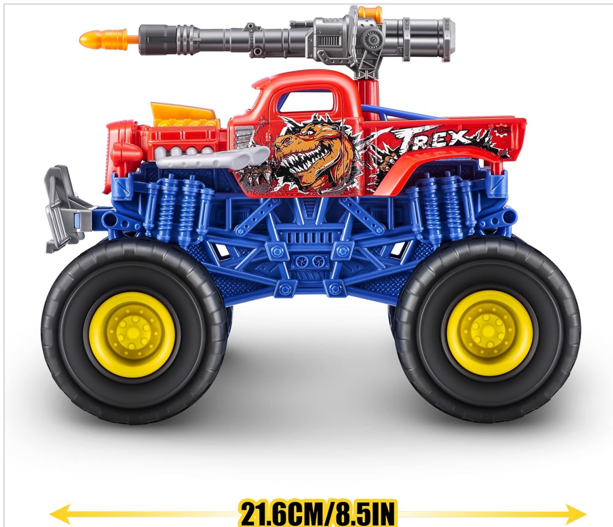
Image: Side view of the Monster Truck with dimensions.